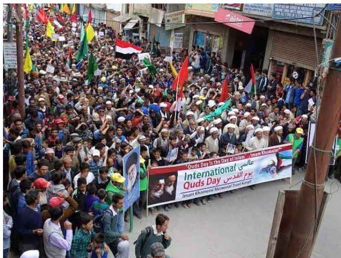
Quds Day rally in Kashmir

Revolutionary Activities Abroad: Iranian-affiliated agents and entities have helped grow Quds Day internationally, organizing events in over 80 countries annually. In addition to shows of support for the Palestinians and denunciations of Israel, displays of support for Iran and Hezbollah – including flags, and posters depicting Ayatollah Khomeini, Supreme Leader Ali Khamenei, and Hezbollah Secretary General Hassan Nasrallah – are a staple at Quds Day events worldwide.