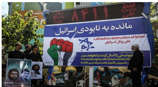
Countdown until Israel’s destruction

Iranian politicians abidingly attend Quds Day rallies and deliver anti-Israel diatribes to showcase their steadfast commitment to the regime’s opposition to Israel. Tehran’s June 2017 Quds Day festivities featured myriad examples of incitement . The IRGC showcased several ballistic missiles capable of striking Israeli territory, and the regime debuted a huge digital countdown display ticking down 8411 days until the demise of Israel, a reference to a 2015 statement by Supreme Leader Khamenei predicting that Israel would cease to exist within 25 years. Addressing the gathering, President Hassan Rouhani declared that Israel supports terrorists in the region, and Parliament speaker Ali Larijani called Israel “the mother of terrorism.” The regime issued a communiqué to wrap up Quds Day vowing support for the path of “resistance and intifada” against Israel, and criticizing Israel’s “attempts to Judaize the occupied territories and destroy Palestine’s national and historical identity.”