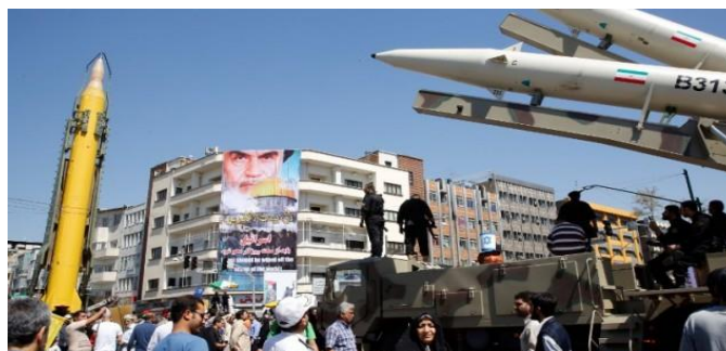
Ballistic missiles on display

Quds Day fits into Khomeini’s revolutionary paradigm as a show of resistance in support of “oppressed peoples” against “arrogant, oppressive powers,” and Khomeini went so far as to issue a fatwa declaring the elimination of the “Zionist entity” as a religious duty incumbent on Muslims . While ostensibly Quds Day’s primary focus is on the Israeli-Palestinian conflict, Iran sees this localized struggle as part of a broader regional initiative. By hosting Quds Day celebrations around the world, Iran seeks to frame the Palestinian struggle as a pan-Islamic cause, and to claim the leadership mantle as the preeminent defender of the Palestinians.