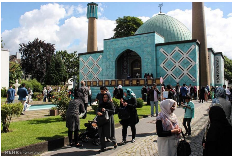
Imam Ali Mosque in Hamburg, Germany

Pro-Iranian activities in Germany center largely around the Islamic Center of Hamburg ( Islamisches Zentrum Hamburg , or IZH), an umbrella institution which plays a financial and organizational role in the operation of Shia associations around Germany. The IZH seeks to promote the Islamic Revolution in Germany via " brochures, events, prayers, rallies, and other activities . According to Germany's intelligence agency, " Towards the outside world, the IZH acts as a mere religious organization that does not include political activities in its direct field of work. ... In reality