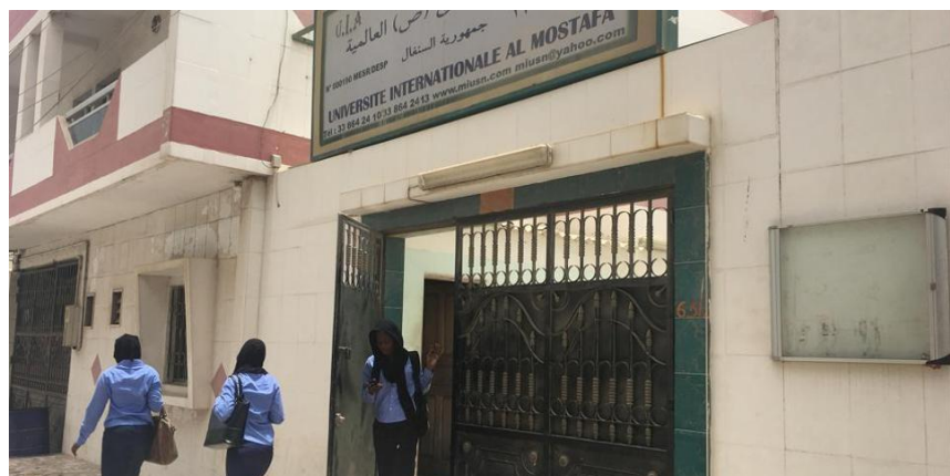
Al-Mustafa University branch in Dakar, Senegal

Al-Mustafa International University has also established a branch in Dakar,