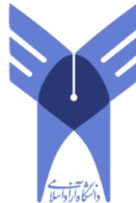
Islamic Azad University Logo

Overview: Islamic Azad University (IAU) was established in 1982 as a nominally private technical and engineering university by a decree of Ayatollah Khomeini . Ali Akbar Hashemi Rafsanjani , a member of Ayatollah Khomeini’s inner circle and two-term former president, played the leading role in conceptualizing and establishing Islamic Azad University , and went on to serve as head of the university’s founder’s committee, akin to chairman of the board, for over three decades until his death in January 2017. Rafsanjani was known as a pragmatic backer of limited social and economic liberalization, rather than ideological rigidity, as the best possible guarantor of sustaining Iran’s Islamic Revolution.