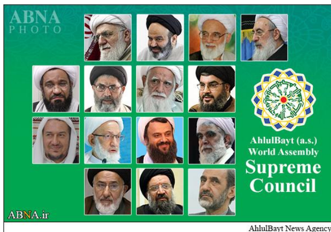
AhlulBayt World Assembly Supreme Council

Overview: The Ahlul Bayt World Assembly (ABWA) is an internationally active Iranian NGO which functions as the umbrella over a network of Iranian-backed religious, cultural, and educational institutions tasked with disseminating Ayatollah Khomeini’s revolutionary Islamist ideology around the world. Ahlul Bayt refers to the “ People of the House (of the Prophet) ,” and in the Iranian context specifically refers to Shi’a Muslims (partisans of, or Shi’at ‘Ali). The ABWA is functionally the link between the Iranian Shi’a clerical establishment and foreign Shi’a clerics , and also links Shi’a communities around the world to each other.