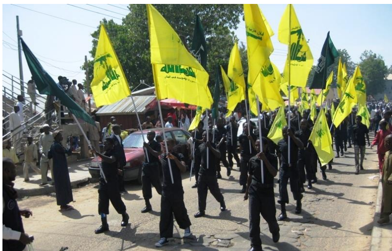
IMN members march with Hezbollah flags during 2015 Quds Day rally

The IMN denies operational links to Nigeria's Lebanese community and Hezbollah, but Nigerian security analysts dispute this assertion. According to Cheta Nwanze, head of research at SBM Intelligence, " The Nigerian State has a trove of information linking the IMN with