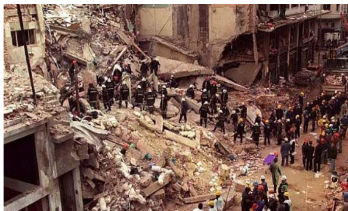
Aftermath of the 1994 AMIA bombing

Less than two years after the attack on the Israeli Embassy, as investigators were still in the process of piecing together what had happened, Iran carried out another bombing targeting Buenos Aires’ Jewish community. On the morning of July 18, 1994, a Hezbollah operative detonated a suicide car bomb laden with 300-400 kilograms of explosives in front of the Asociación Mutual Israelita Argentina (AMIA) Jewish community center, killing 85 and wounding over 200.