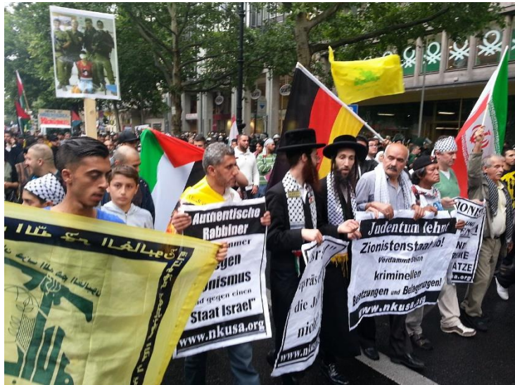
2014 Berlin Quds Day march

Each year, Hezbollah members and supporters gather publicly in Berlin for the annual Al Quds Day march, a global initiative of the Iranian regime initiated by Ayatollah Khomeini dedicated to Israel’s destruction. The IZH is involved in the organization of the march, and funds buses of pro-Hezbollah, pro-Iranian regime activists to the event from the Imam Ali mosque in Hamburg, which the IZH operates. Prominent displays of Hezbollah flags and posters of Shia and “resistance axis” leaders , such as Ayatollahs Khomeini and Khamenei, Hassan Nasrallah, and Bashar al-Assad have been a fixture at the Quds Day rallies, although in 2016, the Berlin State Senate agreed to ban Hezbollah flags at the gathering going forward.