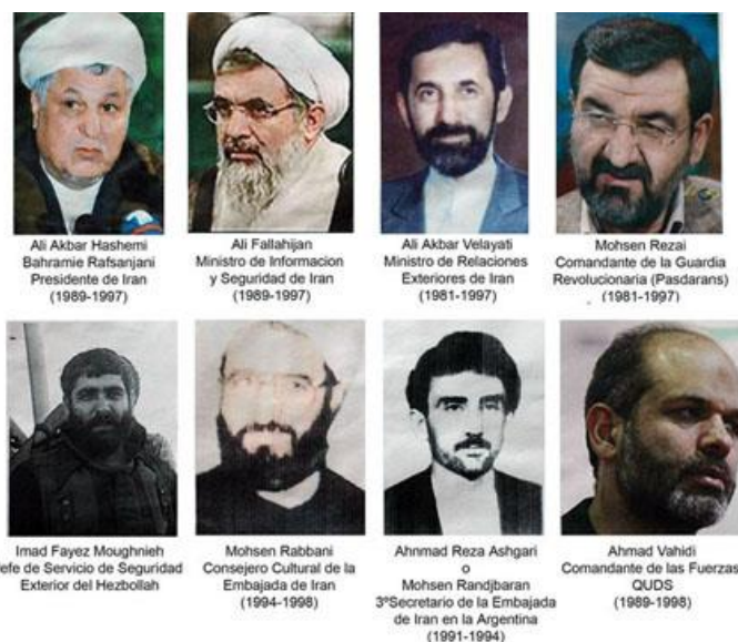
International arrest warrants issued by Argentinean court for Iranian and Hezbollah officials