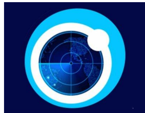
PressTV Logo

The IRIB inaugurated its 24/7 English-language satellite channel, PressTV in July 2007. Headquartered in Tehran, the network employed correspondents in Washington, New York, Moscow, Rome, Cairo, London, Brussels and Beijing and operated bureaus in Beirut, Gaza and the West Bank immediately upon its inception. PressTV debuted during a period of Iranian concern over military encirclement by the U.S. presence in Iraq and Afghanistan and intensifying international pressure over Iran's illicit nuclear program. Iran thus viewed PressTV as a means for Iran to reach Western audiences and defend the regime's nuclear pursuits, foreign policy, support for "resistance" movements, and human rights record.