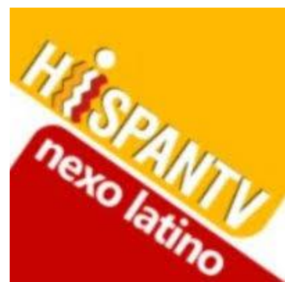
HispanTV Logo

HispanTV is the IRIB's Tehran-based Spanish language network, which airs throughout Latin America and Spain. The network serves as an arm of Iran's public diplomacy outreach to Latin America, a region in which Iran has invested significant political capital. According to Iranian officials, the goal of HispanTV is to " broaden the Iranian regime's "ideological legitimacy" among friendly governments in the region – and to diminish the influence of "dominance seekers," a thinly-veiled reference to the United States. "