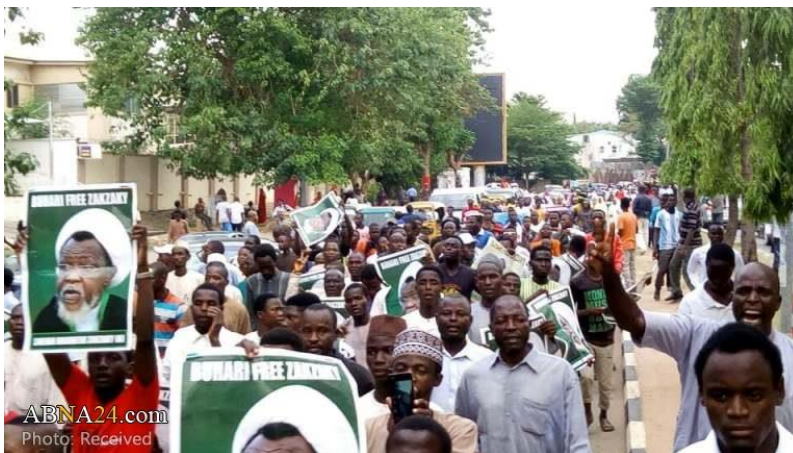
IMN members stage "Free Zakzaky" protest in Abuja, Nigeria in May 2018

In December 2015, the IMN was holding a procession when the Nigerian military alleges that attendees attacked a motorcade transporting the army's chief of staff . The incident touched off several days of clashes which led to the deaths of several hundred IMN members. The Nigerian authorities took Sheikh Zakzaky and his wife into custody, and they remain detained to this day. Iran's Supreme Leader, President, and foreign minister, as well as Hezbollah Secretary General Hassan Nasrallah , have all called for