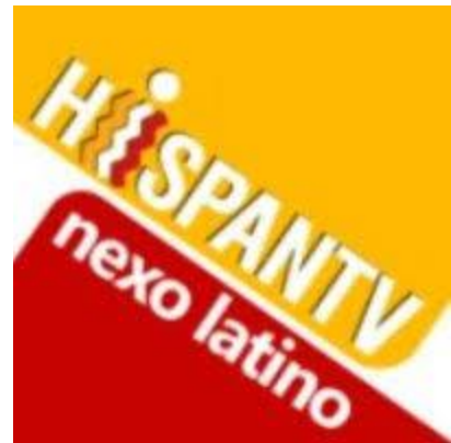
HispanTV Logo

HispanTV is the IRIB's Tehran-based Spanish language network, which airs throughout Latin America and Spain. The network serves as an arm of Iran's public diplomacy outreach to Latin America, a region in which Iran has invested significant political capital. According to Iranian officials, the goal of HispanTV is to “broaden the Iranian regime's “ideological legitimacy” among friendly governments in the region – and to diminish the influence of “dominance seekers,” a thinly-veiled reference to the United States.”