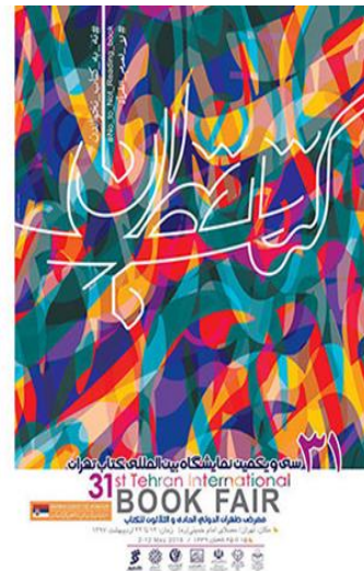
31 st Tehran International Book Fair Logo

Overview: The annual Tehran International Book Fair , which celebrated its 31 st iteration in May 2018, is one of the key cultural diplomacy initiatives of Iran's Ministry of Culture and Islamic Guidance geared toward spreading Iran's ideology. Iran's regime established the Ministry of Culture and Islamic Guidance in 1986, during the presidency of current Supreme Leader Ali Khamenei, as a means of spreading Khomeinist principles at home and abroad. Domestically, the ministry is tasked with restricting access to press and media deemed not in adherence with Iran's revolutionary ideology and religious sensibilities, and with promoting cultural endeavors which further religiosity in society and the regime's worldview. The ministry is also a key agent of “exporting” Iran's Islamic Revolution. Among its roles are, “informing the world community about the basis and aspirations of the Islamic Revolution; expansion of cultural ties with various nations and Muslims and with ‘the oppressed people in particular’; running the affairs of the Haj, operation of facilities for domestic and international tourism; and ‘preparing the ground for spread of the culture of Islamic Revolution and Persian language in other countries’” .