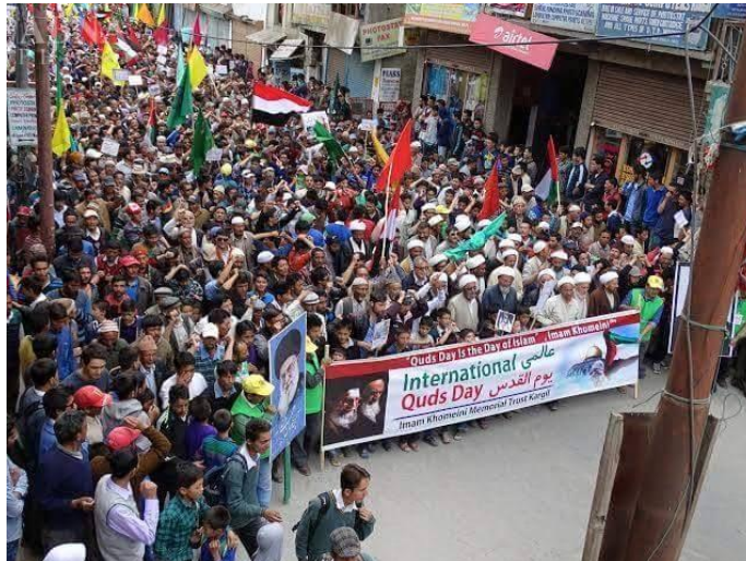
Quds Day rally in Kashmir

Revolutionary Activities Abroad: Iranian-affiliated agents and entities have helped grow Quds Day internationally, organizing events in over 80 countries annually. In addition to shows of support for the Palestinians and denunciations of Israel, displays of support for Iran and Hezbollah – including flags, and posters depicting Ayatollah Khomeini, Supreme Leader Ali Khamenei, and Hezbollah Secretary General Hassan Nasrallah – are a staple at Quds Day events worldwide.