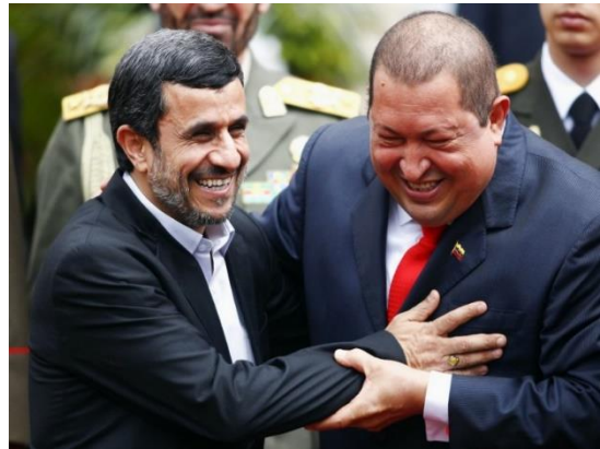
Iran's President Mahmoud Ahmadinejad is welcomed by Venezuela's President Hugo Chavez at Miraflores Palace in Caracas in 2012.

Third, Iran's ties to the region have accelerated in recent years due to the burgeoning of its alliance with the leftist, populist, anti-imperialist bloc Bolivarian Alliance of the Americas (ALBA) founded by former Venezuelan leader Hugo Chavez and former Cuban leader Fidel Castro. The ALBA project has been characterized by its member nations' desire to supplant U.S. dominance in the region, and in Iran, they found a willing anti-American strategic partner. Iran has joined ALBA's intergovernmental association as an observer state, providing it a forum “to have conversations with countries it otherwise would not have the ability to talk to,” such as Ecuador, Bolivia, and Nicaragua.