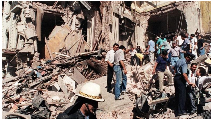
Aftermath of the 1992 Israeli Embassy bombing in Buenos Aires