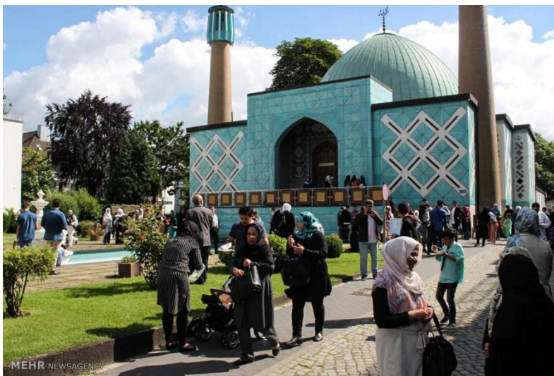
Imam Ali Mosque in Hamburg, Germany

Pro-Iranian activities in Germany center largely around the Islamic Center of Hamburg ( Islamisches Zentrum Hamburg , or IZH), an umbrella institution which plays a financial and organizational role in the operation of Shia associations around Germany. The IZH seeks to promote the Islamic Revolution in Germany via “ brochures, events, prayers, rallies, and other activities .” According to Germany’s intelligence agency, “ Towards the outside world, the IZH acts as a mere religious organization that does not include political activities in its direct field of work. ... In reality however, IZH