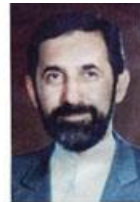
Ali Akbar Velayati Ministro de Relaciones Exteriores de Iran (1981-1997)