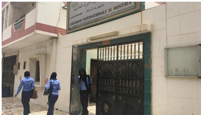
Al-Mustafa University branch in Dakar, Senegal

Al-Mustafa International University has also established a branch in Dakar, indoctrinating 150 Senegalese students each year into Khomeinist ideology. The students receive " free tuition, a stipend, and breakfast " to entice them, and are expected to "promote Iran online or in books" in return for the Iranian largesse. They are also given enough money to enable them and their families to visit Qom during the course of their studies, furthering their indoctrination.