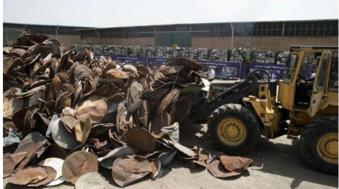
Ceremonial destruction of satellite dishes in Tehran

While IRIB's occasionally heavy-handed methods have given its news programs a reputation for peddling pro-regime propaganda, a 2012 U.S. government funded survey found that 86% of Iranians still count IRIB among their top three sources of news, even though only half of respondents classified IRIB's news content as "very trustworthy." IRIB continues to dominate Iranian news consumption despite the mounted challenge posed by Persian-language news offerings by Western media organs, such as BBC and Voice of America, seeking to provide an alternative point of