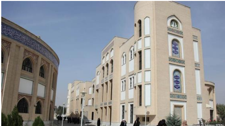
Khatam al-Nabyeen University campus in western Kabul