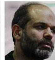
Ahmad Vahidi Comandante de las Fuerzas QUDS (1989-1998)

International arrest warrants issued by Argentinean court for Iranian and Hezbollah officials ( AFP )