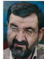
Mohsen Rezai Comandante de la Guardia Revolucionaria (Pasdaran) (1981-1997)