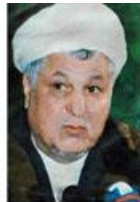
Ali Akbar Hashemi Bakhtiari Rafsanjani Presidente de Iran (1989-1997)