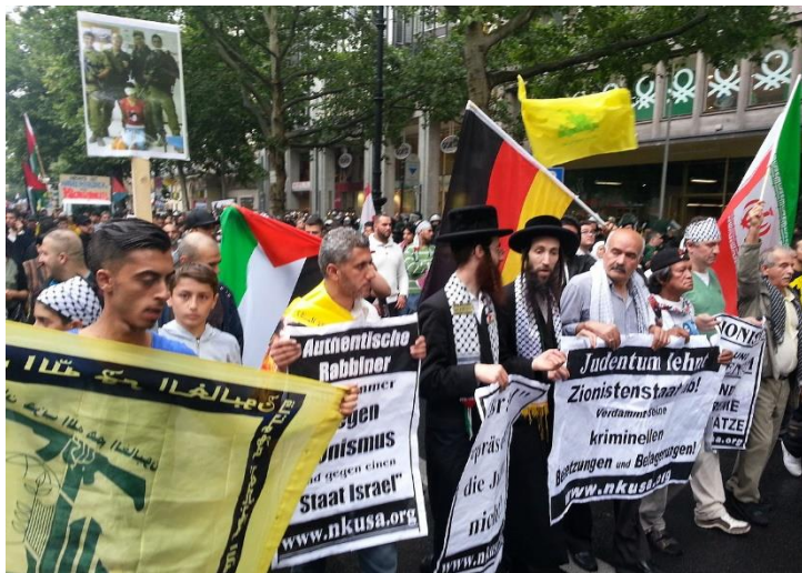
2014 Berlin Quds Day march

Each year, Hezbollah members and supporters gather publicly in Berlin for the annual Al Quds Day march, a global initiative of the Iranian regime initiated by Ayatollah Khomeini dedicated to Israel’s destruction. The IZH is involved in the organization of the march, and funds buses of pro-Hezbollah, pro-Iranian regime activists to the event from the Imam Ali mosque in Hamburg, which the IZH operates. Prominent displays of Hezbollah flags and posters of Shia and “resistance axis” leaders , such as Ayatollahs Khomeini and Khamenei, Hassan Nasrallah, and Bashar al-Assad have been a fixture at the Quds Day rallies, although in 2016, the Berlin State Senate agreed to ban Hezbollah flags at the gathering going forward.