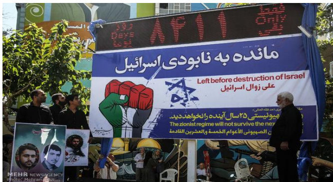
Countdown until Israel's destruction

Iranian politicians abidingly attend Quds Day rallies and deliver anti-Israel diatribes to showcase their steadfast commitment to the regime's opposition to Israel. Tehran's June 2017 Quds Day festivities featured myriad examples of incitement . The IRGC showcased several ballistic missiles capable of striking Israeli territory, and the regime debuted a huge digital countdown display ticking down 8411 days until the demise of Israel, a reference to a 2015 statement by Supreme Leader Khamenei predicting that Israel would cease to exist within 25 years. Addressing the gathering, President Hassan Rouhani declared that Israel supports terrorists in the region, and Parliament speaker Ali Larijani called Israel "the mother of terrorism." The regime issued a communiqué to wrap up Quds Day vowing support for the path of "resistance and intifada" against Israel, and criticizing Israel's "attempts to Judaize the occupied territories and destroy Palestine's national and historical identity."