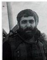
Imad Fayed Mughniyeh Jefe de Servicio de Seguridad Exterior del Hezbollah