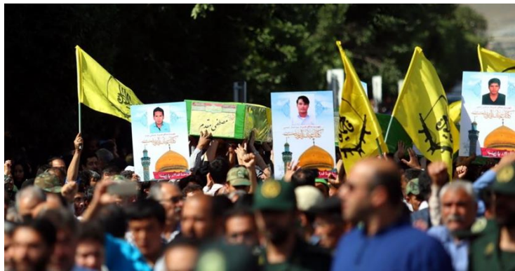
Funeral for Afghan Fatemiyoun Brigade fighters killed in Syria. Posters feature Sayyeda Zainab shrine.

Iran has also sought to frame the fighting in Syria as an urgent necessity to defend Shia shrines . The golden-domed Sayyeda Zainab shrine, strategically located in south Damascus, is especially central to this narrative of Iran and its proxy fighters. Attendees at funerals for Lebanese Hezbollah and other Shia militia fighters killed in Syria frequently chant " labayk ya Zainab (At your service, O Zainab) ", and these same groups have also produced propagandistic songs featuring