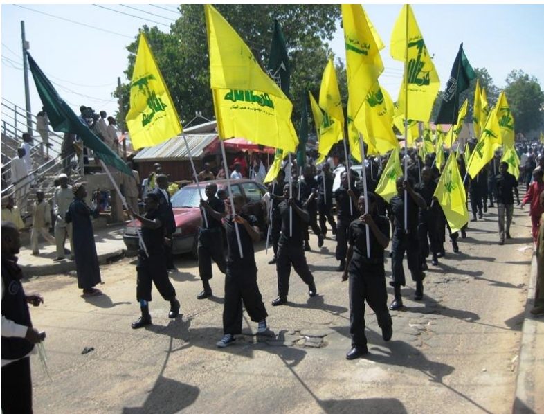
IMN members march with Hezbollah flags during 2015 Quds Day rally