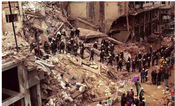
Aftermath of the 1994 AMIA bombing

Less than two years after the attack on the Israeli Embassy, as investigators were still in the process of piecing together what had happened, Iran carried out another bombing targeting Buenos Aires’ Jewish community. On the morning of July 18, 1994, a Hezbollah operative detonated a suicide car bomb laden with 300-400 kilograms of explosives in front of the Asociación Mutual Israelita Argentina (AMIA) Jewish community center , killing 85 and wounding over 200.