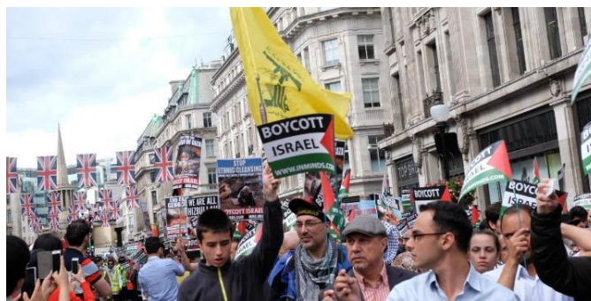
Hezbollah flag at Quds Day rally in London, U.K.

In London, the primary organizer of the annual Quds Day march is the Islamic Human Rights Commission (IHRC), a British Khomeinist organization that is strongly supportive of Hezbollah. IHRC cooperates with several other Iranian-linked organizations (Ahlulbayt Islamic Mission, InMinds) to stage the event, and these groups have joined forces with organizations linked to the Boycott, Divestment and Sanctions movement (BDS), groups with Islamist leanings, far-left/socialist movements, and fringe anti-Zionist Jewish groups to stage Quds Day rallies. In 2017 the IHRC issued an encouraging advisory ahead of the rally informing attendees that “you can bring a Hizbullah flag to show support for the political wing of Hizbullah ... because the political wing of Hizbullah is not a proscribed organisation.” Notably, Hezbollah has only one flag for its military and political wings – which prominently features an assault rifle – casting suspicion on IHRC’s disclaimer that its promotion of Hezbollah flags at Quds Day events in no way demonstrates support for Hezbollah’s proscribed military wing.