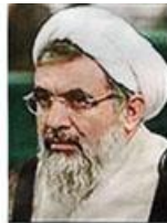
Ali Fallahian Ministro de Informacion y Seguridad de Iran (1989-1997)