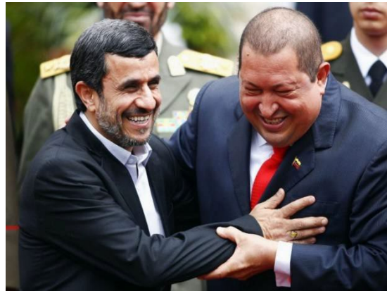
Iran's President Mahmoud Ahmadinejad is welcomed by Venezuela's President Hugo Chavez at Miraflores Palace in Caracas in 2012.

Third, Iran's ties to the region have accelerated in recent years due to the burgeoning of its alliance with the leftist, populist, anti-imperialist bloc Bolivarian Alliance of the Americas (ALBA) founded by former Venezuelan leader Hugo Chavez and former Cuban leader Fidel Castro. The ALBA project has been characterized by its member nations' desire to supplant U.S. dominance in the region, and in Iran, they found a willing anti-American strategic partner. Iran has joined ALBA's intergovernmental association as an observer state, providing it a forum “to have conversations with countries it otherwise would not have the ability to talk to, such as Ecuador, Bolivia, and Nicaragua.