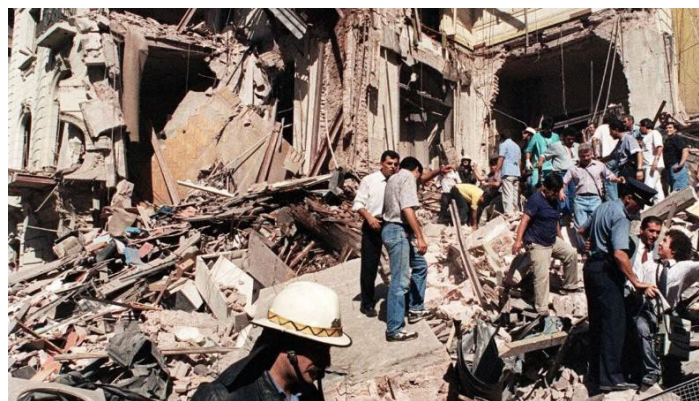
Aftermath of the 1992 Israeli Embassy bombing in Buenos Aires