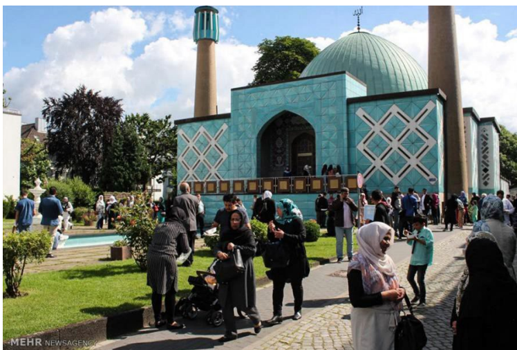
Imam Ali Mosque in Hamburg, Germany

Hezbollah maintains a robust presence in Germany. According to an October 2017 report of the Federal Office of the Protection of the Constitution, Germany's domestic intelligence agency, there are 950 active Hezbollah members in Germany , classified as belonging to the organization's "political wing," a number which has remained steady for over a decade. The Hezbollah supporters regularly meet at Iran-backed mosques and Islamic community centers around the country. There are believed to be around 30 such institutions in this pro-Iranian network, including the Imam Mahdi Centre in Münster-Hiltrup , the Imam Reza mosque in Berlin , and the Imam Ali Mosque in Hamburg . The ongoing Middle Eastern refugee crisis further compounds the security risk posed to Germany by Hezbollah. The 2017 intelligence report states that, " Since mid-2015 there are increased indications of fighters from Shi'ite militias entering Germany as legal refugees. "