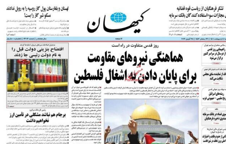
Kayhan, April 28, 2022

In the lead up to Quds Day in 2022, Gaza militants again fired rockets into Israeli territory, however this time no group claimed responsibility for the attacks. It was reported that Ali Akbar Velayati, foreign policy advisor of Iran’s supreme leader, spoke via phone with Hamas political bureau chief Ismail Haniyeh and Secretary General of the Palestinian Islamic Jihad Movement Ziyad al-Nakhalah. Separately, Iran’s foreign minister, Hossein Amir Abdollahian, engaged in phone calls with the leadership of Hamas and Palestinian Islamic Jihad. Furthermore, the Commander-in-Chief of Iran’s IRGC, Hossein Salami, addressed Gaza via live video link from Tehran, an act which Axis of Resistance media hailed as the first time the IRGC commander-in-chief had done so. For Quds Day in 2022, Kayhan also featured a guest editorial where the author openly praised Nazi Fuhrer Adolf Hitler, arguing he was “smarter and more courageous” than current European leaders for expelling Jews.