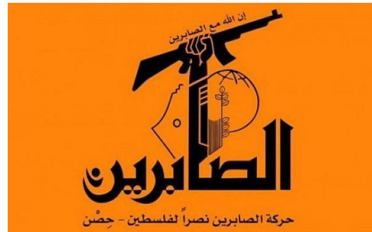
Al-Sabirin movement's flag

Iran has been the leading sponsor of Gaza-based Palestinian Islamic Jihad (PIJ), which was founded in 1979, inspired by the success of the Islamic Revolution. Iranian funding of PIJ has been in place since 1987 . During the early 1990s, much of PIJ organizational and operations-based support came from the Iranian sub-group Hezbollah . The PIJ is extremely open about Iran being its main supporter: “ All of the weapons in Gaza are provided by Iran... the largest share of this financial and military support is coming from Iran. ” It should be noted that while Iran is PIJ’s main supporter, PIJ is neither an arm of Iran’s Islamic Revolution nor a vehicle for spreading Iran-style Shiism in the Palestinian territories, although it has faced such accusations as a means of discrediting the organization among the Palestinian populace. Still, PIJ’s leadership has expressed admiration for Iran’s Islamic Revolution for reviving the overall cause of radical Islamism and jihadism , and the group has adopted a conciliatory posture toward Shiites, viewing them as members of the community of Muslim believers, unlike other Sunni jihadist organizations which consider Shiism to be heretical.