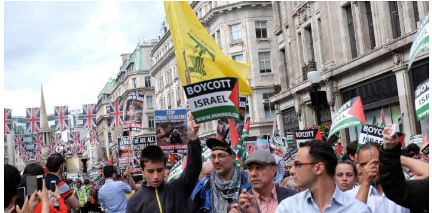
Hezbollah flag at Quds Day rally in London, U.K.

In London, the primary organizer of the annual Quds Day march is the Islamic Human Rights Commission (IHRC), a British Khomeinist organization that is strongly supportive of Hezbollah. IHRC cooperates with several other Iranian-linked organizations (Ahlulbait Islamic Mission, InMinds) to stage the event, and these groups have joined forces with organizations linked to the Boycott, Divestment and Sanctions movement (BDS), groups with Islamist leanings, far-left/socialist movements, and fringe anti-Zionist Jewish groups to stage Quds Day rallies. In 2017 the IHRC issued an encouraging advisory ahead of the rally informing attendees that “you can bring a Hezbollah flag to show support for the political wing of Hezbollah ... because the political wing of Hezbollah is not a proscribed organisation.” Notably, Hezbollah has only one flag for its military and political wings – which prominently features an assault rifle – casting suspicion on IHRC’s disclaimer that its promotion of Hezbollah flags at Quds Day events in no way demonstrates support for Hezbollah’s proscribed military wing.