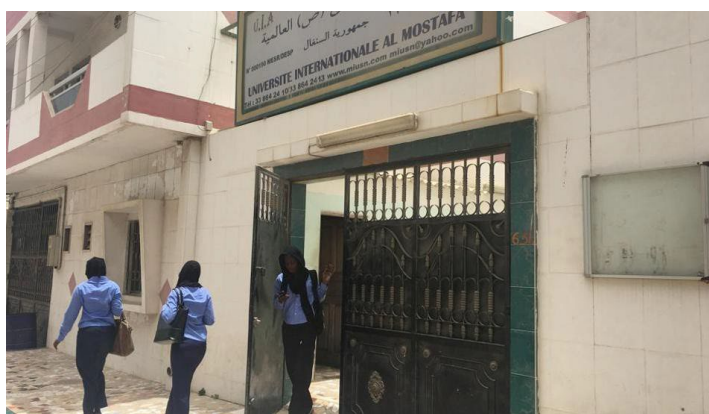
Al-Mustafa University branch in Dakar, Senegal

Al-Mustafa International University has also established a branch in Dakar, indoctrinating 150 Senegalese students each year into Khomeinist ideology. The students receive “ free tuition, a stipend, and breakfast ” to entice them, and are expected to “promote Iran online or in books” in return for the Iranian largesse. They are also given enough money to enable them and their families to visit Qom during the course of their studies, furthering their indoctrination.