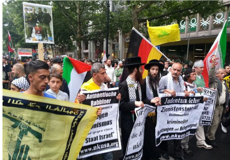
2014 Berlin Quds Day march

Each year, Hezbollah members and supporters gather publicly in Berlin for the annual Al Quds Day march, a global initiative of the Iranian regime initiated by Ayatollah Khomeini dedicated to Israel's destruction. The IZH is involved in the organization of the march, and funds buses of pro-Hezbollah, pro-Iranian regime activists to the event from the Imam Ali mosque in Hamburg, which the IZH operates. Prominent displays of Hezbollah flags and posters of Shia and "resistance axis" leaders , such as Ayatollahs Khomeini and Khamenei, Hassan Nasrallah, and Bashar al-Assad have been a fixture at the Quds Day rallies, although in 2016, the Berlin State Senate agreed to ban Hezbollah flags at the gathering going forward.