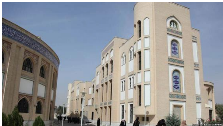
Khatam al-Nabiyeen University campus in western Kabul

The Iranian diversity and inclusion rhetoric obscures Iran's true intentions in Afghanistan. Under the banner of supporting the Hazara's fight for self-defense , Iran could grow armed militias whose devotion lies with the Supreme Leader of Iran, especially after the Taliban took over Afghanistan following the U.S. withdrawal. As in other areas where Iranian-backed militias operate, these would have the potential to exert influence over the government and advance Iranian foreign policy interests.