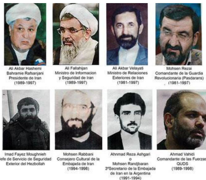
International arrest warrants issued by Argentinean court for Iranian and Hezbollah officials