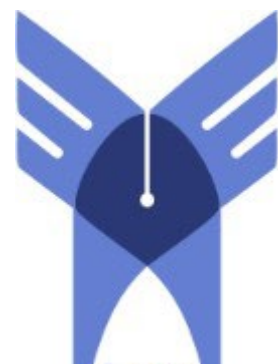
Islamic Azad University Logo

Overview: Islamic Azad University (IAU) was established in 1982 as a nominally private technical and engineering university by a decree of Ayatollah Khomeini . Ali Akbar Hashemi Rafsanjani, a member of Ayatollah Khomeini’s inner circle and two-term former president, played the leading role in conceptualizing and establishing Islamic Azad University , and went on to serve as head of the university’s founder’s committee, akin to chairman of the board, for over three decades until his death in January 2017. Rafsanjani was known as a pragmatic backer of limited social and economic liberalization, rather than ideological rigidity, as the best possible guarantor of sustaining Iran’s Islamic Revolution.