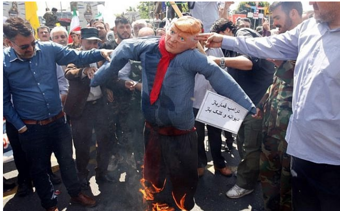
Demonstrators burning effigy of President Trump

Iranian politicians abidingly attend Quds Day rallies and deliver anti-Israel diatribes to showcase their steadfast commitment to the regime's opposition to Israel. Tehran's May 2019 Quds Day festivities were centered around Iran's rejection of the Trump administration's forthcoming Israeli-Palestinian peace plan, branded as "the deal of the century." The procession featured numerous examples of incitement , including demonstrators burning American and Israeli flags and effigies of President Trump and Prime Minister Benjamin Netanyahu. In remarks to reporters, President Rouhani declared , "Palestinians will definitely emerge victorious in confrontation with the Zionist aggressors. ... The issue of Deal of the Century will undoubtedly turn into the bankruptcy of the century and will certainly not yield results."