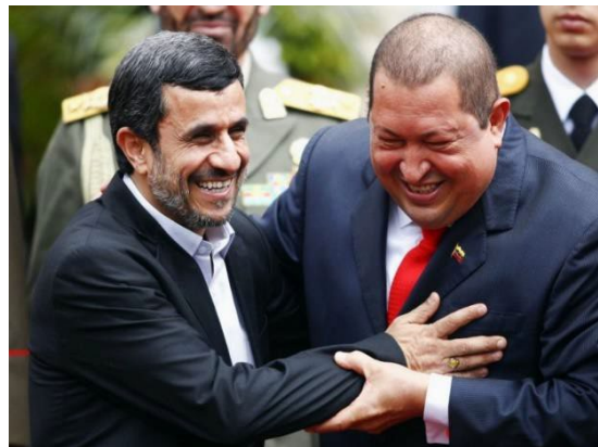
Iran's President Mahmoud Ahmadinejad is welcomed by Venezuela's President Hugo Chavez at Miraflores Palace in Caracas in 2012.

Third, Iran's ties to the region have accelerated in recent years due to the burgeoning of its alliance with the leftist, populist, anti-imperialist bloc Bolivarian Alliance of the Americas (ALBA) founded by former Venezuelan leader Hugo Chavez and former Cuban leader Fidel Castro. The ALBA project has been characterized by its member nations' desire to supplant U.S. dominance in the region, and in Iran, they found a willing anti-American strategic partner. Iran has joined ALBA's intergovernmental association as an observer state, providing it a forum “to have conversations with countries it otherwise would not have the ability to talk to,” such as Ecuador, Bolivia, and Nicaragua.