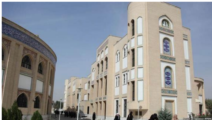
Khatam al-Nabiyen University campus in western Kabul

The Iranian diversity and inclusion rhetoric obscures Iran's true intentions in Afghanistan. Under the banner of supporting the Hazara's fight for self-defense , Iran could grow armed militias whose devotion lies with the Supreme Leader of Iran, especially after the Taliban took over Afghanistan following the U.S. withdrawal. As in other areas where Iranian-backed militias operate, these would have the potential to exert influence over the government and advance Iranian foreign policy interests.