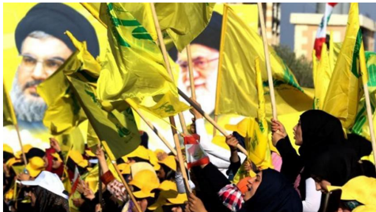
Hezbollah rally in Bint Jbeil, Lebanon

Equally important is Hezbollah's soft power approach, which serves to implant and spread Iran's revolutionary ideology in the areas of southern Lebanon under Hezbollah control. Hezbollah acts as more than just a "resistance" organization, it is a political party as well whose potency lies in the network of social services, hospitals, mosques, charities, and even a satellite TV network, Al-Manar, that the group operates with an annual budget of $15 million. Hezbollah's provision of essential services, such as garbage collection