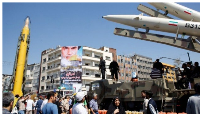
Ballistic missiles on display

Quds Day in 2020 is scheduled for Friday, May 22. Iran, which has been especially hard hit by the coronavirus, weighed canceling this year's demonstrations or moving them online. Ultimately, Iran has decided to mark Quds Day with a vehicle procession , placing the Islamic Revolutionary Guard Corps in charge of planning the parade routes and encouraging demonstrators to chant slogans and wave flags from their cars. The decision to put on a modified Quds Day underscores that even a pandemic will not deter the Iranian regime from holding its annual display of demonization of Israel.