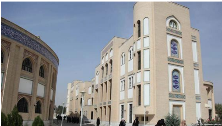
Khatam al-Nabiyen University campus in western Kabul

The Iranian diversity and inclusion rhetoric obscures Iran's true intentions in Afghanistan. Under the banner of supporting the Hazara's fight for self-defense , Iran could grow armed militias whose devotion lies with the Supreme Leader of Iran, especially after the Taliban took over Afghanistan following the U.S. withdrawal. As in other areas where Iranian-backed militias operate, these would have the potential to exert influence over the government and advance Iranian foreign policy interests.