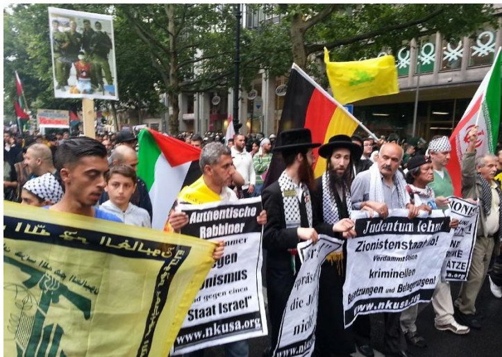
2014 Berlin Quds Day march

Each year, Hezbollah members and supporters gather publicly in Berlin for the annual Al Quds Day march, a global initiative of the Iranian regime initiated by Ayatollah Khomeini dedicated to Israel's destruction. The IZH is involved in the organization of the march, and funds buses of pro-Hezbollah, pro-Iranian regime activists to the event from the Imam Ali mosque in Hamburg, which the IZH operates. Prominent displays of Hezbollah flags and posters of Shi'a and "resistance axis" leaders , such as Ayatollahs Khomeini and Khamenei , Hassan Nasrallah , and Bashar al-Assad have been a fixture at the Quds Day rallies, although in 2016, the Berlin State Senate agreed to ban Hezbollah flags at the gathering going forward.