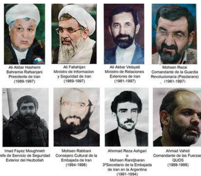
International arrest warrants issued by Argentinean court for Iranian and Hezbollah officials