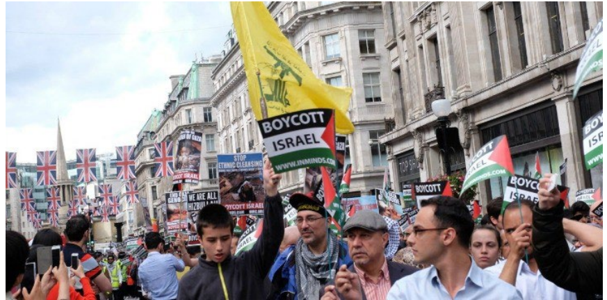
Hezbollah flag at Quds Day rally in London, U.K.

In London, the primary organizer of the annual Quds Day march is the Islamic Human Rights Commission (IHRC), a British Khomeinist organization that is strongly supportive of Hezbollah. IHRC cooperates with several other Iranian-linked organizations (Ahlulbait Islamic Mission, InMinds) to stage the event, and these groups have joined forces with organizations linked to the Boycott, Divestment and Sanctions movement (BDS), groups with Islamist leanings, far-left/socialist movements, and fringe anti-Zionist Jewish groups to stage Quds Day rallies. In 2017, the IHRC issued an encouraging advisory ahead of the rally informing attendees that “you can bring a Hezbollah flag to show support for the political wing of Hezbollah ... because the political wing of Hezbollah is not a proscribed organization.” Notably, Hezbollah has only one flag for its military and political wings—which prominently features an assault rifle—casting suspicion on IHRC’s disclaimer that its promotion of Hezbollah flags at Quds Day events in no way demonstrates support for Hezbollah’s proscribed military wing.