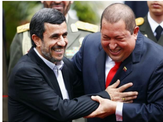
Iran's President Mahmoud Ahmadinejad is welcomed by Venezuela's President Hugo Chavez at Miraflores Palace in Caracas in 2012.

Third, Iran's ties to the region have accelerated in recent years due to the burgeoning of its alliance with the leftist, populist, anti-imperialist bloc Bolivarian Alliance of the Americas (ALBA) founded by former Venezuelan leader Hugo Chavez and former Cuban leader Fidel Castro. The ALBA project has been characterized by its member nations' desire to supplant U.S. dominance in the region, and in Iran, they found a willing anti-American strategic partner. Iran has joined ALBA's intergovernmental association as an observer state, providing it a forum “to have conversations with countries it otherwise would not have the ability to talk to, such as Ecuador, Bolivia, and Nicaragua.