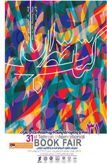
31st Tehran International Book Fair Logo

Overview: The annual Tehran International Book Fair , which celebrated its 31 st iteration in May 2018, is one of the key cultural diplomacy initiatives of Iran’s Ministry of Culture and Islamic Guidance geared toward spreading Iran’s ideology. Iran’s regime established the Ministry of Culture and Islamic Guidance in 1986, during the presidency of current Supreme Leader Ali Khamenei , as a means of spreading Khomeinist principles at home and abroad. Domestically, the ministry is tasked with restricting access to press and media deemed not in adherence with Iran’s revolutionary ideology and religious sensibilities, and with promoting cultural endeavors which further religiosity in society and the regime’s worldview. The ministry is also a key agent of “exporting” Iran’s Islamic Revolution. Among its roles are, “ informing the world community about the basis and aspirations of the Islamic Revolution; expansion of cultural ties with various nations and Muslims and with ‘the oppressed people in particular’; running the affairs of the Haj, operation of facilities for domestic and international tourism; and ‘preparing the ground for spread of the culture of Islamic Revolution and Persian language in other countries’ ”.