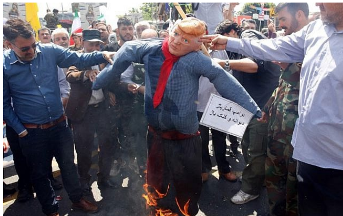
Demonstrators burning effigy of President Trump

Iranian politicians abidingly attend Quds Day rallies and deliver anti-Israel diatribes to showcase their steadfast commitment to the regime's opposition to Israel. Tehran's May 2019 Quds Day festivities were centered around Iran's rejection of the Trump administration's forthcoming Israeli-Palestinian peace plan, branded as "the deal of the century." The procession featured numerous examples of incitement , including demonstrators burning American and Israeli flags and effigies of President Trump and Prime Minister Benjamin Netanyahu. In remarks to reporters, then-President Hassan Rouhani declared , "Palestinians will definitely emerge victorious in confrontation with the Zionist aggressors. ... The issue of Deal of the Century will undoubtedly turn into the bankruptcy of the century and will certainly not yield results."