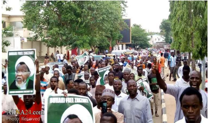
IMN members stage "Free Zakzaky" protest in Abuja, Nigeria in May 2018

In December 2015, the IMN was holding a procession when the Nigerian military alleges that attendees attacked a motorcade transporting the army's chief of staff . The incident touched off several days of clashes which led to the deaths of several hundred IMN members. The Nigerian authorities took Sheikh Zakzaky and his wife into custody, and they remain detained to this day. Iran's Supreme Leader, President, and foreign minister, as well as Hezbollah Secretary General Hassan Nasrallah , have all called for Zakzaky's release. His ongoing detention at the hands of Nigerian authorities heightens the prospect that the IMN will step up its militancy in the months and years to come.