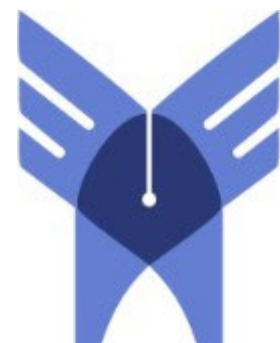
Islamic Azad University Logo

Overview: Islamic Azad University (IAU) was established in 1982 as a nominally private technical and engineering university by a decree of Ayatollah Khomeini . Ali Akbar Hashemi Rafsanjani, a member of Ayatollah Khomeini’s inner circle and two-term former president, played the leading role in conceptualizing and establishing Islamic Azad University , and went on to serve as head of the university’s founder’s committee, akin to chairman of the board, for over three decades until his death in January 2017. Rafsanjani was known as a pragmatic backer of limited social and economic liberalization, rather than ideological rigidity, as the best possible guarantor of sustaining