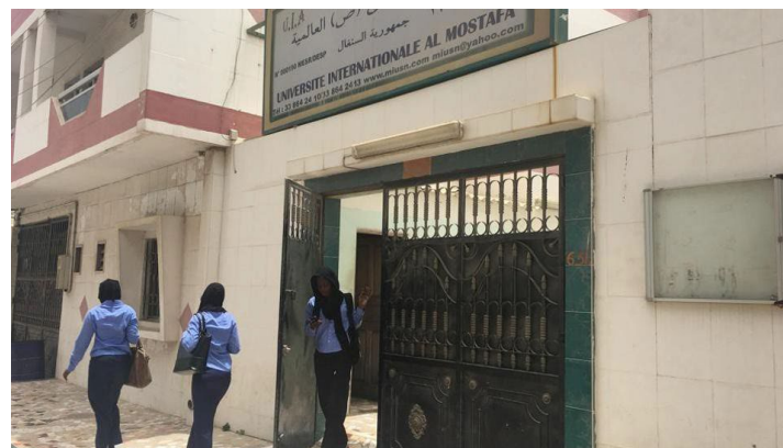
Al-Mustafa University branch in Dakar, Senegal

Al-Mustafa International University has also established a branch in Dakar, indoctrinating 150 Senegalese students each year into Khomeinist ideology. The students receive “free tuition, a stipend, and breakfast” to entice them, and are expected to “promote Iran online or in books” in return for the Iranian largesse. They are also given enough money to enable them and their families to visit Qom during the course of their studies, furthering their indoctrination.