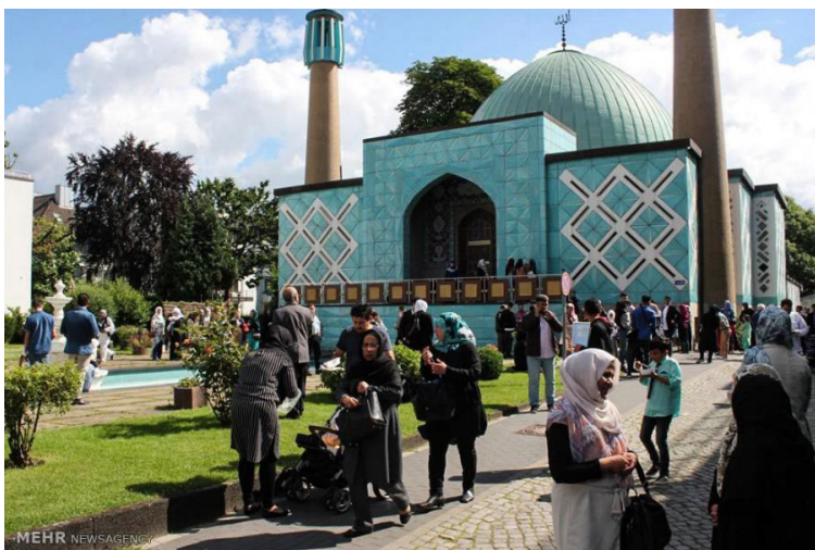
Imam Ali Mosque in Hamburg, Germany

Hezbollah maintains a robust presence in Germany. According to an October 2017 report of the Federal Office of the Protection of the Constitution, Germany's domestic intelligence agency, there are 950 active Hezbollah members in Germany , classified as belonging to the organization's "political wing," a number which has remained steady for over a decade. The Hezbollah supporters regularly meet at Iran-backed mosques and Islamic community centers around the country. There are believed to be around 30 such institutions in this pro-Iranian network, including the Imam Mahdi Centre in Münster-Hiltrup , the Imam Reza mosque in Berlin , and the Imam Ali Mosque in Hamburg . The ongoing Middle Eastern refugee crisis further compounds the security risk posed to Germany by Hezbollah. The 2017 intelligence report states that, " Since mid-2015 there are increased indications of fighters from Shi'ite militias entering Germany as legal refugees. "