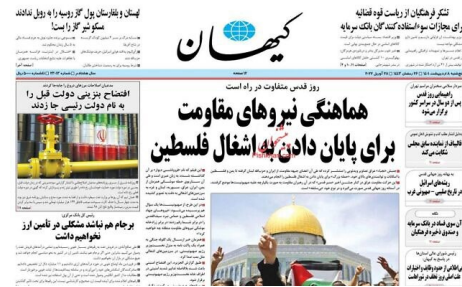
Kayhan, April 28, 2022

In the lead up to Quds Day in 2022, Gaza militants again fired rockets into Israeli territory, however this time no group claimed responsibility for the attacks. It was reported that Ali Akbar Velayati, foreign policy advisor of Iran’s Supreme Leader, spoke via phone with Hamas political bureau chief Ismail Haniyeh and Secretary General of the Palestinian Islamic Jihad Movement Ziyad al-Nakhalah . Separately, Iran’s foreign minister, Hossein Amir Abdollahian , engaged in phone calls with the leadership of Hamas and Palestinian Islamic Jihad. Furthermore, the Commander-in-Chief of Iran’s IRGC, Hossein Salami , addressed Gaza via live video link from Tehran, an act which Axis of Resistance media hailed as the first time the IRGC commander-in-chief had done so. For Quds Day in 2022, Kayhan also featured a guest editorial where the author openly praised Nazi Fuhrer Adolf Hitler, arguing he was “smarter and more courageous” than current European leaders for expelling Jews.