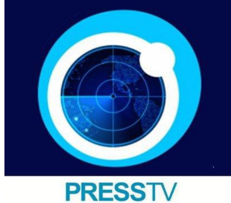
PressTV Logo

The IRIB inaugurated its 24/7 English-language satellite channel, PressTV, in July 2007. Headquartered in Tehran, the network employed correspondents in Washington, New York, Moscow, Rome, Cairo, London, Brussels and Beijing and operated bureaus in Beirut, Gaza and the West Bank immediately upon its inception. PressTV debuted during a period of Iranian concern over military encirclement by the U.S. presence in Iraq and Afghanistan and intensifying international pressure over Iran's illicit nuclear program. Iran thus viewed PressTV as a means for Iran to reach Western audiences and defend the regime's nuclear pursuits, foreign policy, support for "resistance" movements, and human rights record.