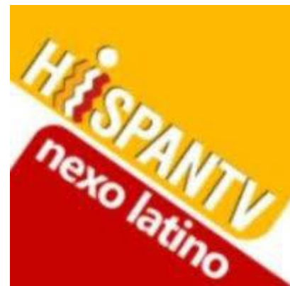
HispanTV Logo

HispanTV is the IRIB's Tehran-based Spanish language network, which airs throughout Latin America and Spain. The network serves as an arm of Iran's public diplomacy outreach to Latin America, a region in which Iran has invested significant political capital. According to Iranian officials, the goal of HispanTV is to “broaden the Iranian regime's “ideological legitimacy” among friendly governments in the region—and to diminish the influence of “dominance seekers,” a thinly-veiled reference to the United States.”