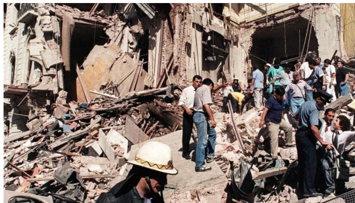
Aftermath of the 1992 Israeli Embassy bombing in Buenos Aires

The Israeli embassy bombing was carried out by a suicide terrorist who detonated a truck carrying 220 pounds of explosives, killing 29 and wounding 292. The Central Intelligence Agency (CIA) conducted an investigation into the attack in conjunction with the Counter Terrorism Center, and concluded that Hezbollah operatives Imad Mughniyeh—one of the organization's senior-most operatives and the chief perpetrator behind the 1983 bombing of the U.S. embassy in Beirut—and Talal Hamiyah were the principal planners, and that Hezbollah carried out the attack at Iran's behest, but took on all operational aspects to shield Tehran from direct involvement.