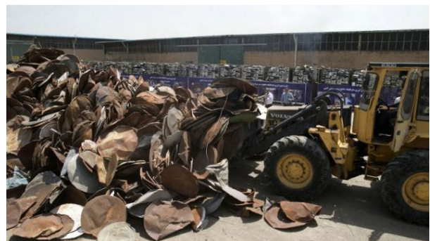
Ceremonial destruction of satellite dishes in Tehran

While IRIB's occasionally heavy-handed methods have given its news programs a reputation for peddling pro-regime propaganda, a 2012 U.S. government funded survey found that 86% of Iranians still count IRIB among their top three sources of news, even though only half of respondents classified IRIB's news content as "very trustworthy." IRIB continues to dominate Iranian news consumption despite the mounted challenge posed by Persian-language news offerings by Western media organs, such as BBC and Voice of America, seeking to provide an alternative point of view to Iranian audiences. Iranian authorities regard these broadcasts with fear and mistrust, viewing them as a threat to their continued cultural hegemony. Iran accordingly invests heavily in censorship efforts, including jamming of international satellite broadcasts. Iranian police also regularly conduct raids to seize illegally possessed satellite dishes, and the IRGC's Basij militia have staged ceremonies in which they destroy massive quantities of the corrupting devices .