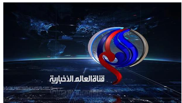
Al-Alam Logo

Al-Alam (The World) is IRIB's 24-hour Arabic language news channel with news bureaus based in Baghdad, Beirut, Damascus and Tehran . The network advocates for and seeks to advance the interests of the Iranian regime to the world's 300 million Arabs, and its satellite programming reaches viewers on five continents. Al-Alam offers a mouthpiece for Iran to influence Arab public opinion and shape perceptions of events on the ground in real time in accordance with the Iranian establishment's perspective.