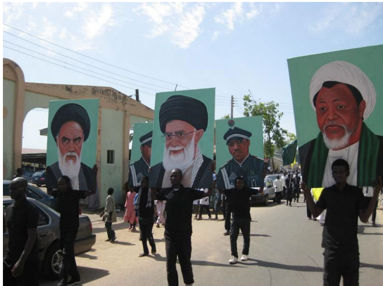
IMN members hold posters of Khomeini, Khamenei, and Zakzaky during 2015 Quds Day rally

The IMN frequently mobilizes tens of thousands of its members for Shia religious events and mass political demonstrations, many of which feature the burning of American and Israeli flags, and veneration of the triumvirate of Ayatollah Khomeini, Supreme Leader Ali Khamenei, and Hezbollah Secretary General Hassan Nasrallah. The mass demonstrations have been the site of violence and clashes on occasion. In July 2014, more than 30 IMN members were killed in clashes with government forces during the IMN's yearly Quds Day procession held to demonstrate IMN's solidarity with the Palestinian cause. Sheikh Zakzaky lost three sons in the incident.