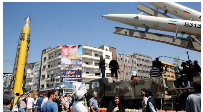
Ballistic missiles on display

Quds Day in 2020 is scheduled for Friday, May 22. Iran, which has been especially hard hit by the coronavirus, weighed canceling this year's demonstrations or moving them online. Ultimately, Iran has decided to mark Quds Day with a vehicle procession , placing the Islamic Revolutionary Guard Corps in charge of planning the parade routes and encouraging demonstrators to chant slogans and wave flags from their cars. The decision to put on a modified Quds Day underscores that even a pandemic will not deter the Iranian regime from holding its annual display of demonization of Israel.