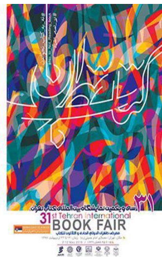
31st Tehran International Book Fair Logo

Overview: The annual Tehran International Book Fair , which celebrated its 31 st iteration in May 2018, is one of the key cultural diplomacy initiatives of Iran’s Ministry of Culture and Islamic Guidance geared toward spreading Iran’s ideology. Iran’s regime established the Ministry of Culture and Islamic Guidance in 1986, during the presidency of current Supreme Leader Ali Khamenei, as a means of spreading Khomeinist principles at home and abroad. Domestically, the ministry is tasked with restricting access to press and media deemed not in adherence with Iran’s revolutionary ideology and religious sensibilities, and with promoting cultural endeavors which further religiosity in society and the regime’s worldview. The ministry is also a key agent of “exporting” Iran’s Islamic Revolution. Among its roles are, “informing the world community about the basis and aspirations of the Islamic Revolution; expansion of cultural ties with various nations and Muslims and with ‘the oppressed people in particular’; running the affairs of the Haj, operation of facilities for domestic and international tourism; and ‘preparing the ground for spread of the culture of Islamic Revolution and Persian language in other countries’” .