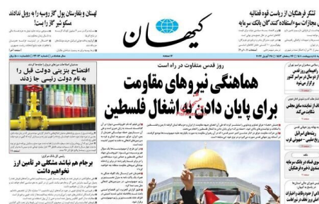
Kayhan, April 28, 2022

In the lead up to Quds Day in 2022, Gaza militants again fired rockets into Israeli territory, however this time no group claimed responsibility for the attacks. It was reported that Ali Akbar Velayati, foreign policy advisor of Iran’s supreme leader, spoke via phone with Hamas political bureau chief Ismail Haniyeh and Secretary General of the Palestinian Islamic Jihad Movement Ziyad al-Nakhalah. Separately, Iran’s foreign minister, Hossein Amir Abdollahian, engaged in phone calls with the leadership of Hamas and Palestinian Islamic Jihad. Furthermore, the Commander-in-Chief of Iran’s IRGC, Hossein Salami, addressed Gaza via live video link from Tehran, an act which Axis of Resistance media hailed as the first time the IRGC commander-in-chief had done so. For Quds Day in 2022, Kayhan also featured a guest editorial where the author openly praised Nazi Fuhrer Adolf Hitler, arguing he was “smarter and more courageous” than current European leaders for expelling Jews.