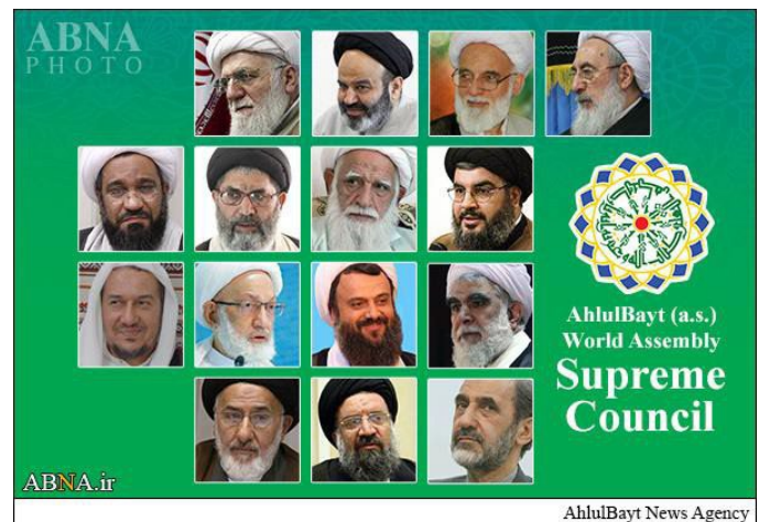
AhlulBayt World Assembly Supreme Council

Overview: The Ahlul Bayt World Assembly (ABWA) is an internationally active Iranian NGO which functions as the umbrella over a network of Iranian-backed religious, cultural, and educational institutions tasked with disseminating Ayatollah Khomeini's revolutionary Islamist ideology around the world. Ahlul Bayt refers to the " People of the House (of the Prophet) ," and in the Iranian context specifically refers to Shi'a Muslims (partisans of, or Shi'at 'Ali). The ABWA is functionally the link between the Iranian Shi'a clerical establishment and foreign Shi'a clerics , and also links Shi'a communities around the world to each other