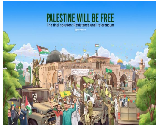
2020 Quds Day Poster

Quds Day fits into Khomeini’s revolutionary paradigm as a show of resistance in support of “oppressed peoples” against “arrogant, oppressive powers,” and Khomeini went so far as to issue a fatwa declaring the elimination of the “Zionist entity” as a religious duty incumbent on Muslims . While ostensibly Quds Day’s primary focus is on the Israeli-Palestinian conflict, Iran sees this localized struggle as part of a broader regional initiative. By hosting Quds Day celebrations around the world, Iran seeks to frame the Palestinian struggle as a pan pan-Islamic cause, and to claim the leadership mantle as the preeminent defender of the Palestinians.