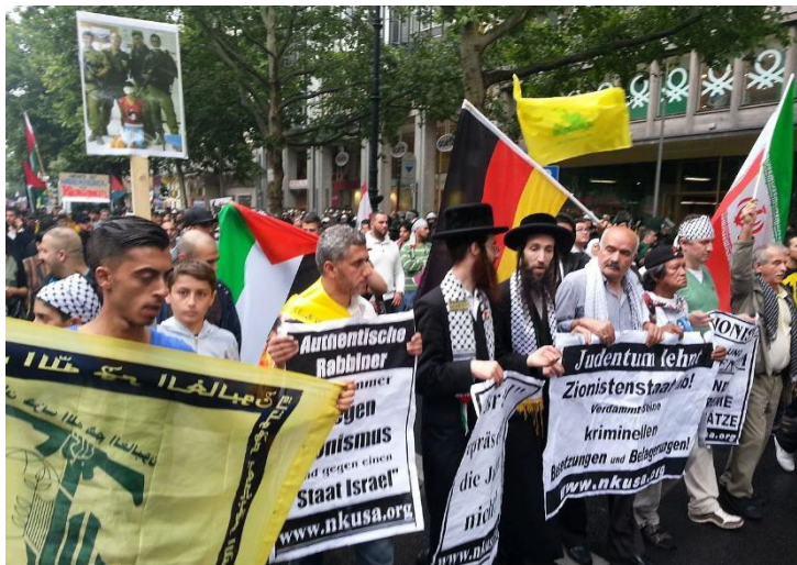
2014 Berlin Quds Day march

Each year, Hezbollah members and supporters gather publicly in Berlin for the annual Al Quds Day march, a global initiative of the Iranian regime initiated by Ayatollah Khomeini dedicated to Israel's destruction. The IZH is involved in the organization of the march, and funds buses of pro-Hezbollah, pro-Iranian regime activists to the event from the Imam Ali mosque in Hamburg, which the IZH operates. Prominent displays of Hezbollah flags and posters of Shia and "resistance axis" leaders , such as Ayatollahs Khomeini and Khamenei, Hassan Nasrallah, and Bashar al-Assad have been a fixture at the Quds Day rallies, although in 2016, the Berlin State Senate agreed to ban Hezbollah flags at the gathering going forward.