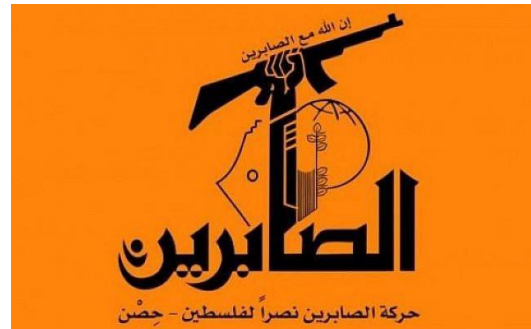
Al-Sabirin movement's flag

Iran has been the leading sponsor of Gaza-based Palestinian Islamic Jihad (PIJ), which was founded in 1979, inspired by the success of the Islamic Revolution. Iranian funding of PIJ has been in place since 1987 . During the early 1990s, much of PIJ organizational and operations-based support came from the Iranian sub-group Hezbollah . The PIJ is extremely open about Iran being its main supporter: “ All of the weapons in Gaza are provided by Iran... the largest share of this financial and military support is coming from Iran. ” It should be noted that while Iran is PIJ’s main supporter, PIJ is neither an arm of Iran’s Islamic Revolution nor a vehicle for spreading Iran-style Shiism in the Palestinian territories, although it has faced such accusations as a means of discrediting the organization among the Palestinian populace. Still, PIJ’s leadership has expressed admiration for Iran’s Islamic Revolution for reviving the overall cause of radical Islamism and jihadism , and the group has adopted a conciliatory posture toward Shiites, viewing them as members of the community of Muslim believers, unlike other Sunni jihadist organizations which consider Shiism to be heretical.