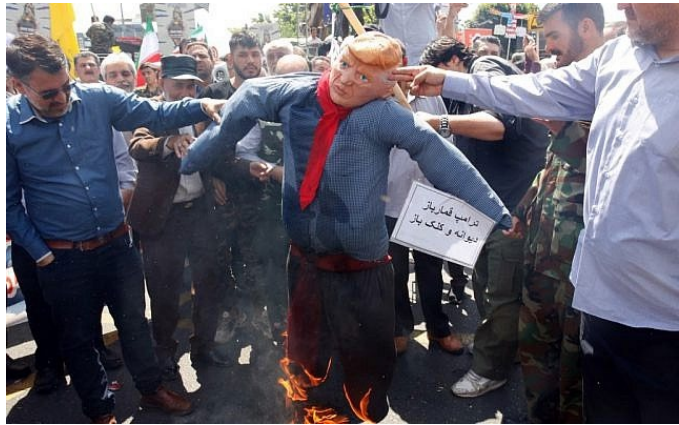
Demonstrators burning effigy of President Trump

Iranian politicians abidingly attend Quds Day rallies and deliver anti-Israel diatribes to showcase their steadfast commitment to the regime's opposition to Israel. Tehran's May 2019 Quds Day festivities were centered around Iran's rejection of the Trump administration's forthcoming Israeli-Palestinian peace plan, branded as "the deal of the century." The procession featured numerous examples of incitement , including demonstrators burning American and Israeli flags and effigies of President Trump and Prime Minister Benjamin Netanyahu. In remarks to reporters, President Rouhani declared , "Palestinians will definitely emerge victorious in confrontation with the Zionist aggressors. ... The issue of Deal of the Century will undoubtedly turn into the bankruptcy of the century and will certainly not yield results."