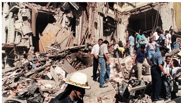
Aftermath of the 1992 Israeli Embassy bombing in Buenos Aires