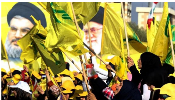
Hezbollah rally in Bint Jbeil, Lebanon

Equally important is Hezbollah's soft power approach, which serves to implant and spread Iran's revolutionary ideology in the areas of southern Lebanon under Hezbollah control. Hezbollah acts as more than just a "resistance" organization, it is a political party as well whose potency lies in the network of social services, hospitals, mosques, charities, and even a satellite TV network, Al-Manar, that the group operates with an annual budget of $15 million. Hezbollah's provision of essential services, such as garbage collection