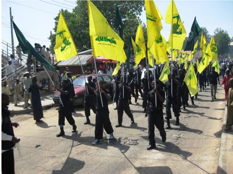
IMN members march with Hezbollah flags during 2015 Quds Day rally