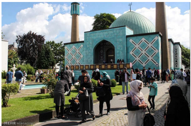
Imam Ali Mosque in Hamburg, Germany

Hezbollah maintains a robust presence in Germany. According to an October 2017 report of the Federal Office of the Protection of the Constitution, Germany's domestic intelligence agency, there are 950 active Hezbollah members in Germany , classified as belonging to the organization's "political wing," a number which has remained steady for over a decade. The Hezbollah supporters regularly meet at Iran-backed mosques and Islamic community centers around the country. There are believed to be around 30 such institutions in this pro-Iranian network, including the Imam Mahdi Centre in Münster-Hiltrup , the Imam Reza mosque in Berlin , and the Imam Ali Mosque in Hamburg . The ongoing Middle Eastern refugee crisis further compounds the security risk posed to Germany by Hezbollah. The 2017 intelligence report states that, " Since mid-2015 there are increased indications of fighters from Shi'ite militias entering Germany as legal refugees. "