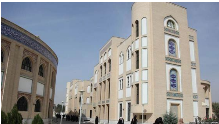
Khatam al-Nabiyen University campus in western Kabul

The Iranian diversity and inclusion rhetoric obscures Iran's true intentions in Afghanistan. Under the banner of supporting the Hazara's fight for self-defense , Iran could grow armed militias whose devotion lies with the Supreme Leader of Iran, especially after the Taliban took over Afghanistan following the U.S. withdrawal. As in other areas where Iranian-backed militias operate, these would have the potential to exert influence over the government and advance Iranian foreign policy interests.