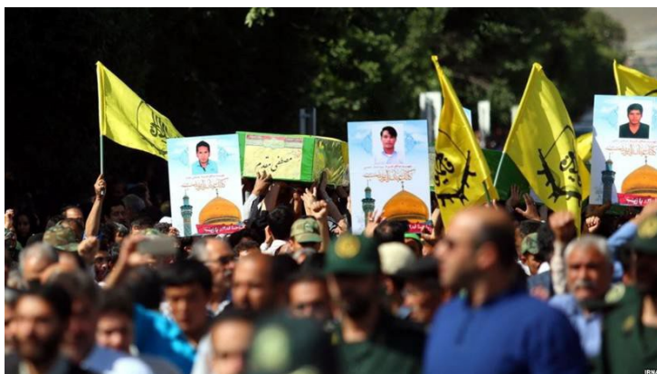
Funeral for Afghan Fatemiyoun Brigade fighters killed in Syria. Posters feature Sayyeda Zainab shrine.

Iran has also sought to frame the fighting in Syria as an urgent necessity to defend Shia shrines . The golden-domed Sayyeda Zainab shrine, strategically located in south Damascus, is especially central to this narrative of Iran and its proxy fighters. Attendees at funerals for Lebanese Hezbollah and other Shia militia fighters killed in Syria frequently chant "labayk ya Zainab (At your service, O Zainab)" , and these same groups have also produced propagandistic songs featuring the slogan and prominently placed the shrine's iconic dome in the background of martyrdom posters of fallen fighters.