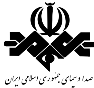
IRIB logo

Domestically, IRIB is an instrument of Iran's efforts to preserve the Islamic revolution through repression. The U.S. Treasury Department sanctioned IRIB in 2013 over its usage of “state-media transmissions to trample dissent.” Treasury further cited “distorted or false IRIB news reports and the broadcasting of forced confessions of political detainees” and IRIB's role in jamming satellite transmissions of Western-produced Persian language news broadcasts, as the impetus behind designating IRIB. While satellite dishes are officially proscribed in the Islamic Republic, a majority of Iran's citizens own the illegal devices , giving them access to dozens of non-state approved Farsi-language news, entertainment, and film channels. The European Union similarly sanctioned IRIB's chief in 2012, and several European satellite providers subsequently removed IRIB offerings from their service, but both the U.S. and EU opted to waive their sanctions against IRIB during the Iran nuclear deal negotiating process, enabling IRIB channels to return to Europe's airwaves.