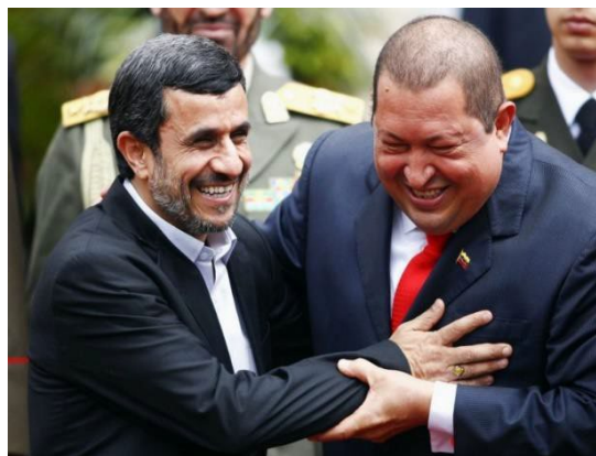
Iran's President Mahmoud Ahmadinejad is welcomed by Venezuela's President Hugo Chavez at Miraflores Palace in Caracas in 2012.

Third, Iran's ties to the region have accelerated in recent years due to the burgeoning of its alliance with the leftist, populist, anti-imperialist bloc Bolivarian Alliance of the Americas (ALBA) founded by former Venezuelan leader Hugo Chavez and former Cuban leader Fidel Castro. The ALBA project has been characterized by its member nations' desire to supplant U.S. dominance in the region, and in Iran, they found a willing anti-American strategic partner. Iran has joined ALBA's intergovernmental association as an observer state, providing it a forum “to have conversations with countries it otherwise would not have the ability to talk to,” such as Ecuador, Bolivia, and Nicaragua.