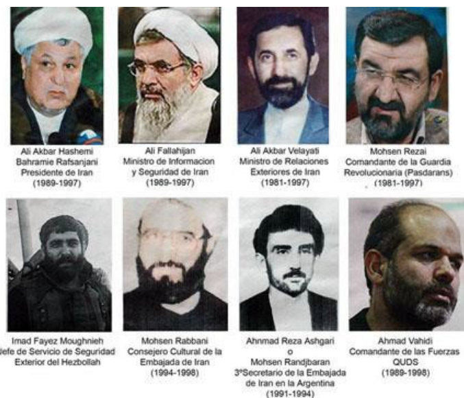
International arrest warrants issued by Argentinean court for Iranian and Hezbollah officials