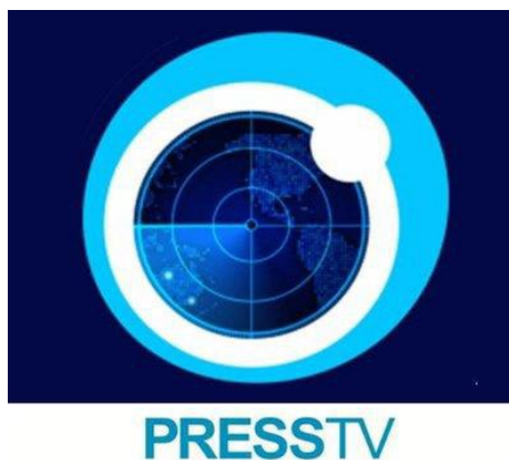
PressTV Logo

The IRIB inaugurated its 24/7 English-language satellite channel, PressTV in July 2007. Headquartered in Tehran, the network employed correspondents in Washington, New York, Moscow, Rome, Cairo, London, Brussels and Beijing and operated bureaus in Beirut, Gaza and the West Bank immediately upon its inception. PressTV debuted during a period of Iranian concern over military encirclement by the U.S. presence in Iraq and Afghanistan and intensifying international pressure over Iran's illicit nuclear program. Iran thus viewed PressTV as a means for Iran to reach Western audiences and defend the regime's nuclear pursuits, foreign policy, support for "resistance" movements, and human rights record.