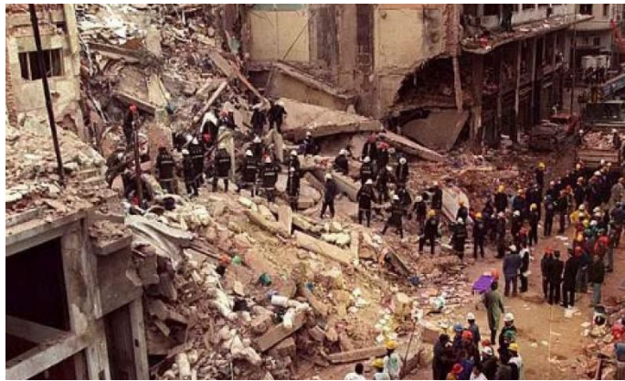
Aftermath of the 1994 AMIA bombing

Less than two years after the attack on the Israeli Embassy, as investigators were still in the process of piecing together what had happened, Iran carried out another bombing targeting Buenos Aires’ Jewish community. On the morning of July 18, 1994, a Hezbollah operative detonated a suicide car bomb laden with 300-400 kilograms of explosives in front of the Asociación Mutual Israelita Argentina (AMIA) Jewish community center , killing 85 and wounding over 200.