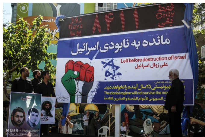
Countdown until Israel's destruction

Overview: Held annually on the last Friday of Ramadan, Quds Day is a day of protest organized by the Iranian government against Israel. Established by Ayatollah Khomeini months after assuming power in 1979, Khomeini envisioned Quds Day as part of a "long-term pragmatic strategy in a bid to launch a justice-based peace in the region and reclaim the rights of the oppressed Palestinian nation," which entails the elimination of "Zionist" control over Israel and the return of Israel to the Palestinians. Iran and its surrogates around the world stage ceremonies which typically feature calls for hostilities against Israel and the elimination of the "Zionist regime. "Death to Israel" is a common chant at the rallies, often accompanied by "Death to America," and flag burning of Iran's chief adversaries are a staple of the events.