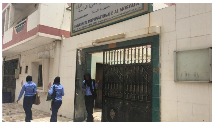
Al-Mustafa University branch in Dakar, Senegal

Al-Mustafa International University has also established a branch in Dakar, indoctrinating 150 Senegalese students each year into Khomeinist ideology. The students receive “free tuition, a stipend, and breakfast” to entice them, and are expected to “promote Iran online or in books” in return for the Iranian largesse. They are also given enough money to enable them and their families to visit Qom during the course of their studies, furthering their indoctrination.