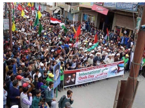
Quds Day rally in Kashmir

Although Hezbollah itself draws no distinction between its military and political wings, the European Union has designated only the military wing of Hezbollah as terrorist organization, allowing the group to overtly organize, demonstrate, and carry out fundraising activities throughout the continent. The Iranian terrorist proxy has therefore played a prominent role at Quds Day rallies in European capitals such as London and Berlin