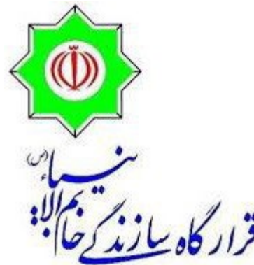
Khatam al-Anbiya Logo

As the Iranian government reduced military expenditures and sought to rebuild after the war, the IRGC's construction and engineering wing, Khatam al-Anbiya ("seal of the Prophets"), moved into civilian enterprises, expanding its influence and economic portfolio as it took on lucrative post-war reconstruction projects. This process accelerated during Ahmadinejad's tenure, as Khatam al-Anbiya was the beneficiary of a succession of huge no-bid contracts , rendering the organization and its complex web of subsidiaries as the dominant players in Iran's construction, energy, automobile manufacturing, and electronics sectors . Fueled by Khatam al-Anbiya's profits, the IRGC has taken on outsized role in the militarization of Iran's economy and the organization effectively operates as a state within a state, accountable only to Supreme Leader Khamenei. Reflecting the IRGC's growing influence in Iran's oil and gas industry, Khatam al-Anbiya has served as a recruiting pool for top talent for the government of the Islamic Republic of Iran. IRGC commander and former Khatam al-Anbiya head Rostam Ghasemi was appointed as Iran's Minister of Petroleum in August 2011.