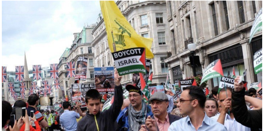
Hezbollah flag at Quds Day rally in London, U.K.

In London, the primary organizer of the annual Quds Day march is the Islamic Human Rights Commission (IHRC), a British Khomeinist organization that is strongly supportive of Hezbollah. IHRC cooperates with several other Iranian-linked organizations (Ahlulbayt Islamic Mission, InMinds) to stage the event, and these groups have joined forces with organizations linked to the Boycott, Divestment and Sanctions movement (BDS), groups with Islamist leanings, far-left/socialist movements, and fringe anti-Zionist Jewish groups to stage Quds Day rallies. In 2017 the IHRC issued an encouraging advisory ahead of the rally informing attendees that “you can bring a Hezbollah flag to show support for the political wing of Hezbollah ... because the political wing of Hezbollah is not a proscribed organisation.” Notably, Hezbollah has only one flag for its military and political wings – which prominently features an assault rifle – casting suspicion on IHRC’s disclaimer that its promotion of Hezbollah flags at Quds Day events in no way demonstrates support for Hezbollah’s proscribed military wing.