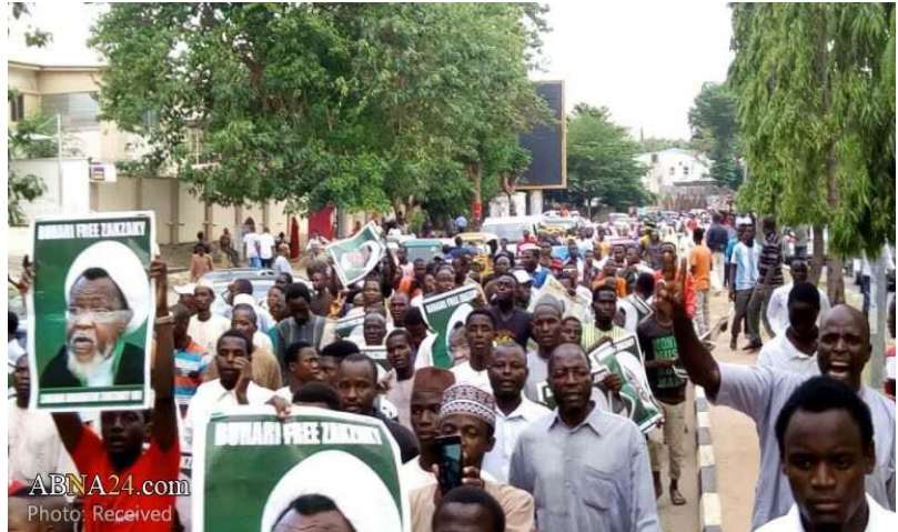
IMN members stage "Free Zakzaky" protest in Abuja, Nigeria in May 2018

The incident touched off several days of clashes which led to the deaths of several hundred IMN members. The Nigerian authorities took Sheikh Zakzaky and his wife into custody, and they remain detained to this day. Iran's Supreme Leader, President, and foreign minister, as well as Hezbollah Secretary General Hassan Nasrallah , have all called for