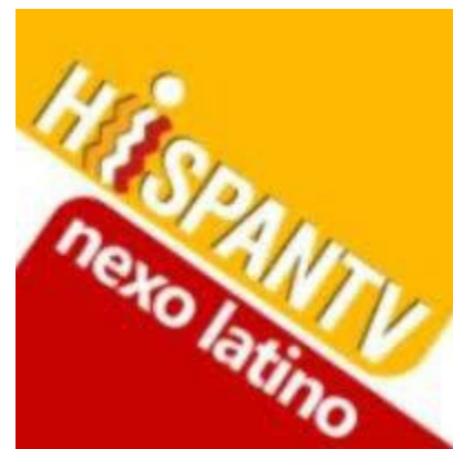
HispanTV Logo

HispanTV is the IRIB's Tehran-based Spanish language network, which airs throughout Latin America and Spain. The network serves as an arm of Iran's public diplomacy outreach to Latin America, a region in which Iran has invested significant political capital. According to Iranian officials, the goal of HispanTV is to “broaden the Iranian regime's “ideological legitimacy” among friendly governments in the region – and to diminish the influence of “dominance seekers,” a thinly-veiled reference to the United States.”