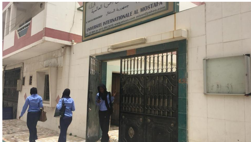
Al-Mustafa University branch in Dakar, Senegal

Al-Mustafa International University has also established a branch in Dakar, indoctrinating 150 Senegalese students each year into Khomeinist ideology. The students receive “ free tuition, a stipend, and breakfast ” to entice them, and are expected to “promote Iran online or in books” in return for the Iranian largesse. They are also given enough money to enable them and their families to visit Qom during the course of their studies, furthering their indoctrination.