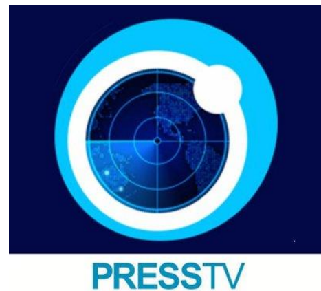
PressTV Logo

The IRIB inaugurated its 24/7 English-language satellite channel, PressTV in July 2007. Headquartered in Tehran, the network employed correspondents in Washington, New York, Moscow, Rome, Cairo, London, Brussels and Beijing and operated bureaus in Beirut, Gaza and the West Bank immediately upon its inception. PressTV debuted during a period of Iranian concern over military encirclement by the U.S. presence in Iraq and Afghanistan and intensifying international pressure over Iran's illicit nuclear program. Iran thus viewed PressTV as a means for Iran to reach Western audiences and defend the regime's nuclear pursuits, foreign policy, support for "resistance" movements, and human rights record.