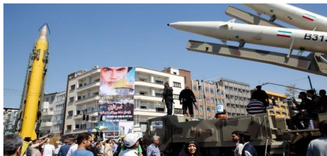
Ballistic missiles on display

Quds Day fits into Khomeini’s revolutionary paradigm as a show of resistance in support of “oppressed peoples” against “arrogant, oppressive powers,” and Khomeini went so far as to issue a fatwa declaring the elimination of the “Zionist entity” as a religious duty incumbent on Muslims . While ostensibly Quds Day’s primary focus is on the Israeli-Palestinian conflict, Iran sees this localized struggle as part of a broader regional initiative. By hosting Quds Day celebrations around the world, Iran seeks to frame the Palestinian struggle as a pan-Islamic cause, and to claim the leadership mantle as the preeminent defender of the Palestinians.