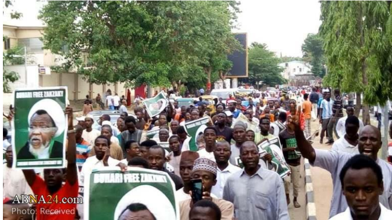
IMN members stage "Free Zakzaky" protest in Abuja, Nigeria in May 2018

In December 2015, the IMN was holding a procession when the Nigerian military alleges that attendees attacked a motorcade transporting the army's chief of staff . The incident touched off several days of clashes which led to the deaths of several hundred IMN members. The Nigerian authorities took Sheikh Zakzaky and his wife into custody, and they remain detained to this day. Iran's Supreme Leader, President, and foreign minister, as well as Hezbollah Secretary General Hassan Nasrallah , have all called for