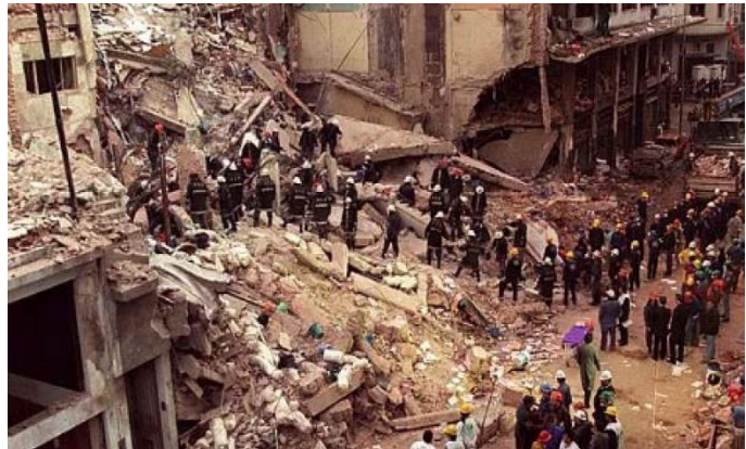
Aftermath of the 1994 AMIA bombing

Less than two years after the attack on the Israeli Embassy, as investigators were still in the process of piecing together what had happened, Iran carried out another bombing targeting Buenos Aires’ Jewish community. On the morning of July 18, 1994, a Hezbollah operative detonated a suicide car bomb laden with 300-400 kilograms of explosives in front of the Asociación Mutual Israelita Argentina (AMIA) Jewish community center , killing 85 and wounding over 200.