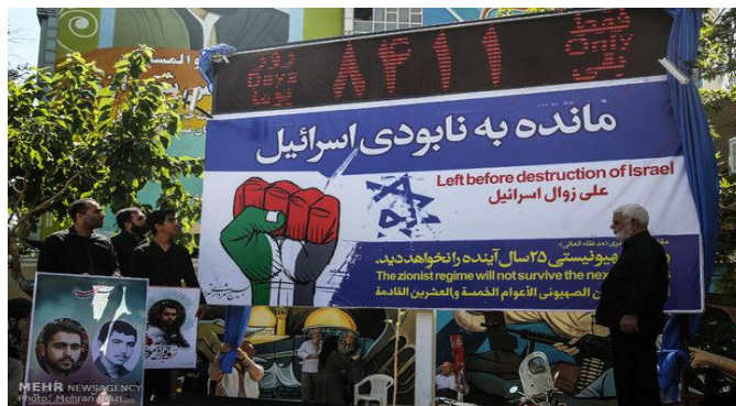
Countdown until Israel’s destruction

Iranian politicians abidingly attend Quds Day rallies and deliver anti-Israel diatribes to showcase their steadfast commitment to the regime’s opposition to Israel. Tehran’s June 2017 Quds Day festivities featured myriad examples of incitement . The IRGC showcased several ballistic missiles capable of striking Israeli territory, and the regime debuted a huge digital countdown display ticking down 8411 days until the demise of Israel, a reference to a 2015 statement by Supreme Leader Khamenei predicting that Israel would cease to exist within 25 years. Addressing the gathering, President Hassan Rouhani declared that Israel supports terrorists in the region, and Parliament speaker Ali Larijani called Israel “the mother of terrorism.” The regime issued a communique to wrap up Quds Day vowing support for the path of “resistance and intifada” against Israel, and criticizing Israel’s “attempts to Judaize the occupied territories and destroy Palestine’s national and historical identity.”