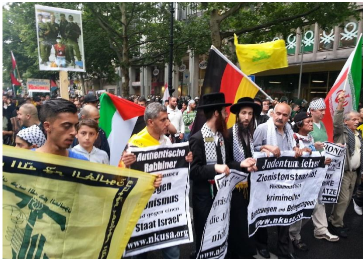
2014 Berlin Quds Day march

Each year, Hezbollah members and supporters gather publicly in Berlin for the annual Al Quds Day march, a global initiative of the Iranian regime initiated by Ayatollah Khomeini dedicated to Israel's destruction. The IZH is involved in the organization of the march, and funds buses of pro-Hezbollah, pro-Iranian regime activists to the event from the Imam Ali mosque in Hamburg, which the IZH operates. Prominent displays of Hezbollah flags and posters of Shia and "resistance axis" leaders , such as Ayatollahs Khomeini and Khamenei, Hassan Nasrallah, and Bashar al-Assad have been a fixture at the Quds Day rallies, although in 2016, the Berlin State Senate agreed to ban Hezbollah flags at the gathering going forward.