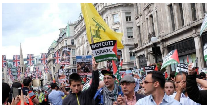
Hezbollah flag at Quds Day rally in London, U.K.

In London, the primary organizer of the annual Quds Day march is the Islamic Human Rights Commission (IHRC), a British Khomeinist organization that is strongly supportive of Hezbollah. IHRC cooperates with several other Iranian-linked organizations (Ahlulbayt Islamic Mission, InMinds) to stage the event, and these groups have joined forces with organizations linked to the Boycott, Divestment and Sanctions movement (BDS), groups with Islamist leanings, far-left/socialist movements, and fringe anti-Zionist Jewish groups to stage Quds Day rallies. In 2017 the IHRC issued an encouraging advisory ahead of the rally informing attendees that “you can bring a Hizbullah flag to show support for the political wing of Hizbullah ... because the political wing of Hizbullah is not a proscribed organisation.” Notably, Hezbollah has only one flag for its military and political wings – which prominently features an assault rifle – casting suspicion on IHRC’s disclaimer that its promotion of Hezbollah flags at Quds Day events in no way demonstrates support for Hezbollah’s proscribed military wing.