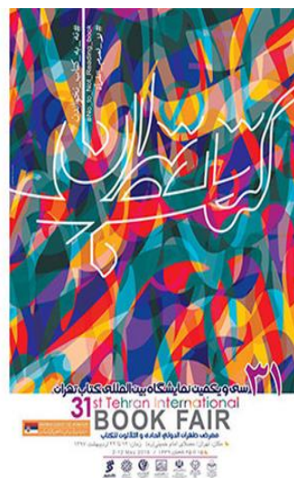
31 st Tehran International Book Fair Logo

Overview: The annual Tehran International Book Fair , which celebrated its 31 st iteration in May 2018, is one of the key cultural diplomacy initiatives of Iran’s Ministry of Culture and Islamic Guidance geared toward spreading Iran’s ideology. Iran’s regime established the Ministry of Culture and Islamic Guidance in 1986, during the presidency of current Supreme Leader Ali Khamenei, as a means of spreading Khomeinist principles at home and abroad. Domestically, the ministry is tasked with restricting access to press and media deemed not in adherence with Iran’s revolutionary ideology and religious sensibilities, and with promoting cultural endeavors which further religiosity in society and the regime’s worldview. The ministry is also a key agent of “exporting” Iran’s Islamic Revolution. Among its roles are, “informing the world community about the basis and aspirations of the Islamic Revolution; expansion of cultural ties with various nations and Muslims and with ‘the oppressed people in particular’; running the affairs of the Haj, operation of facilities for domestic and international tourism; and ‘preparing the ground for spread of the culture of Islamic Revolution and Persian language in other countries’” .