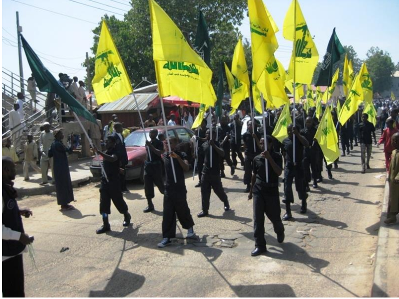
IMN members march with Hezbollah flags during 2015 Quds Day rally