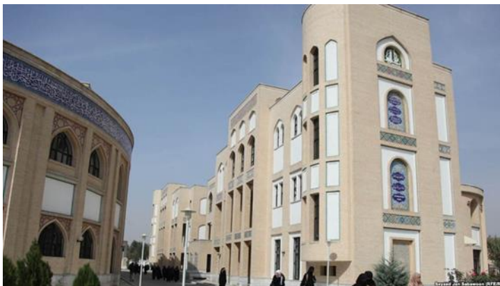
Khatam al-Nabyeen University campus in western Kabul

Iran seeks to ensure that its revolutionary Khomeinist ideology is dominant among Afghan Shia. To that end, Iran has focused on building schools and universities throughout Afghanistan and furnishing them with books, some benign, but many of which disseminate Iranian religious and political propaganda . One of the primary institutions oriented toward propagating fealty to velayat-e faqih is Khatam-al Nabyeen University, built in 2006 by an Iran-leaning cleric at a cost of $17 million .