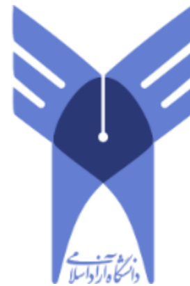
Islamic Azad University Logo

Overview: Islamic Azad University (IAU) was established in 1982 as a nominally private technical and engineering university by a decree of Ayatollah Khomeini . Ali Akbar Hashemi Rafsanjani, a member of Ayatollah Khomeini’s inner circle and two-term former president, played the leading role in conceptualizing and establishing Islamic Azad University , and went on to serve as head of the university’s founder’s committee, akin to chairman of the board, for over three decades until his death in January 2017. Rafsanjani was known as a pragmatic backer of limited social and economic liberalization, rather than ideological rigidity, as the best possible guarantor of sustaining Iran’s Islamic Revolution.