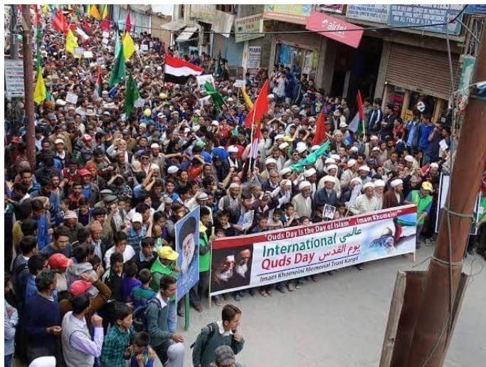
Quds Day rally in Kashmir

Revolutionary Activities Abroad: Iranian-affiliated agents and entities have helped grow Quds Day internationally, organizing events in over 80 countries annually. In addition to shows of support for the Palestinians and denunciations of Israel, displays of support for Iran and Hezbollah – including flags, and posters depicting Ayatollah Khomeini, Supreme Leader Ali Khamenei, and Hezbollah Secretary General Hassan Nasrallah – are a staple at Quds Day events worldwide.