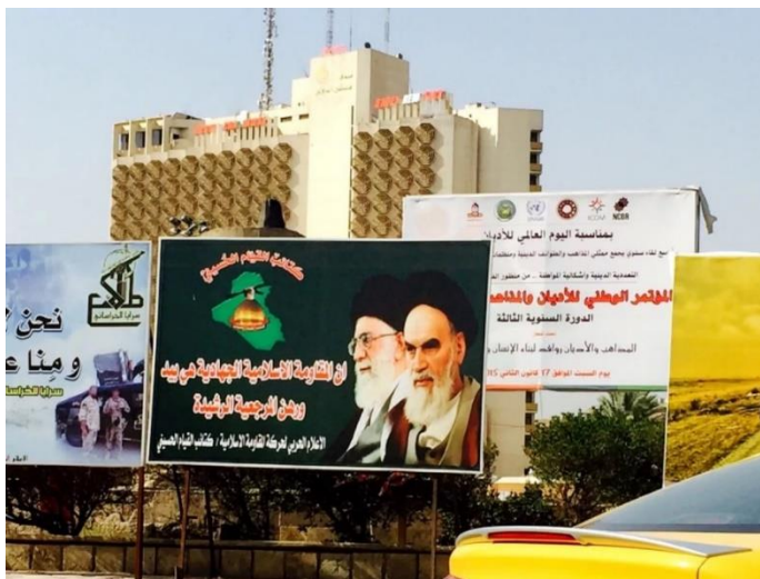
Billboard depicting Iran's current and former Supreme Leader in the Baghdad square where U.S. Marines previously toppled a statue of Saddam Hussein in 2003.

Following the "Hezbollah model" of dispensing patronage in the form of security and social welfare to fill vacuums created by the weak central government, Iran – through its control over Shia militias, affiliated charitable organizations, and a heavy media presence – has transformed one of its former greatest adversaries into a client state and a " jumping-off point to spread Iranian influence around the region. " Much as Hezbollah has translated its influence in Lebanon into political clout, Iraq's Shia militias translated popular support into a law passed in November 2016 recognizing the PMF as a government entity operating alongside the military , enshrining their legitimacy into law and ensuring funding from the Iraqi government for their operations, which has only served to deepen sectarian tensions.