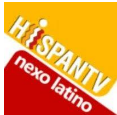
HispanTV Logo

HispanTV is the IRIB’s Tehran-based Spanish language network, which airs throughout Latin America and Spain. The network serves as an arm of Iran’s public diplomacy outreach to Latin America, a region in which Iran has invested significant political capital. According to Iranian officials, the goal of HispanTV is to “broaden the Iranian regime’s “ideological legitimacy” among friendly governments in the region – and to diminish the influence of “dominance seekers,” a thinly-veiled reference to the United States.”