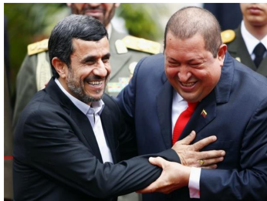
Iran's President Mahmoud Ahmadinejad is welcomed by Venezuela's President Hugo Chavez at Miraflores Palace in Caracas in 2012.

Third, Iran's ties to the region have accelerated in recent years due to the burgeoning of its alliance with the leftist, populist, anti-imperialist bloc Bolivarian Alliance of the Americas (ALBA) founded by former Venezuelan leader Hugo Chavez and former Cuban leader Fidel Castro. The ALBA project has been characterized by its member nations' desire to supplant U.S. dominance in the region, and in Iran, they found a willing anti-American strategic partner. Iran has joined ALBA's intergovernmental association as an observer state, providing it a forum “to have conversations with countries it otherwise would not have the ability to talk to, such as Ecuador, Bolivia, and Nicaragua.