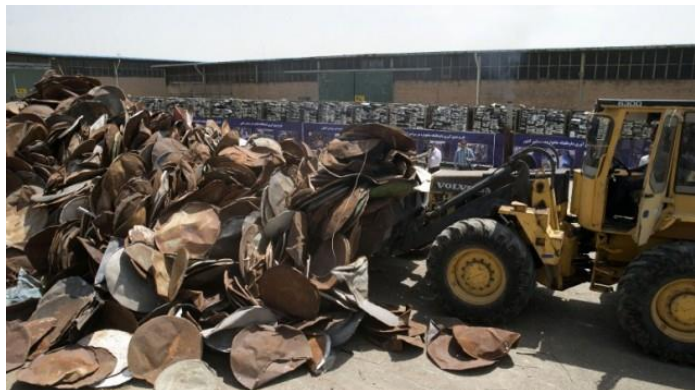
Ceremonial destruction of satellite dishes in Tehran

While IRIB’s occasionally heavy-handed methods have given its news programs a reputation for peddling pro-regime propaganda, a 2012 U.S. government funded survey found that 86% of Iranians still count IRIB among their top three sources of news, even though only half of respondents classified IRIB’s news content as “very trustworthy.” IRIB continues to dominate Iranian news consumption despite the mounted challenge posed by Persian-language news offerings by Western media organs, such as BBC and Voice of America, seeking to provide an alternative point of