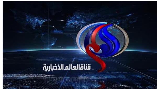
Al-Alam Logo

Al-Alam (The World) is IRIB's 24-hour Arabic language news channel with news bureaus based in Baghdad , Beirut , Damascus and Tehran . The network advocates for and seeks to advance the interests of the Iranian regime to the world's 300 million Arabs, and its satellite programming reaches viewers on five continents. Al-Alam offers a mouthpiece for Iran to influence Arab public opinion and shape perceptions of events on the ground in real time in accordance with the Iranian establishment's perspective.