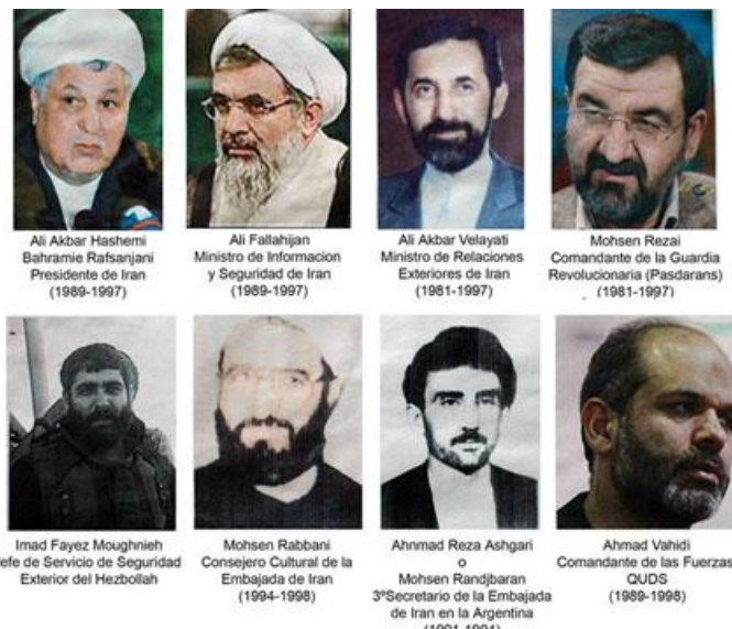
International arrest warrants issued by Argentinean court for Iranian and Hezbollah officials