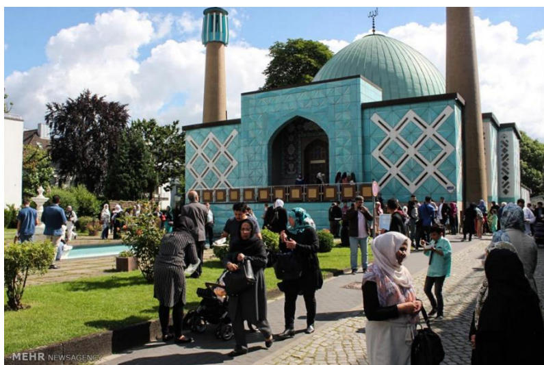
Imam Ali Mosque in Hamburg, Germany

Pro-Iranian activities in Germany center largely around the Islamic Center of Hamburg ( Islamisches Zentrum Hamburg , or IZH), an umbrella institution which plays a financial and organizational role in the operation of Shia associations around Germany. The IZH seeks to promote the Islamic Revolution in Germany via " brochures, events, prayers, rallies, and other activities ." According to Germany's intelligence agency, " Towards the outside world, the IZH acts as a mere religious organization that does not include political activities in its direct field of work. ... In reality however, IZH