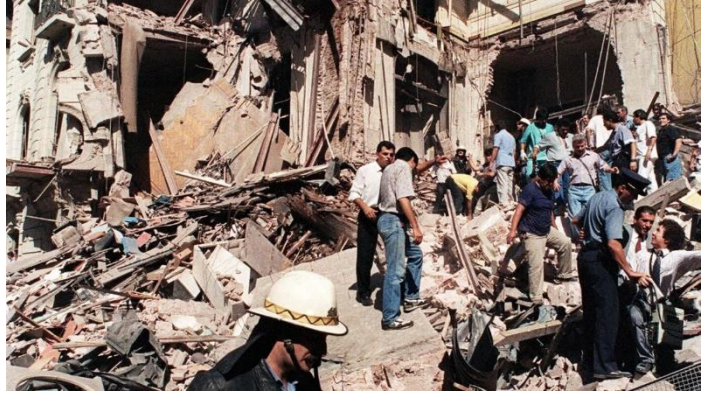
Aftermath of the 1992 Israeli Embassy bombing in Buenos Aires