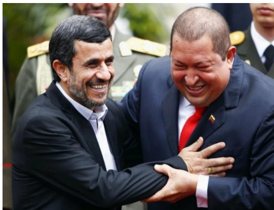
Iran's President Mahmoud Ahmadinejad is welcomed by Venezuela's President Hugo Chavez at Miraflores Palace in Caracas in 2012.

Third, Iran's ties to the region have accelerated in recent years due to the burgeoning of its alliance with the leftist, populist, anti-imperialist bloc Bolivarian Alliance of the Americas (ALBA) founded by former Venezuelan leader Hugo Chavez and former Cuban leader Fidel Castro. The ALBA project has been characterized by its member nations' desire to supplant U.S. dominance in the region, and in Iran, they found a willing anti-American strategic partner. Iran has joined ALBA's intergovernmental association as an observer state, providing it a forum “to have conversations with countries it otherwise would not have the ability to talk to,” such as Ecuador, Bolivia, and Nicaragua.