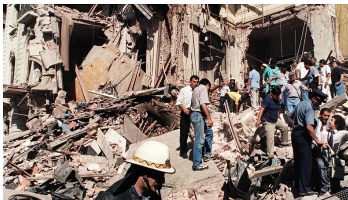
Aftermath of the 1992 Israeli Embassy bombing in Buenos Aires