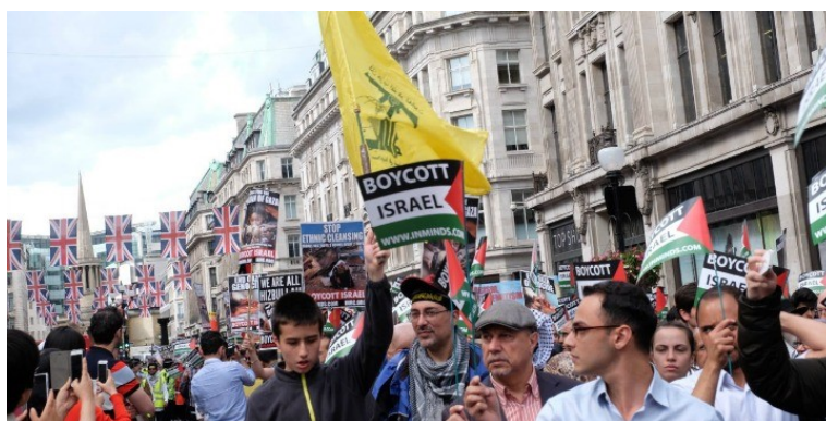
Hezbollah flag at Quds Day rally in London, U.K.

Quds Day events in Berlin, held annually since 1996, have also courted controversy due to calls for the destruction of Israel and Hezbollah participation. At the 2017 Quds Day rally, “ Mayor Michael Müller permitted nearly 600 Hezbollah supporters and members – and pro-Iranian regime activists – to march in the heart of the German capital. ” Hezbollah flags, as well as posters featuring Ayatollah Khomeini, Supreme Leader Ali Khamenei, Hezbollah Secretary General Hassan Nasrallah, and Syrian President Bashar al-Assad, the leading lights of the Iranian-led “resistance axis,” have featured prominently at Quds Day events in recent years . The Iranian-regime owned Islamic Center of Hamburg is the key organizer of Berlin’s Quds Day, and reportedly “ buses pro-Hezbollah and pro-Iranian regime members and activists to the annual event, which also serves as a gathering for the BDS campaign against Israel. ” Berlin has canceled its 2020 Quds Day after the German government banned all Hezbollah activities in the country, including those of the groups “political” wing.