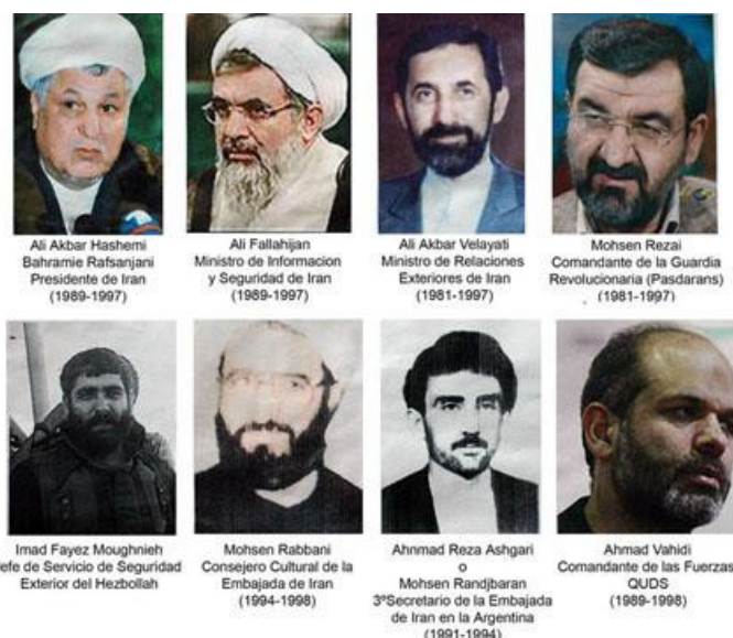
International arrest warrants issued by Argentinean court for Iranian and Hezbollah officials