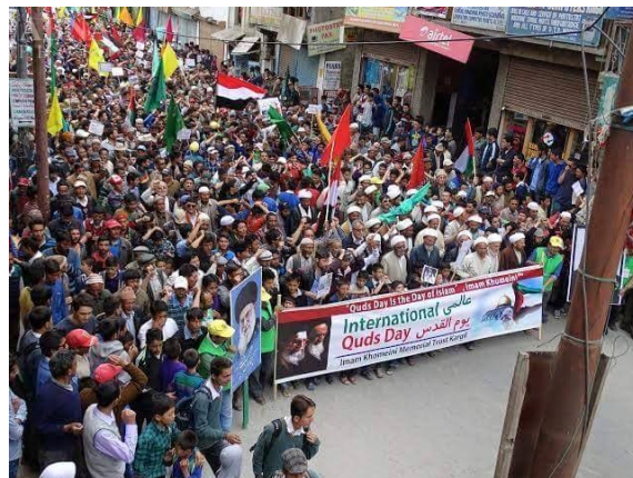
Quds Day rally in Kashmir

In London, the primary organizer of the annual Quds Day march is the Islamic Human Rights Commission (IHRC), a British Khomeinist organization that is strongly supportive of Hezbollah. IHRC cooperates with several other Iranian-linked organizations (Ahlulbayt Islamic Mission, InMinds) to stage the event, and these groups have joined forces with organizations linked to the Boycott, Divestment and Sanctions movement (BDS), groups with Islamist leanings, far-left/socialist movements, and fringe anti-Zionist Jewish groups to stage Quds Day rallies. In 2017 the IHRC issued an encouraging advisory ahead of the rally informing attendees that “you can bring a Hizbullah flag to show support for the political wing of Hizbullah ... because the political wing of Hizbullah is not a proscribed organisation.” Notably, Hezbollah has only one flag for its military and political wings – which prominently features an assault rifle – casting suspicion on IHRC’s disclaimer that its promotion of Hezbollah flags at Quds Day events in no way demonstrates support for Hezbollah’s proscribed military wing.