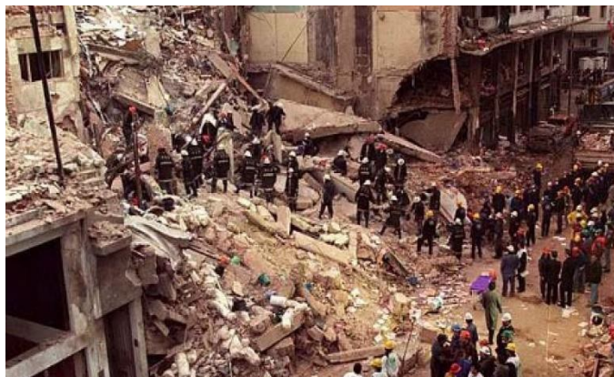
Aftermath of the 1994 AMIA bombing

Less than two years after the attack on the Israeli Embassy, as investigators were still in the process of piecing together what had happened, Iran carried out another bombing targeting Buenos Aires’ Jewish community. On the morning of July 18, 1994, a Hezbollah operative detonated a suicide car bomb laden with 300-400 kilograms of explosives in front of the Asociación Mutual Israelita Argentina (AMIA) Jewish community center , killing 85 and wounding over 200.