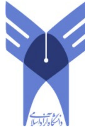
Islamic Azad University Logo

Overview: Islamic Azad University (IAU) was established in 1982 as a nominally private technical and engineering university by a decree of Ayatollah Khomeini . Ali Akbar Hashemi Rafsanjani, a member of Ayatollah Khomeini's inner circle and two-term former president, played the leading role in conceptualizing and establishing Islamic Azad University , and went on to serve as head of the university's founder's committee, akin to chairman of the board, for over three decades until his death in January 2017. Rafsanjani was known as a pragmatic backer of limited social and economic liberalization, rather than ideological rigidity, as the best possible guarantor of sustaining Iran's Islamic Revolution.