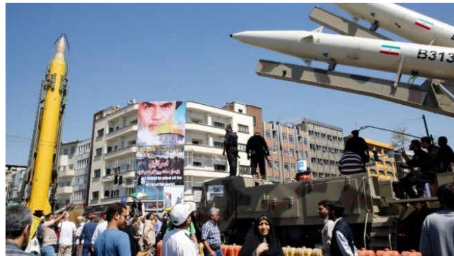
Ballistic missiles on display

Ahead of the 2020 Quds Day, the Office of Iran's Supreme Leader also released an anti-Semitic poster calling for "the final solution: resistance until referendum," evoking Nazi-era rhetoric. The poster depicted Jerusalem following a Muslim reconquest with a poster of slain former IRGC-Quds Force commander Qassem Soleimani prominently displayed on the city's walls.