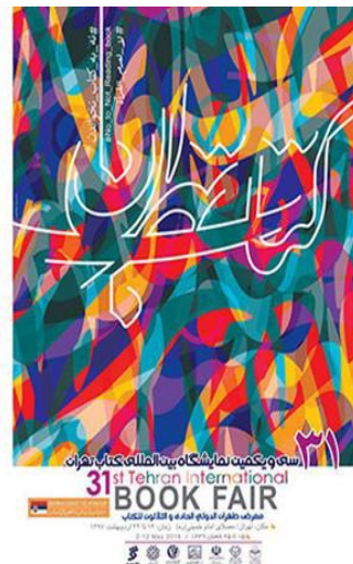
31 st Tehran International Book Fair Logo

Overview: The annual Tehran International Book Fair , which celebrated its 31 st iteration in May 2018, is one of the key cultural diplomacy initiatives of Iran's Ministry of Culture and Islamic Guidance geared toward spreading Iran's ideology. Iran's regime established the Ministry of Culture and Islamic Guidance in 1986, during the presidency of current Supreme Leader Ali Khamenei, as a means of spreading Khomeinist principles at home and abroad. Domestically, the ministry is tasked with restricting access to press and media deemed not in adherence with Iran's revolutionary ideology and religious sensibilities, and with promoting cultural endeavors which further religiosity in society and the regime's worldview. The ministry is also a key agent of "exporting" Iran's Islamic Revolution. Among its roles are, " informing the world community about the basis and aspirations of the Islamic Revolution; expansion of cultural ties with various nations and Muslims and with 'the oppressed people in particular'; running the affairs of the Haj, operation of facilities for domestic and international tourism; and 'preparing the ground for spread of the culture of Islamic Revolution and Persian language in other countries'".