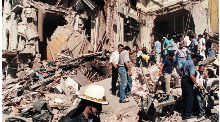
Aftermath of the 1992 Israeli Embassy bombing in Buenos Aires