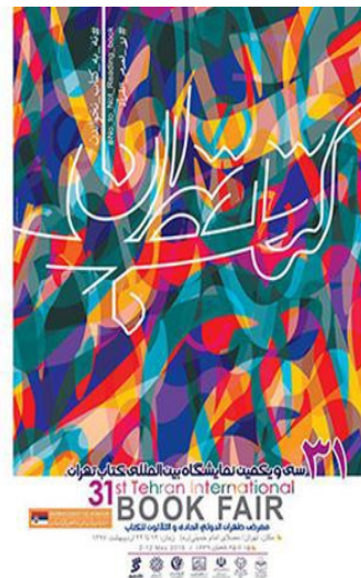
31 st Tehran International Book Fair Logo

Overview: The annual Tehran International Book Fair , which celebrated its 31 st iteration in May 2018, is one of the key cultural diplomacy initiatives of Iran's Ministry of Culture and Islamic Guidance geared toward spreading Iran's ideology. Iran's regime established the Ministry of Culture and Islamic Guidance in 1986, during the presidency of current Supreme Leader Ali Khamenei, as a means of spreading Khomeinist principles at home and abroad. Domestically, the ministry is tasked with restricting access to press and media deemed not in adherence with Iran's revolutionary ideology and religious sensibilities, and with promoting cultural endeavors which further religiosity in society and the regime's worldview. The ministry is also a key agent of "exporting" Iran's Islamic Revolution. Among its roles are, " informing the world community about the basis and aspirations of the Islamic Revolution; expansion of cultural ties with various nations and Muslims and with 'the oppressed people in particular'; running the affairs of the Haj, operation of facilities for domestic and international tourism; and 'preparing the ground for spread of the culture of Islamic Revolution and Persian language in other countries'".