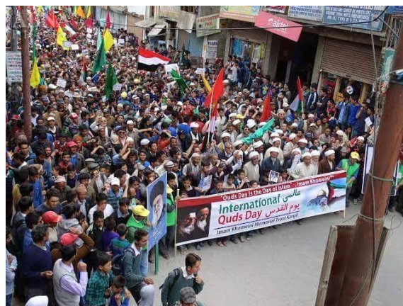
Quds Day rally in Kashmir

In London, the primary organizer of the annual Quds Day march is the Islamic Human Rights Commission (IHRC), a British Khomeinist organization that is strongly supportive of Hezbollah. IHRC cooperates with several other Iranian-linked organizations (Ahlulbayt Islamic Mission, InMinds) to stage the event, and these groups have joined forces with organizations linked to the Boycott, Divestment and Sanctions movement (BDS), groups with Islamist leanings, far-left/socialist movements, and fringe anti-Zionist Jewish groups to stage Quds Day rallies. In 2017 the IHRC issued an encouraging advisory ahead of the rally informing attendees that “you can bring a Hizbullah flag to show support for the political wing of Hizbullah ... because the political wing of Hizbullah is not a proscribed organisation.” Notably, Hezbollah has only one flag for its military and political wings – which prominently features an assault rifle – casting suspicion on IHRC’s disclaimer that its promotion of Hezbollah flags at Quds Day events in no way demonstrates support for Hezbollah’s proscribed military wing.