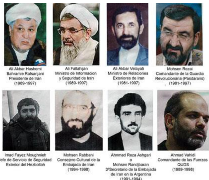
International arrest warrants issued by Argentinean court for Iranian and Hezbollah officials