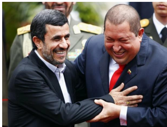
Iran's President Mahmoud Ahmadinejad is welcomed by Venezuela's President Hugo Chavez at Miraflores Palace in Caracas in 2012.

Third, Iran's ties to the region have accelerated in recent years due to the burgeoning of its alliance with the leftist, populist, anti-imperialist bloc Bolivarian Alliance of the Americas (ALBA) founded by former Venezuelan leader Hugo Chavez and former Cuban leader Fidel Castro. The ALBA project has been characterized by its member nations' desire to supplant U.S. dominance in the region, and in Iran, they found a willing anti-American strategic partner. Iran has joined ALBA's intergovernmental association as an observer state, providing it a forum “to have conversations with countries it otherwise would not have the ability to talk to,” such as Ecuador, Bolivia, and Nicaragua.