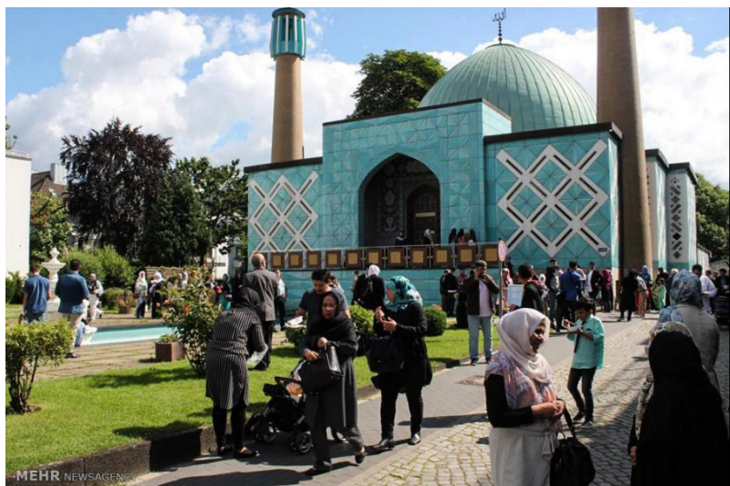
Imam Ali Mosque in Hamburg, Germany

Pro-Iranian activities in Germany center largely around the Islamic Center of Hamburg ( Islamisches Zentrum Hamburg , or IZH), an umbrella institution which plays a financial and organizational role in the operation of Shia associations around Germany. The IZH seeks to promote the Islamic Revolution in Germany via "brochures, events, prayers, rallies, and other activities" . According to Germany's intelligence agency, "Towards the outside world, the IZH acts as a mere religious organization that does not include political activities in its direct field of work. ... In reality however, IZH