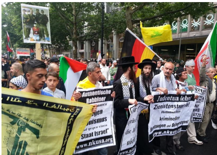
2014 Berlin Quds Day march

Each year, Hezbollah members and supporters gather publicly in Berlin for the annual Al Quds Day march, a global initiative of the Iranian regime initiated by Ayatollah Khomeini dedicated to Israel's destruction. The IZH is involved in the organization of the march, and funds buses of pro-Hezbollah, pro-Iranian regime activists to the event from the Imam Ali mosque in Hamburg, which the IZH operates. Prominent displays of Hezbollah flags and posters of Shia and "resistance axis" leaders , such as Ayatollahs Khomeini and Khamenei, Hassan Nasrallah, and Bashar al-Assad have been a fixture at the Quds Day rallies, although in 2016, the Berlin State Senate agreed to ban Hezbollah flags at the gathering going forward.