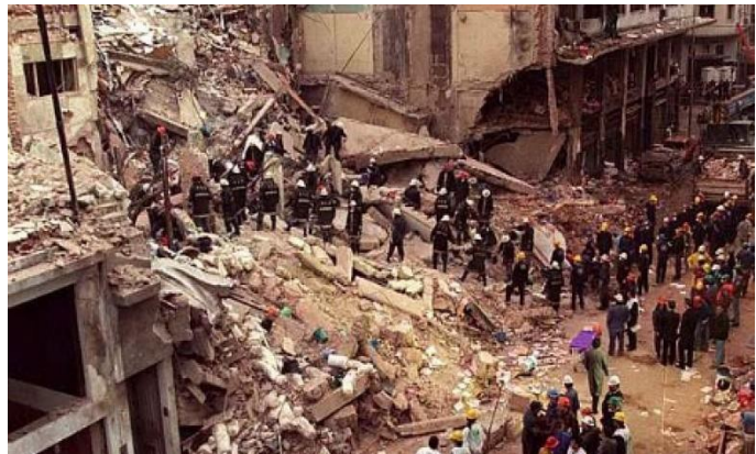
Aftermath of the 1994 AMIA bombing

Less than two years after the attack on the Israeli Embassy, as investigators were still in the process of piecing together what had happened, Iran carried out another bombing targeting Buenos Aires’ Jewish community. On the morning of July 18, 1994, a Hezbollah operative detonated a suicide car bomb laden with 300-400 kilograms of explosives in front of the Asociación Mutual Israelita Argentina (AMIA) Jewish community center , killing 85 and wounding over 200.