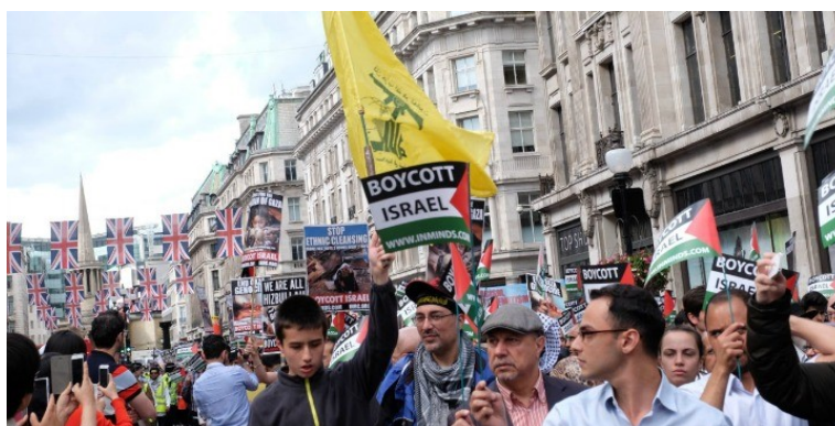
Hezbollah flag at Quds Day rally in London, U.K.

Quds Day events in Berlin, held annually since 1996, have also courted controversy due to calls for the destruction of Israel and Hezbollah participation. At the 2017 Quds Day rally, “ Mayor Michael Müller permitted nearly 600 Hezbollah supporters and members – and pro-Iranian regime activists – to march in the heart of the German capital. ” Hezbollah flags, as well as posters featuring Ayatollah Khomeini, Supreme Leader Ali Khamenei, Hezbollah Secretary General Hassan Nasrallah, and Syrian President Bashar al-Assad, the leading lights of the Iranian-led “resistance axis,” have featured prominently at Quds Day events in recent years . The Iranian-regime owned Islamic Center of Hamburg is the key organizer of Berlin’s Quds Day, and reportedly “ buses pro-Hezbollah and pro-Iranian regime members and activists to the annual event, which also serves as a gathering for the BDS campaign against Israel. ” Berlin has canceled its 2020 Quds Day after the German government banned all Hezbollah activities in the country, including those of the groups “political” wing.