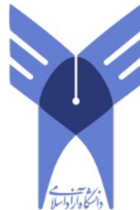
Islamic Azad University Logo

Overview: Islamic Azad University (IAU) was established in 1982 as a nominally private technical and engineering university by a decree of Ayatollah Khomeini . Ali Akbar Hashemi Rafsanjani, a member of Ayatollah Khomeini's inner circle and two-term former president, played the leading role in conceptualizing and establishing Islamic Azad University , and went on to serve as head of the university's founder's committee, akin to chairman of the board, for over three decades until his death in January 2017. Rafsanjani was known as a pragmatic backer of limited social and economic liberalization, rather than ideological rigidity, as the best possible guarantor of sustaining Iran's Islamic Revolution.