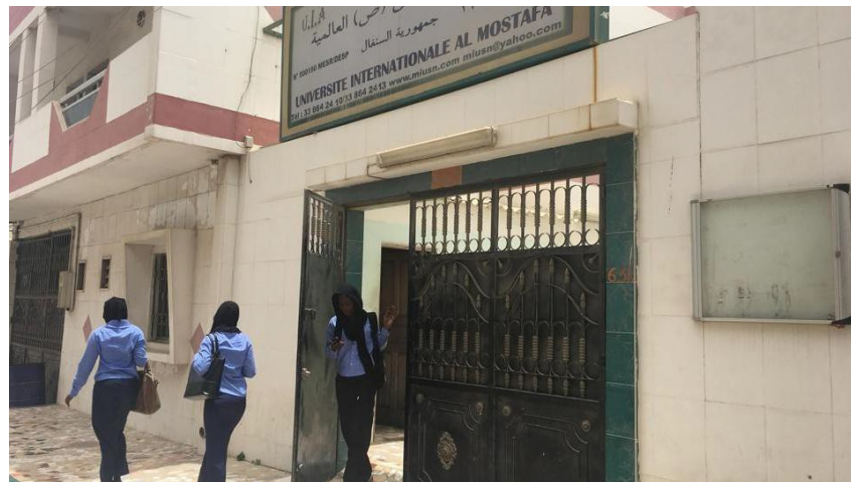
Al-Mustafa University branch in Dakar, Senegal

Al-Mustafa International University has also established a branch in Dakar, indoctrinating 150 Senegalese students each year into Khomeinist ideology. The students receive “ free tuition, a stipend, and breakfast ” to entice them, and are expected to “promote Iran online or in books” in return for the Iranian largesse. They are also given enough money to enable them and their families to visit Qom during the course of their studies, furthering their indoctrination.