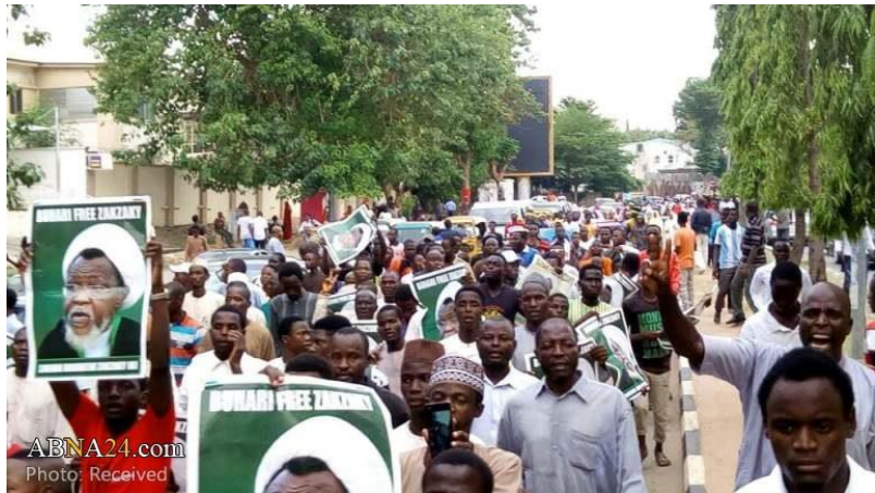
IMN members stage "Free Zakzaky" protest in Abuja, Nigeria in May 2018

In December 2015, the IMN was holding a procession when the Nigerian military alleges that attendees attacked a motorcade transporting the army's chief of staff . The incident touched off several days of clashes which led to the deaths of several hundred IMN members. The Nigerian authorities took Sheikh Zakzaky and his wife into custody, and they remain detained to this day. Iran's Supreme Leader, President, and foreign minister, as well as Hezbollah Secretary General Hassan Nasrallah , have all called for