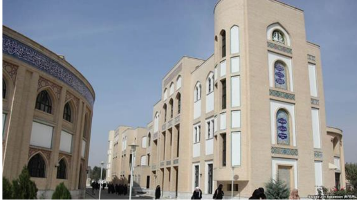
Khatam al-Nabiyeen University campus in western Kabul