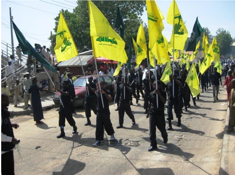
IMN members march with Hezbollah flags during 2015 Quds Day rally