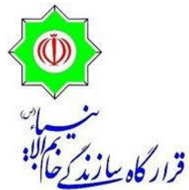
Khatam al-Anbiya Logo

Overview: The Iranian regime controls a vast business empire which has increasingly come under the control of the Islamic Revolutionary Guard Corps (IRGC) since the presidency of Mahmoud Ahmadinejad. Established by Ayatollah Khomeini in the months following the February 1979 Islamic Revolution, the 1980-1988 Iran-Iraq War witnessed the transformation of the IRGC from a hastily organized militia into one of Iran's most powerful institutions. The IRGC emerged from the crucible of the war as a formidable fighting force with considerable organizational and engineering prowess .