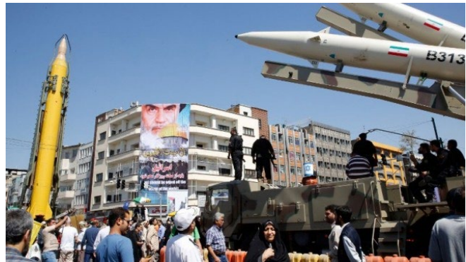
Ballistic missiles on display

Ahead of the 2020 Quds Day, the Office of Iran’s Supreme Leader also released an anti-Semitic poster calling for “the final solution: resistance until referendum,” evoking Nazi-era rhetoric. The poster depicted Jerusalem following a Muslim reconquest with a poster of slain former IRGC-Quds Force commander Qassem Soleimani prominently displayed on the city’s walls.