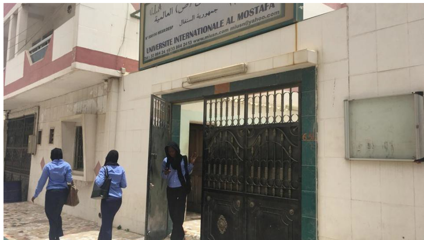
Al-Mustafa University branch in Dakar, Senegal

Al-Mustafa International University has also established a branch in Dakar, indoctrinating 150 Senegalese students each year into Khomeinist ideology. The students receive “ free tuition, a stipend, and breakfast ” to entice them, and are expected to “promote Iran online or in books” in return for the Iranian largesse. They are also given enough money to enable them and their families to visit Qom during the course of their studies, furthering their indoctrination.