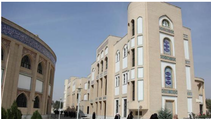
Khatam al-Nabyeen University campus in western Kabul

Iran seeks to ensure that its revolutionary Khomeinist ideology is dominant among Afghan Shia. To that end, Iran has focused on building schools and universities throughout Afghanistan and furnishing them with books, some benign, but many of which disseminate Iranian religious and political propaganda . One of the primary institutions oriented toward propagating fealty to velayat-e faqih is Khatam-al Nabyeen University, built in 2006 by an Iran-leaning cleric at a cost of $17 million . Iran's links to the university are deliberately opaque. There are no Iranians