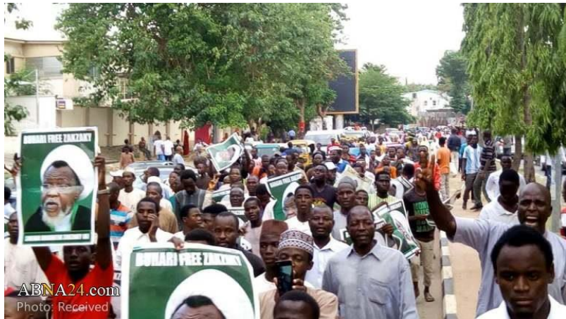
IMN members stage "Free Zakzaky" protest in Abuja, Nigeria in May 2018

In December 2015, the IMN was holding a procession when the Nigerian military alleges that attendees attacked a motorcade transporting the army's chief of staff . The incident touched off several days of clashes which led to the deaths of several hundred IMN members. The Nigerian authorities took Sheikh Zakzaky and his wife into custody, and they remain detained to this day. Iran's Supreme Leader, President, and foreign minister, as well as Hezbollah Secretary General Hassan Nasrallah , have all called for