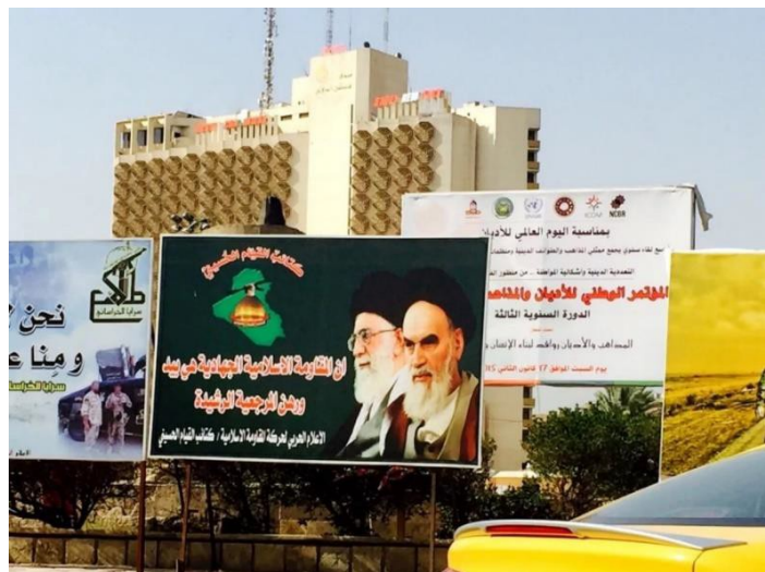
Billboard depicting Iran's current and former Supreme Leader in the Baghdad square where U.S. Marines previously toppled a statue of Saddam Hussein in 2003.

Following the "Hezbollah model" of dispensing patronage in the form of security and social welfare to fill vacuums created by the weak central government, Iran – through its control over Shia militias, affiliated charitable organizations, and a heavy media presence – has transformed one of its former greatest adversaries into a client state and a " jumping-off point to spread Iranian influence around the region ." Much as Hezbollah has translated its influence in Lebanon into political clout, Iraq's Shia militias translated popular support into a law passed in November 2016 recognizing the PMF as a government entity operating alongside the military , enshrining their legitimacy into law and ensuring funding from the Iraqi government for their