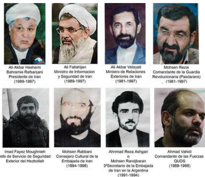
International arrest warrants issued by Argentinean court for Iranian and Hezbollah officials