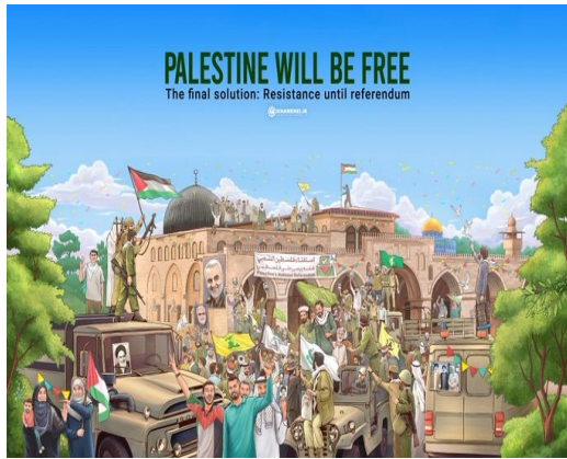
2020 Quds Day Poster

from their cars. The decision to put on a modified Quds Day underscores that even a pandemic will not deter the Iranian regime from holding its annual display of demonization of Israel.