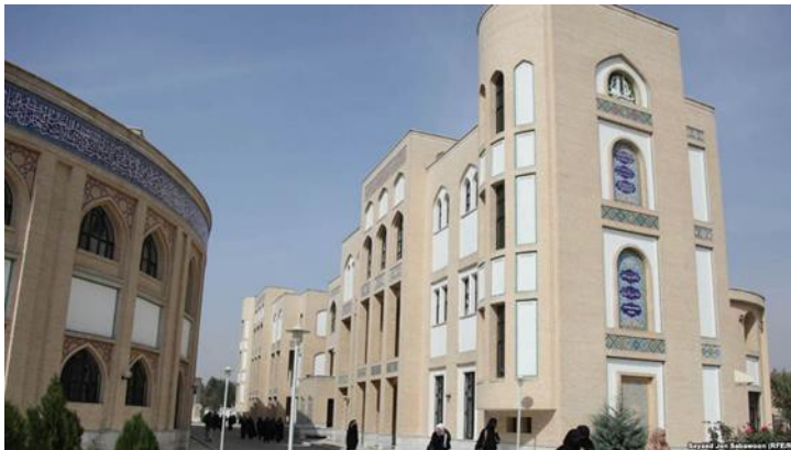
Khatam al-Nabyeen University campus in western Kabul

Iran seeks to ensure that its revolutionary Khomeinist ideology is dominant among Afghan Shia. To that end, Iran has focused on building schools and universities throughout Afghanistan and furnishing them with books, some benign, but many of which disseminate Iranian religious and political propaganda . One of the primary institutions oriented toward propagating fealty to velayat-e faqih is Khatam-al Nabyeen University, built in 2006 by an Iran-leaning cleric at a cost of $17 million . Iran's links to the university are deliberately opaque. There are no Iranians