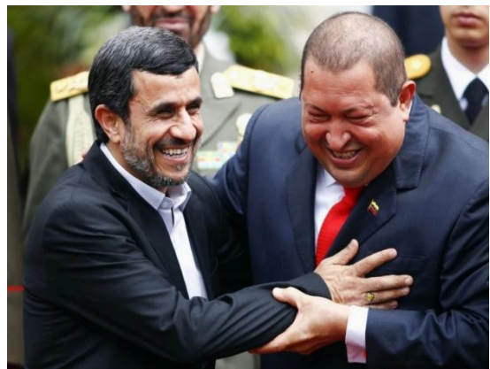
Iran's President Mahmoud Ahmadinejad is welcomed by Venezuela's President Hugo Chavez at Miraflores Palace in Caracas in 2012.

Third, Iran's ties to the region have accelerated in recent years due to the burgeoning of its alliance with the leftist, populist, anti-imperialist bloc Bolivarian Alliance of the Americas (ALBA) founded by former Venezuelan leader Hugo Chavez and former Cuban leader Fidel Castro. The ALBA project has been characterized by its member nations' desire to supplant U.S. dominance in the region, and in Iran, they found a willing anti-American strategic partner. Iran has joined ALBA's intergovernmental association as an observer state, providing it a forum “to have conversations with countries it otherwise would not have the ability to talk to, such as Ecuador, Bolivia, and Nicaragua.