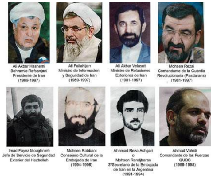
International arrest warrants issued by Argentinean court for Iranian and Hezbollah officials