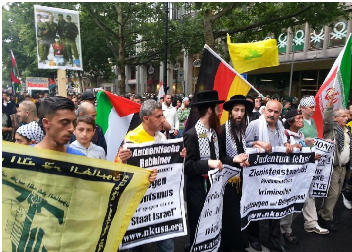
2014 Berlin Quds Day march

The IZH is involved in the organization of the march, and funds buses of pro-Hezbollah, pro-Iranian regime activists to the event from the Imam Ali mosque in Hamburg, which the IZH operates. Prominent displays of Hezbollah flags and posters of Shia and "resistance axis" leaders , such as Ayatollahs Khomeini and Khamenei, Hassan Nasrallah, and Bashar al-Assad have been a fixture at the Quds Day rallies, although in 2016, the Berlin State Senate agreed to ban Hezbollah flags at the gathering going forward.