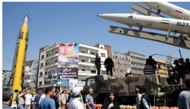
Ballistic missiles on display

Ahead of the 2020 Quds Day, the Office of Iran’s Supreme Leader also released an anti-Semitic poster calling for “the final solution: resistance until referendum,” evoking Nazi-era rhetoric. The poster depicted Jerusalem following a Muslim reconquest with a poster of slain former IRGC-Quds Force commander Qassem Soleimani prominently displayed on the city’s walls.