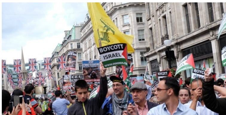
Hezbollah flag at Quds Day rally in London, U.K.

In London, the primary organizer of the annual Quds Day march is the Islamic Human Rights Commission (IHRC), a British Khomeinist organization that is strongly supportive of Hezbollah. IHRC cooperates with several other Iranian-linked organizations (Ahlulbait Islamic Mission, InMinds) to stage the event, and these groups have joined forces with organizations linked to the Boycott, Divestment and Sanctions movement (BDS), groups with Islamist leanings, far-left/socialist movements, and fringe anti-Zionist Jewish groups to stage Quds Day rallies. In 2017 the IHRC issued an encouraging advisory ahead of the rally informing attendees that “you can bring a Hizbullah flag to show support for the political wing of Hizbullah ... because the political wing of Hizbullah is not a proscribed organisation.” Notably, Hezbollah has only one flag for its military and political wings – which prominently features an assault rifle – casting suspicion on IHRC’s disclaimer that its promotion of Hezbollah flags at Quds Day events in no way demonstrates support for Hezbollah’s proscribed military wing.