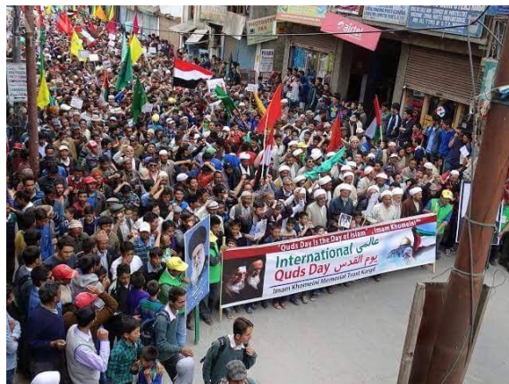
Quds Day rally in Kashmir

Although Hezbollah itself draws no distinction between its military and political wings, the European Union has designated only the military wing of Hezbollah as terrorist organization, allowing the group to overtly organize, demonstrate, and carry out fundraising activities throughout the continent. The Iranian terrorist proxy has therefore played a prominent role at Quds Day rallies in European capitals such as London and Berlin