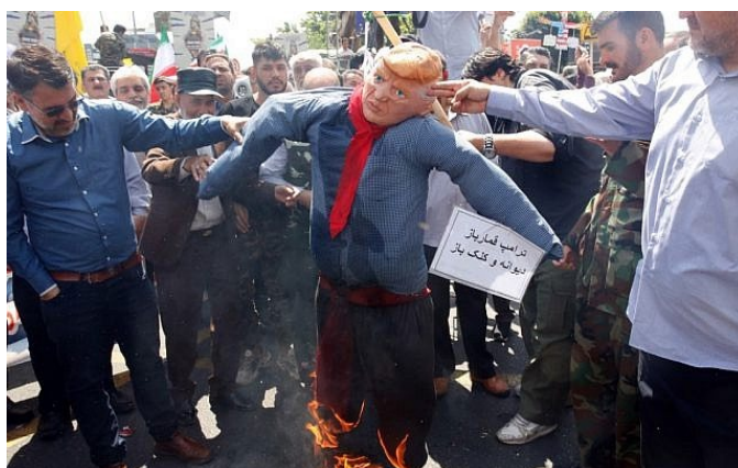
Demonstrators burning effigy of President Trump

Iranian politicians abidingly attend Quds Day rallies and deliver anti-Israel diatribes to showcase their steadfast commitment to the regime’s opposition to Israel. Tehran’s May 2019 Quds Day festivities were centered around Iran’s rejection of the Trump administration’s forthcoming Israeli-Palestinian peace plan, branded as “the deal of the century.” The procession featured numerous examples of incitement , including demonstrators burning American and Israeli flags and effigies of President Trump and Prime Minister Benjamin Netanyahu. In remarks to reporters, President Rouhani declared , "Palestinians will definitely emerge victorious in confrontation with the Zionist aggressors. ... The issue of Deal of the Century will undoubtedly turn into the bankruptcy of the century and will certainly not yield results."