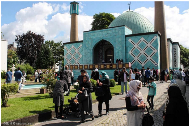
Imam Ali Mosque in Hamburg, Germany

Pro-Iranian activities in Germany center largely around the Islamic Center of Hamburg ( Islamisches Zentrum Hamburg , or IZH), an umbrella institution which plays a financial and organizational role in the operation of Shia associations around Germany. The IZH seeks to promote the Islamic Revolution in Germany via " brochures, events, prayers, rallies, and other activities ." According to Germany's intelligence agency, " Towards the outside world, the IZH acts as a mere religious organization that does not include political activities in its direct field of work. ... In reality however, IZH