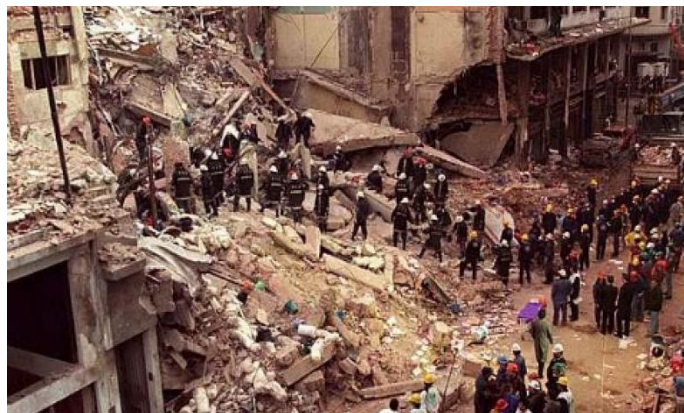
Aftermath of the 1994 AMIA bombing

Less than two years after the attack on the Israeli Embassy, as investigators were still in the process of piecing together what had happened, Iran carried out another bombing targeting Buenos Aires’ Jewish community. On the morning of July 18, 1994, a Hezbollah operative detonated a suicide car bomb laden with 300-400 kilograms of explosives in front of the Asociación Mutual Israelita Argentina (AMIA) Jewish community center , killing 85 and wounding over 200.