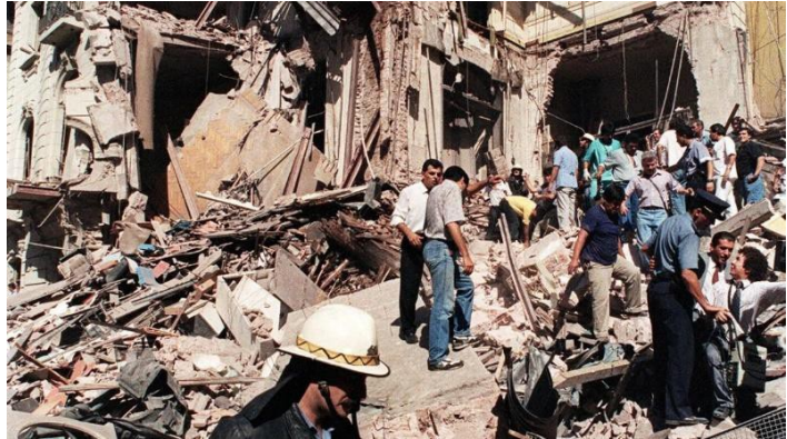
Aftermath of the 1992 Israeli Embassy bombing in Buenos Aires