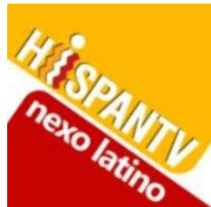
HispanTV Logo

HispanTV is the IRIB’s Tehran-based Spanish language network, which airs throughout Latin America and Spain. The network serves as an arm of Iran’s public diplomacy outreach to Latin America, a region in which Iran has invested significant political capital. According to Iranian officials, the goal of HispanTV is to “broaden the Iranian regime’s “ideological legitimacy” among friendly governments in the region – and to diminish the influence of “dominance seekers,” a thinly-veiled reference to the United States.”