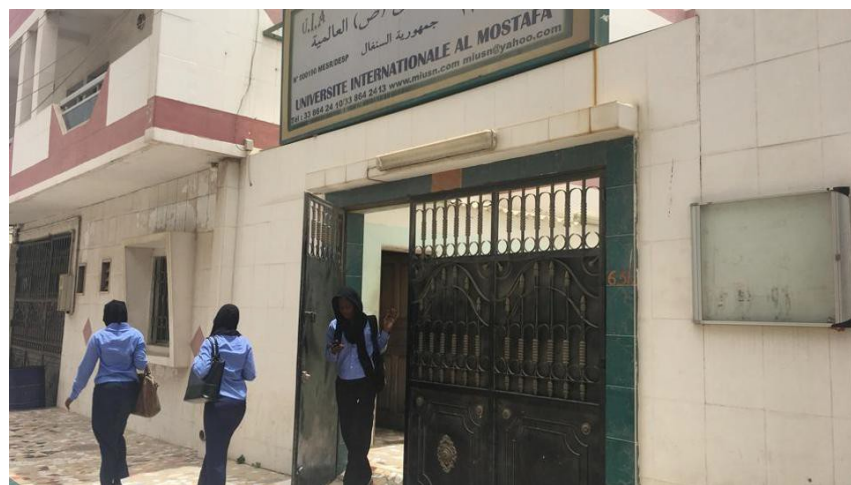
Al-Mustafa University branch in Dakar, Senegal

Al-Mustafa International University has also established a branch in Dakar, indoctrinating 150 Senegalese students each year into Khomeinist ideology. The students receive “ free tuition, a stipend, and breakfast ” to entice them, and are expected to “promote Iran online or in books” in return for the Iranian largesse. They are also given enough money to enable them and their families to visit Qom during the course of their studies, furthering their indoctrination.