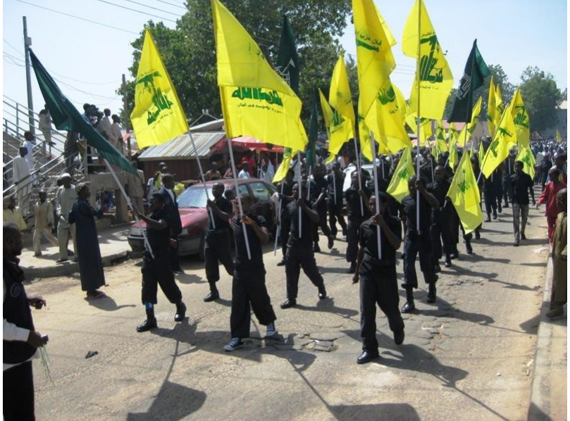
IMN members march with Hezbollah flags during 2015 Quds Day rally