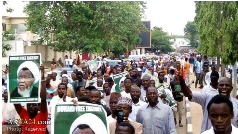
IMN members stage "Free Zakzaky" protest in Abuja, Nigeria in May 2018

In December 2015, the IMN was holding a procession when the Nigerian military alleges that attendees attacked a motorcade transporting the army's chief of staff . The incident touched off several days of clashes which led to the deaths of several hundred IMN members. The Nigerian authorities took Sheikh Zakzaky and his wife into custody, and they remain detained to this day. Iran's Supreme Leader, President, and foreign minister, as well as Hezbollah Secretary General Hassan Nasrallah , have all called for