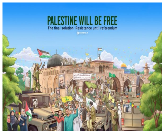
2020 Quds Day Poster

from their cars. The decision to put on a modified Quds Day underscores that even a pandemic will not deter the Iranian regime from holding its annual display of demonization of Israel.