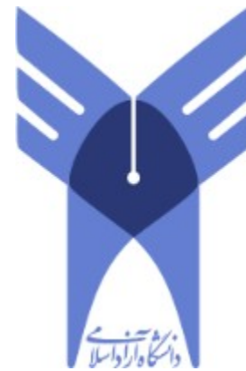
Islamic Azad University Logo

Overview: Islamic Azad University (IAU) was established in 1982 as a nominally private technical and engineering university by a decree of Ayatollah Khomeini . Ali Akbar Hashemi Rafsanjani, a member of Ayatollah Khomeini's inner circle and two-term former president, played the leading role in conceptualizing and establishing Islamic Azad University , and went on to serve as head of the university's founder's committee, akin to chairman of the board, for over three decades until his death in January 2017. Rafsanjani was known as a pragmatic backer of limited social and economic liberalization, rather than ideological rigidity, as the best possible guarantor of sustaining Iran's Islamic Revolution.