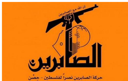
Al-Sabirin movement's flag

Iran has been the leading sponsor of Gaza-based Palestinian Islamic Jihad (PIJ), which was founded in 1979, inspired by the success of the Islamic Revolution. Iranian funding of PIJ has been in place since 1987 . During the early 1990s, much of PIJ organizational and operations-based support came from the Iranian sub-group Hezbollah . The PIJ is extremely open about Iran being its main supporter: “ All of the weapons in Gaza are provided by Iran... the largest share of this financial and military support is coming from Iran. ” It should be noted that while Iran is PIJ’s main supporter, PIJ is neither an arm of Iran’s Islamic Revolution nor a vehicle for spreading Iran-style Shiism in the Palestinian territories, although it has faced such accusations as a means of discrediting the organization among the Palestinian populace. Still, PIJ’s leadership has expressed admiration for Iran’s Islamic Revolution for reviving the overall cause of radical Islamism and jihadism , and the group has adopted a conciliatory posture toward Shiites, viewing them as members of the community of Muslim believers, unlike other Sunni jihadist organizations which consider Shiism to be heretical.