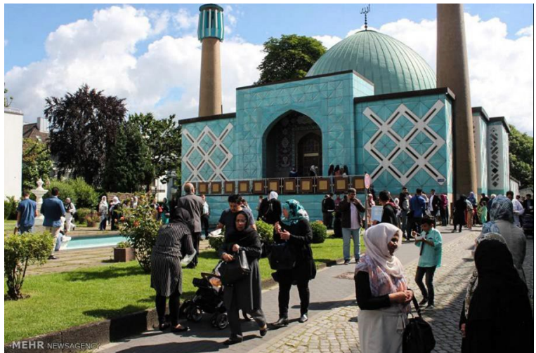
Imam Ali Mosque in Hamburg, Germany

Hezbollah maintains a robust presence in Germany. According to an October 2017 report of the Federal Office of the Protection of the Constitution, Germany's domestic intelligence agency, there are 950 active Hezbollah members in Germany , classified as belonging to the organization's "political wing," a number which has remained steady for over a decade. The Hezbollah supporters regularly meet at Iran-backed mosques and Islamic community centers around the country. There are believed to be around 30 such institutions in this pro-Iranian network, including the Imam Mahdi Centre in Münster-Hiltrup , the Imam Reza mosque in Berlin , and the Imam Ali Mosque in Hamburg . The ongoing Middle Eastern refugee crisis further compounds the security risk posed to Germany by Hezbollah. The 2017 intelligence report states that, " Since mid-2015 there are increased indications of fighters from Shi'ite militias entering Germany as legal refugees. "