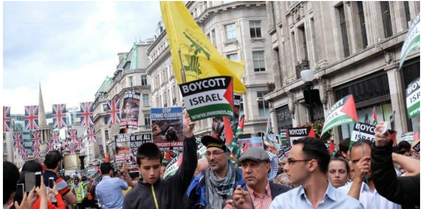
Hezbollah flag at Quds Day rally in London, U.K.

In London, the primary organizer of the annual Quds Day march is the Islamic Human Rights Commission (IHRC), a British Khomeinist organization that is strongly supportive of Hezbollah. IHRC cooperates with several other Iranian-linked organizations (Ahlulbayt Islamic Mission, InMinds) to stage the event, and these groups have joined forces with organizations linked to the Boycott, Divestment and Sanctions movement (BDS), groups with Islamist leanings, far-left/socialist movements, and fringe anti-Zionist Jewish groups to stage Quds Day rallies. In 2017 the IHRC issued an encouraging advisory ahead of the rally informing attendees that “you can bring a Hezbollah flag to show support for the political wing of Hezbollah ... because the political wing of Hezbollah is not a proscribed organisation.” Notably, Hezbollah has only one flag for its military and political wings – which prominently features an assault rifle – casting suspicion on IHRC’s disclaimer that its promotion of Hezbollah flags at Quds Day events in no way demonstrates support for Hezbollah’s proscribed military wing.