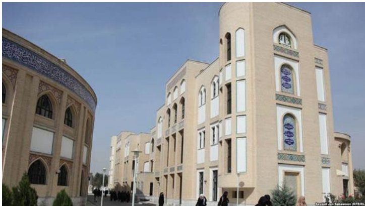
Khatam al-Nabiyen University campus in western Kabul

The Iranian diversity and inclusion rhetoric obscures Iran's true intentions in Afghanistan. Under the banner of supporting the Hazara's fight for self-defense , Iran could grow armed militias whose devotion lies with the Supreme Leader of Iran, especially after the Taliban took over Afghanistan following the U.S. withdrawal. As in other areas where Iranian-backed militias operate, these would have the potential to exert influence over the government and advance Iranian foreign policy interests.