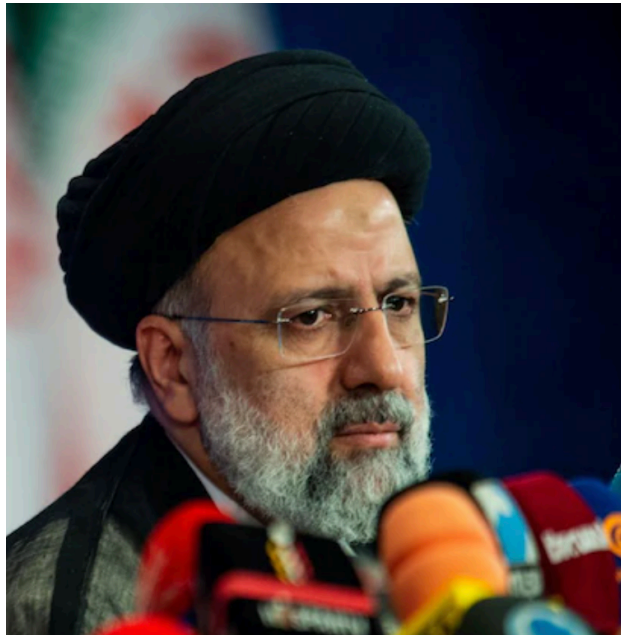
President Raisi speaks at a press conference after his election victory

for change were directed at the very top of the Iranian system, with some protestors chanting “death to Khamenei” and other anti-regime slogans.