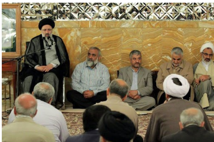
Seated from Left to Right: Ebrahim Raisi, former Commander of the IRGC-Basij Forces Mohammed Reza Naqdi, former Commander-in-Chief of the IRGC Mohammad Ali Jafari, and former Commander of the IRGC-Quds Force Qassem Soleimani

Beyond his contretemps against Rouhani, Raisi’s candidacy carried symbolic importance. Given the speculation surrounding him being a contender to succeed Khamenei as Supreme Leader, the presidency would be a natural steppingstone for Raisi because of Khamenei having previously served as president. It was a way for him to test his brand electorally as well as deploy the vast resources and platform that Astan-e Quds Razavi provides. In fact, Raisi’s candidacy carried the perceived imprimatur of the Islamic Revolutionary Guard Corps (IRGC). Pictures circulated of him in a chair, with senior commanders of the IRGC—including its then Commander-in-Chief Mohammad Ali Jafari and then Commander of the Quds Force Qassem Soleimani —seated at his knee. The picture was a sign of deference for Raisi.