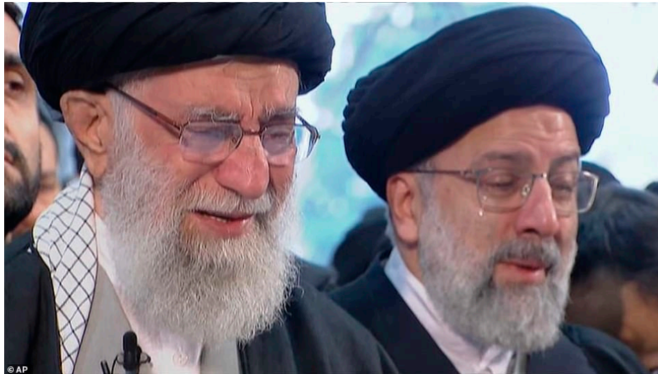
Left to Right: Supreme Leader Ayatollah Ali Khamenei and Chief Justice Ayatollah Ebrahim Raisi at the funeral of former IRGC-Quds Force Commander Qassem Soleimani