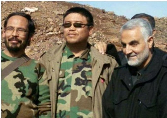
Former IRGC Quds-Force Commander Qasem Soleimani in Syria with commanders of the Iran-backed Fatemiyoun Brigade, an Afghan Shi'a militia.