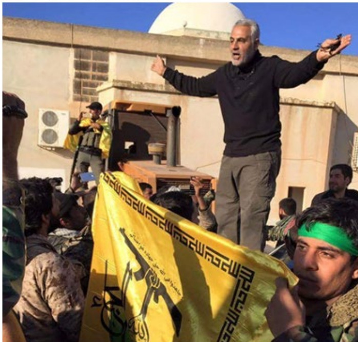
IRGC-Quds Force Commander Qassem Soleimani , who is said to be running the war in Syria, addressing Iran-backed fighters near Aleppo in 2015.