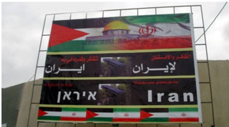
Billboards in Gaza in 2012 thanking Iran for their military support in fighting Israel, particularly their supply of longer-range rockets to target Israeli cities.