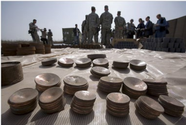
Bomb components from Iran used to make deadly improvised explosives devices (IEDs) seized by American forces in Iraq in 2007.