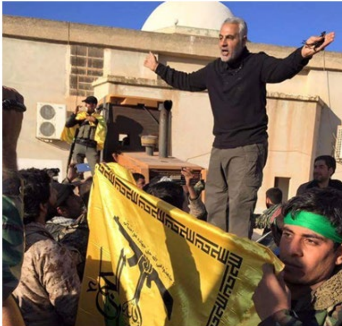
IRGC-Quds Force Commander Qassem Soleimani , who is said to be running the war in Syria, addressing Iran-backed fighters near Aleppo in 2015.