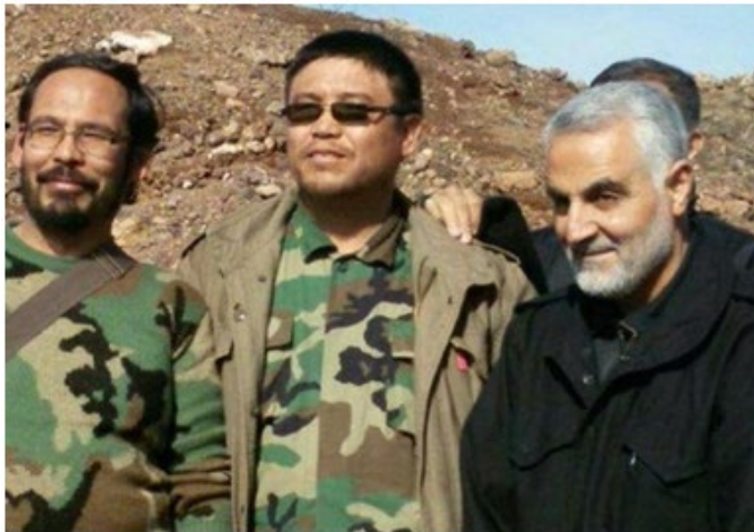
Former IRGC Quds-Force Commander Qasem Soleimani in Syria with commanders of the Iran-backed Fatemiyoun Brigade, an Afghan Shi'a militia.