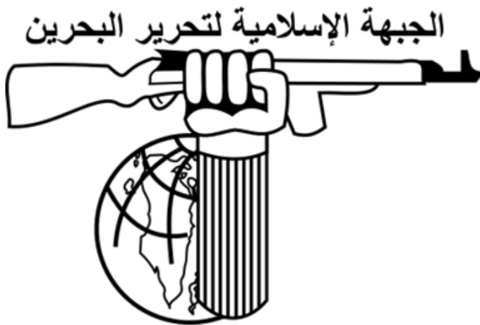
The Iranian proxy Islamic Front for the Liberation of Bahrain (logo pictured) failed in its coup attempt in 1981.

After the killing of former Commander of the IRGC's Quds Force Qassem Soleimani, reports circulated about the formation of the Qassem Soleimani Brigades, dedicated to avenging his death. Bahraini officials alleged that they foiled a terror plot in early 2020, which involved an attempted attack on a visiting foreign delegation, using an explosive device. In December 2020, the United States imposed terrorism sanctions on the al-Mukhtar Brigades under Executive Order 13224. In the designation , the U.S. government cited the significant risk of committing acts of terrorism, as well as past plots against U.S. personnel in Bahrain and the offering of cash rewards for the assassination of Bahraini officials.