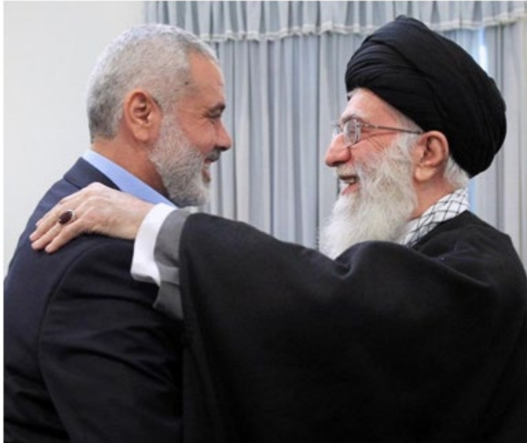
Supreme Leader Ayatollah Khamenei embracing Hamas leader Ismail Haniyeh in Tehran in 2012.

A key ideological pillar of the Islamic Republic of Iran is its struggle to “liberate” the Muslim lands of Palestine and the holy city of Jerusalem from what it disparagingly refers to as the illegitimate “Zionist Regime.” To help achieve these ends, Iran has armed, trained, and funded –often working indirectly through Hezbollah – Palestinian terrorist groups, despite the Sunni-Shi’a divide between them.