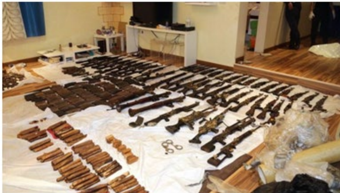
A cache of Iranian weapons seized by Kuwaiti authorities in August 2015.