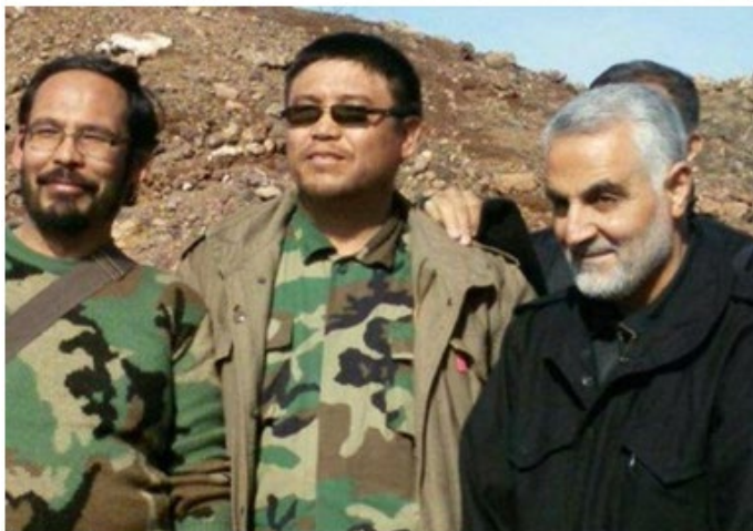
Former IRGC Quds-Force Commander Qasem Soleimani in Syria with commanders of the Iran-backed Fatemiyoun Brigade, an Afghan Shi'a militia.