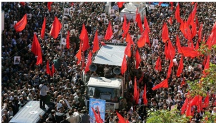
Funeral in Tehran for a senior IRGC commander killed fighting in Syria in 2015.

Both the NDF and Lebanese Hezbollah appear to be permanent fixtures in Syria as well, remaking a country that historically " was home to many competing ideological forms of Shiism " in Iran's image. Hezbollah and the NDF's secure Iranian alignment and loyalty to its revolutionary ethos ensures that Iran will be the dominant military and cultural power in Syria for the foreseeable future. As Iran has further entrenched its control and influence over Syria, it and its proxies have taken on increasingly confrontational postures against the U.S. and Israel. Iran has engaged in armed drone skirmishes with Israeli forces, and conducted a missile strike against ISIS fighters that landed within three miles of U.S. forces . These incidents indicate that Iran plans on using Syria as a base from which to provoke the U.S. and its allies and is not concerned about dragging Syria into its proxy battles.