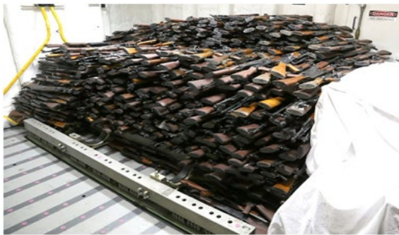
A shipment of Iranian weapons destined for the Houthis seized by American naval forces in the Arabian Sea in 2015.

In December 2017, the Houthis assassinated former Yemeni president Ali Abdullah Saleh, their erstwhile enemy and then ally, after he turned against them again and proposed reconciliation with the Saudi-led anti-Houthi coalition. Iranian leaders and regime-affiliated media outlets celebrated Saleh’s killing and said the Houthis are inspired by Iran’s 1979 Islamic Revolution and similar to Iranian-supported militant groups in Syria, Iraq, and Lebanon.