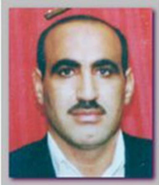
Abdullah Muhammad Rajab Abd al-Rahman (alias Ahmad Hasan Abu al-Khayr al-Masri and Abdul Khayr al-Masri)