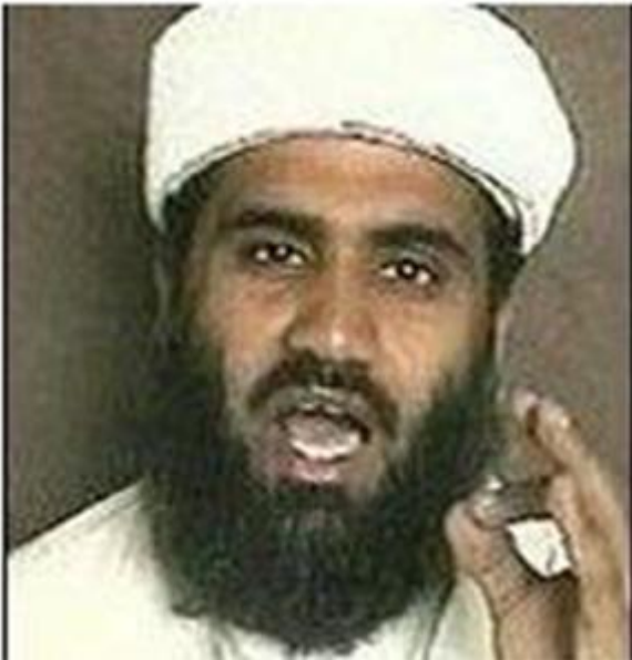
Suleiman Abu Ghaith (Imprisoned)