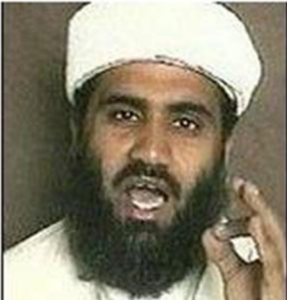
Suleiman Abu Ghaith (Imprisoned)

Connection: After the fall of Afghanistan in 2001, Abd al-Rahman fled to Iran. In 2015, Abu Khayr al-Masri was reportedly one of the five jihadists who were reportedly released from Iranian custody in exchange for an Iranian diplomat who had been kidnapped in Yemen.