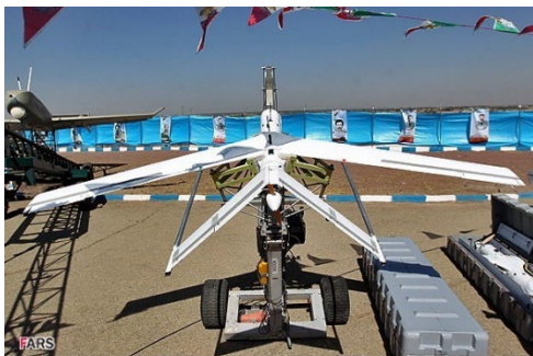
Yasir ( Wikimedia Commons )

Yasir: The RQ-170 Sentinel is not the only U.S. drone Iran claims to have captured and subsequently reverse engineered. In December 2012, the IRGC claimed that it hijacked a Boeing ScanEagle UAV conducting an ISR mission in its airspace over Kharg Island, off Iran's southern coast in the Persian Gulf. The ScanEagle is a small, low-cost ISR UAV with a wingspan of 10 feet, a flight endurance of 20 hours, and a range of over 100 km. The IRGC released footage of the captured drone, which appeared to have sustained only minimal damage. For its part, the U.S. Navy denied that it had lost any drones on recent missions in the region, but intimated that it had lost some in the Gulf waters in the past. It is also possible the captured drone belonged to a U.S. ally, as the UAE, Canada, and Australia also use the ScanEagle and are active in the Gulf.