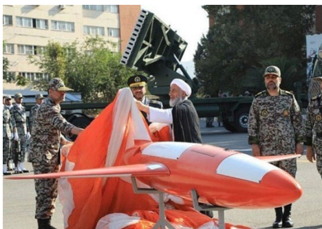
Kian ( Tasnim News )

to mass produce the Khodkar. Given the UAV's bright orange paint job, it is more likely that if there is more than one Khodkar in existence, the drone would be used to target exercises rather than surveillance or combat missions.