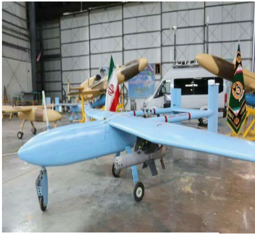
Atlas carrying Qa'em guided bombs

In April 2020, at a ceremony marking Army Day, Iran displayed several new UAV systems, which it delivered to its army for the first time. Among the systems which the army's air force and air defense units took delivery of was an upgraded Ababil-3. The Ababil-3 is now reportedly mounted with Qa'em precision-guided bombs , indicating that Iran has converted the Ababil from an ISR drone to one with combat capabilities. While Iran has produced several drone systems over the past decade specifically for combat purposes, the conversion of the Ababil-3, like the Mohajer-6 before, shows that Iran is focused on upgrading ISR platforms into drones with integrated attack capabilities. Iran also unveiled an upgraded version of the Ababil-3 called the Atlas at the Army Day ceremony. The