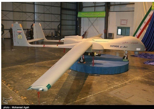
Fotros