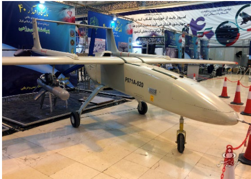
Mohajer-6

The Mohajer-2, first observed in 1996, had a range of 50 km. and an endurance of 1.5 hours. The newest version, the Mohajer-6, which was first announced in 2016 and went into mass production in 2018, demonstrates the rapid advancements Iran has made in drone technology in recent years. According to the Iranian Ministry of Defense and Armed Forces Logistics (MODAFL), the Mohajer-6 has a range of 200 km. and an endurance of 12 hours . It is a persistent ISTAR (Intelligence, Surveillance, Target Acquisition, and Reconnaissance) UAV, meaning that its operators have the integrated capacity to process the raw intelligence data collected through surveillance and