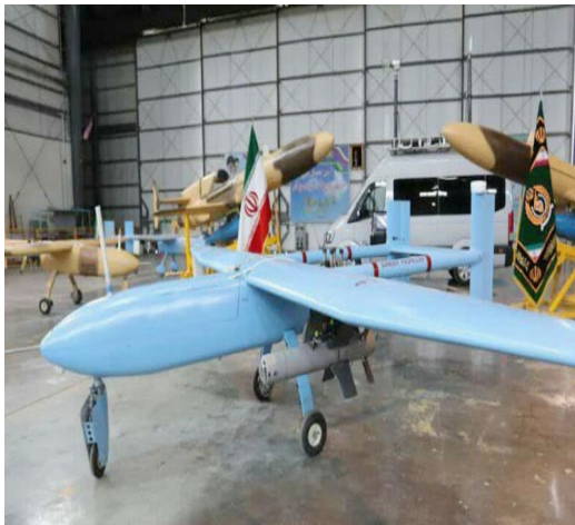
Atlas carrying Qa'em guided bombs

In April 2020, at a ceremony marking Army Day, Iran displayed several new UAV systems, which it delivered to its army for the first time. Among the systems which the army's air force and air defense units took delivery of was an upgraded Ababil-3. The Ababil-3 is now reportedly mounted with Qa'em precision-guided bombs , indicating that Iran has converted the Ababil from an ISR drone to one with combat capabilities. While Iran has produced several drone systems over the past decade specifically for combat purposes, the conversion of the Ababil-3, like the Mohajer-6 before, shows that Iran is focused on upgrading ISR platforms into drones with integrated attack capabilities. Iran also unveiled an upgraded version of the Ababil-3 called the Atlas at the Army Day ceremony. The