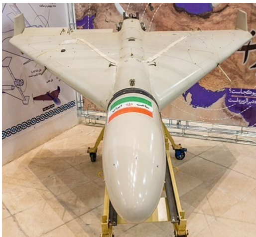
Shahed-136

Shahed-136: Iran unveiled the Shahed-136 in 2021, though reports indicated that the UAV had been operational on the battlefields of the Syrian Civil War and the Yemeni Civil War prior to its official unveiling. In 2020, the Shahed-136 was first identified in Yemen.