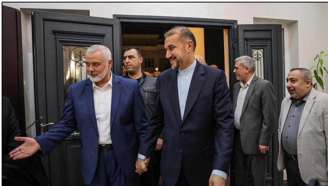
Hamas Leader Ismail Haniyeh Meets with Hossein Amir-Abdollahian in Qatar on December 20, 2023

As is by now well-documented, victims have recounted how Hamas terrorists mutilated the genitals of Israelis, raped them, sliced women’s breasts off, beheaded innocents, baked babies in ovens, and other horrific crimes. The Islamic Republic has celebrated and applauded these atrocities, with the regime’s Supreme Leader Ayatollah Ali Khamenei stating publicly that “we kiss the hands of those who planned the attack on the Zionist regime.” 6 Abdollahian has met with Hamas leadership regularly since October 7, including in Qatar, where he praised their attack.