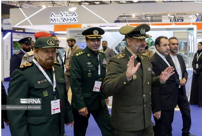
Mohammad Ashtiani (in olive uniform), Iran's U.S.-sanctioned defense minister, at DIMDEX 2024. Visible in the photo are IRGC officers accompanying him.