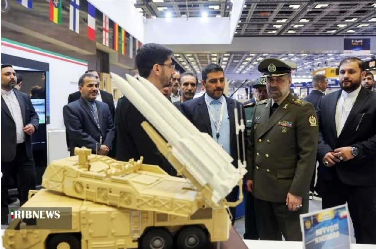
Mohammad Ashtiani (in uniform), Iran’s U.S.-sanctioned defense minister, at DIMDEX 2024