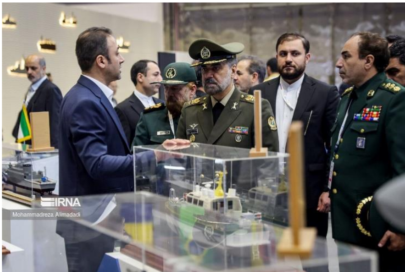
Mohammad Ashtiani (in olive uniform), Iran's U.S.-sanctioned defense minister, at DIMDEX 2024. Visible in the photo are IRGC officers accompanying him.