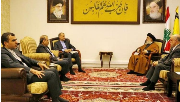
Islamic Republic of Iran's Foreign Minister Hossein Amir-Abdollahian Meeting with Hezbollah's Secretary General in February 2024