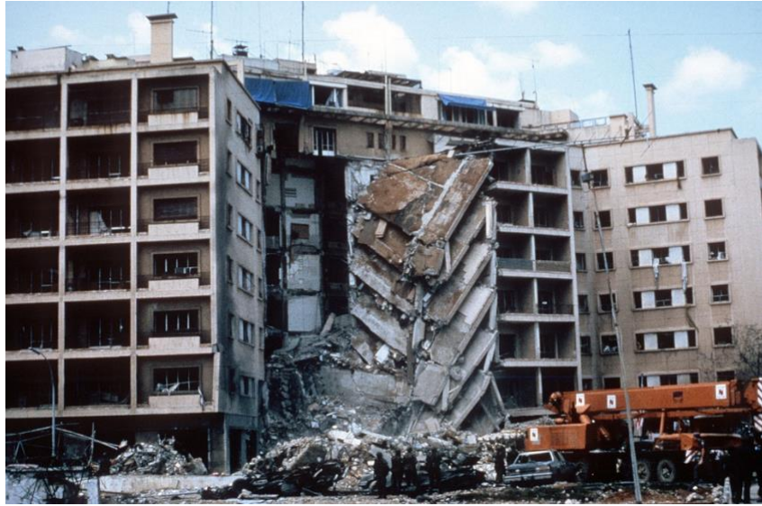
Aftermath of Hezbollah’s Bombing of the U.S. Embassy in Beirut on April 18, 1983

Four decades later, Amir-Abdollahian, who is a card-carrying senior member of the same IRGC—which incubated and directed Hezbollah’s terrorism in the 1980s—is being inexplicably welcomed into the United States. He is also irrefutably complicit in the October 7, 2023 massacre that took place in southern Israel. Following the atrocity, which left approximately 1,200 slaughtered, including American citizens, Amir-Abdollahian flew to Qatar to meet with the primary instigator of the October 7 atrocity, Hamas leader Ismail Haniyeh, and to offer his congratulations and support. The Wall Street Journal has reported that Amir-Abdollahian personally participated in planning meetings for the October 7 attack. The same publication subsequently revealed that the IRGC provided training to 500 Hamas terrorists in Iran in the months before October 7. 56 Amir-Abdollahian has also repeatedly met with the Secretary-General of Hezbollah Hassan Nasrallah, the same organization which bombed the U.S. Embassy in Beirut 41 years ago.