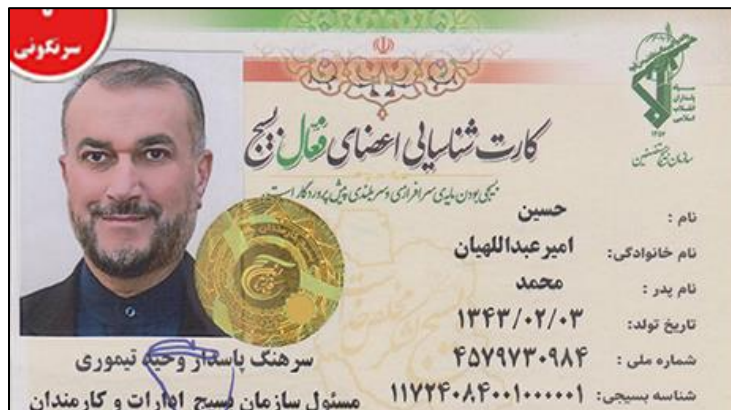
Copy of the IRGC's Basij Membership Card of Hossein Amir-Abdollahian

Hossein Amir-Abdollahian is an active card-carrying member of the Islamic Revolutionary Guard Corps' ("IRGC") Basij paramilitary force with the rank of colonel. The IRGC is a U.S.-designated Foreign Terrorist Organization ("FTO"), which has perpetrated beatings, torture, rape, and mass executions against the Iranian people. Iranians routinely describe the IRGC as their ISIS. 4 To allow Abdollahian into Switzerland to attend the World Economic Forum would be a slap in the face to the brave Iranian people who have been fighting for an end to the totalitarian Islamic Republic in the name of "Woman, Life, Freedom" since at least September 2022, following the murder of Mahsa Amini at the hands of Iranian security authorities. Abdollahian has repeatedly lied to the world about the crimes against humanity the regime has committed against its people.