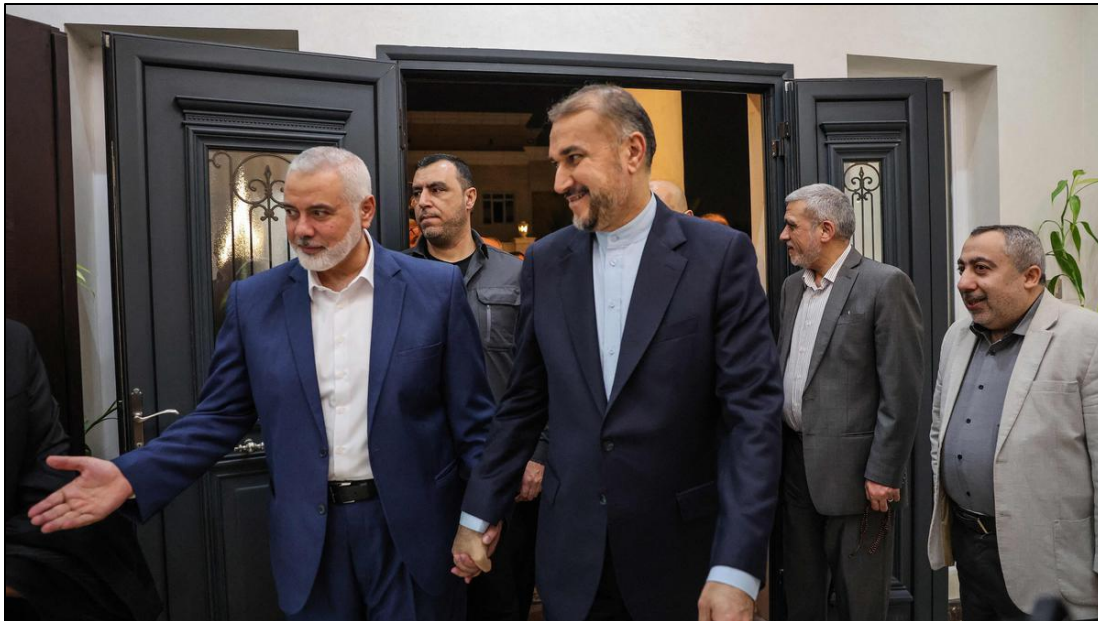
Hamas Leader Ismail Haniyeh Meets with Hossein Amir-Abdollahian in Qatar on December 20, 2023

As is by now well-documented, victims have recounted how Hamas terrorists mutilated the genitals of Israelis, raped them, sliced women’s breasts off, beheaded innocents, baked babies in ovens, and other horrific crimes. Swiss nationals were murdered on October 7. The Islamic Republic has celebrated and applauded these atrocities, with the regime’s Supreme Leader Ayatollah Ali Khamenei stating publicly that “we kiss the hands of those who planned the attack on the Zionist regime.” 6 Abdollahian has met with Hamas leadership regularly since October 7, including in Qatar, where he praised their attack.