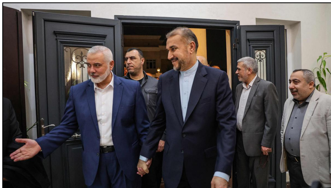
Hamas Leader Ismail Haniyeh Meets with Hossein Amir-Abdollahian in Qatar on December 20, 2023

As is by now well-documented, victims have recounted how Hamas terrorists mutilated the genitals of Israelis, raped them, sliced women’s breasts off, beheaded innocents, baked babies in ovens, and other horrific crimes. The Islamic Republic has celebrated and applauded these atrocities, with the regime’s Supreme Leader Ayatollah Ali Khamenei stating publicly that “we kiss the hands of those who planned the attack on the Zionist regime.” 6 Abdollahian has met with Hamas leadership regularly since October 7, including in Qatar, where he praised their attack.