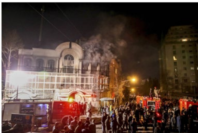
The Saudi Embassy in Tehran on fire in January 2016 after being attacked by an Iranian mob.