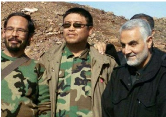
IRGC Quds-Force Commander Qasem Soleimani in Syria with commanders of the Iran-backed Fatemiyoun Brigade, an Afghan Shi'a militia.