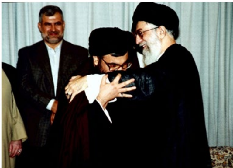
Hezbollah Secretary General Hassan Nasrallah (L) embracing and showing deference to Iranian Supreme Leader Ayatollah Khamenei (R)