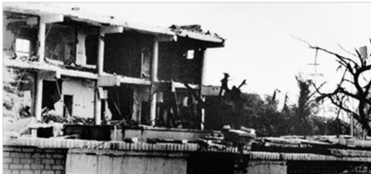
Iranian proxies were responsible for a series of coordinated bombings in Kuwait in 1983, which struck the U.S. embassy (pictured), among other targets.

Iran has long attempted to increase its influence over Kuwait due to the latter's sizeable Shiite minority ( approximately 30 percent of its population), extensive oil reserves, proximity to the Gulf, and importance to American and Saudi Arabian security.