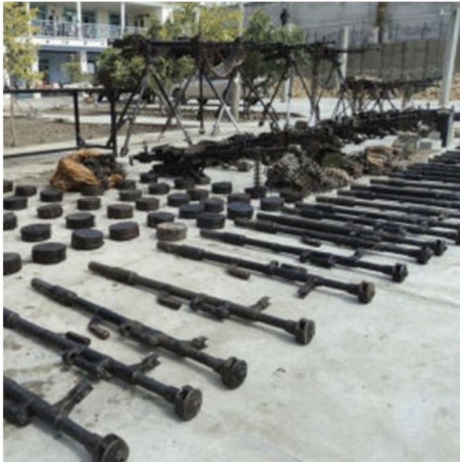
Iranian weaponry to the Taliban seized by international coalition forces in Afghanistan in 2011.

Lastly, Iran has even weaponized Afghanistan's environment. For example, the governor of Helmand Province accused the IRGC in 2017 of giving the Taliban weapons to attack Afghanistan's water infrastructure so that Iran could receive a larger portion of water from the Helmand River.