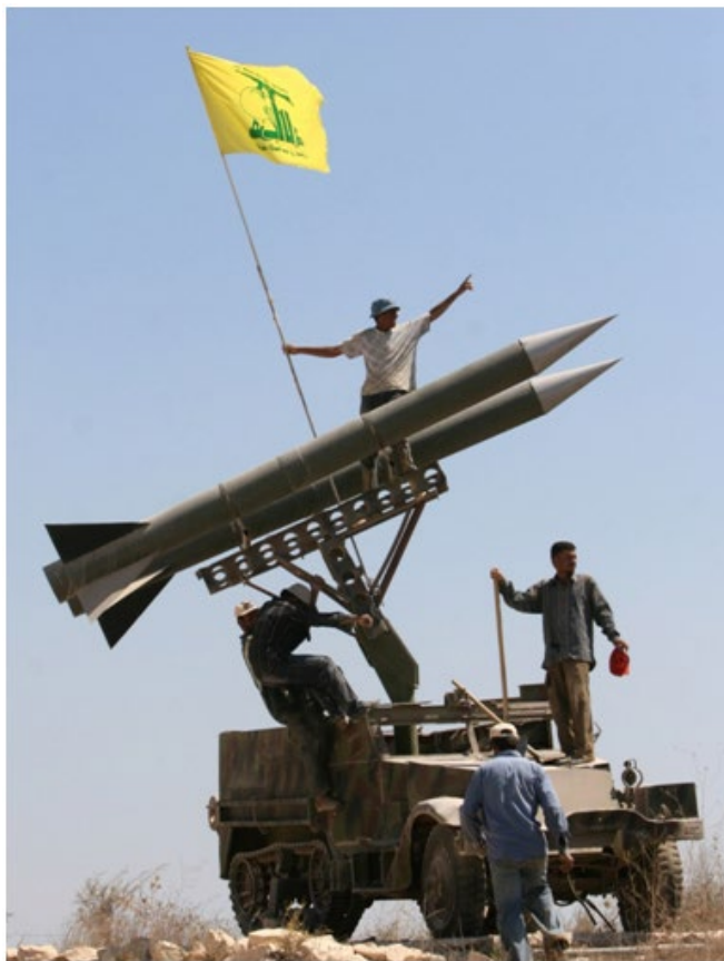
Iran supplies the rockets to Hezbollah which threaten Israel.

Now, only vestiges remain of Maronite preeminence in Lebanon. The Taif Agreement gave Sunni and Shiite Muslims parliamentary parity with Christians and increased the powers of their allocated key offices—prime minister and parliamentary speaker—at the expense of the Maronite-controlled presidency.