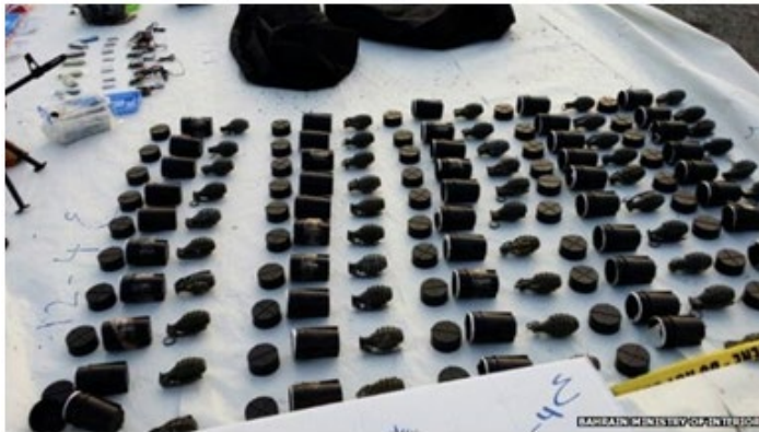
Iranian weapons and explosives seized by Bahraini authorities in December 2013.