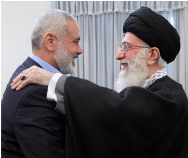
Supreme Leader Ayatollah Khamenei embracing Hamas leader Ismail Haniyeh in Tehran in 2012.

A key ideological pillar of the Islamic Republic of Iran is its struggle to “liberate” the Muslim lands of Palestine and the holy city of Jerusalem from what it disparagingly refers to as the illegitimate “Zionist Regime”. To help achieve these ends, Iran has supported Palestinian terrorist groups, despite the Sunni-Shi’a divide between them.