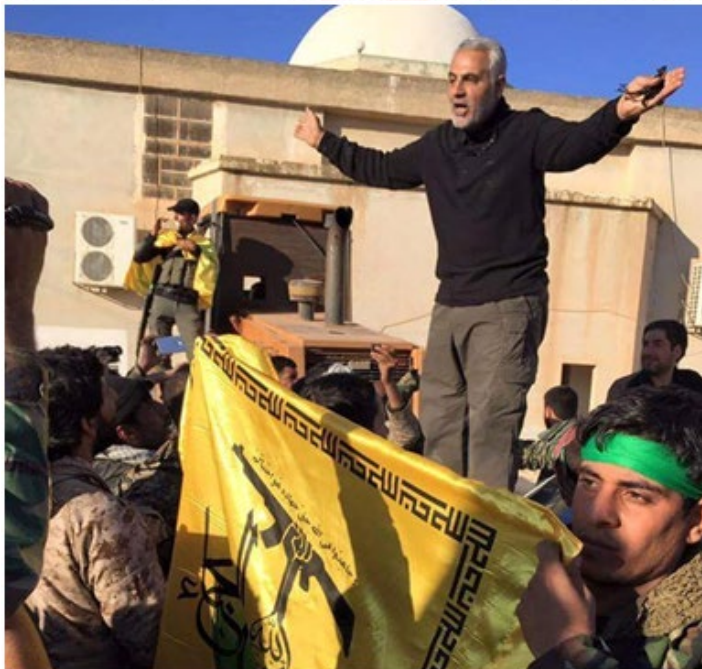
IRGC-Quds Force Commander Qassem Soleimani , who is said to be running the war in Syria, addressing Iran-backed fighters near Aleppo in 2015.