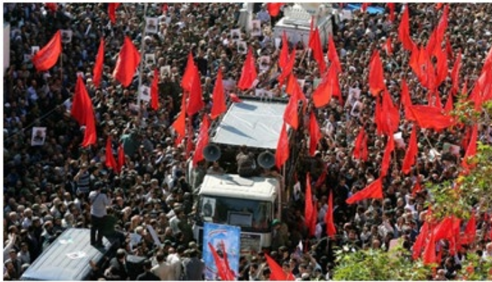
Funeral in Tehran for a senior IRGC commander killed fighting in Syria in 2015.