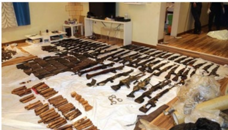
A cache of Iranian weapons seized by Kuwaiti authorities in August 2015.

In May 2018, Kuwait joined the U.S. and other Gulf states in sanctioning 9 Hezbollah-affiliated persons and entities, but did not join the other governments in designating Hezbollah Secretary-General Hassan Nasrallah as well.