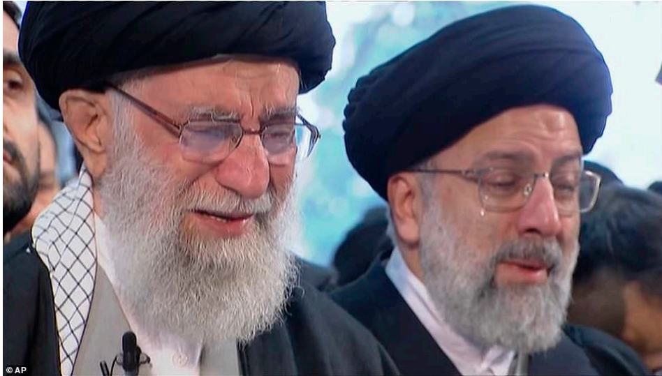
Left to Right: Supreme Leader Ayatollah Ali Khamenei and Chief Justice Ayatollah Ebrahim Raisi at the funeral of former IRGC-Quds Force Commander Qassem Soleimani