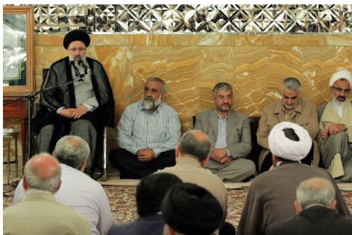
Seated from Left to Right: Ebrahim Raisi, former Commander of the IRGC-Basij Forces Mohammed Reza Naqdi, former Commander-in-Chief of the IRGC Mohammad Ali Jafari, and former Commander of the IRGC-Quds Force Qassem Soleimani

Beyond his contretemps against Rouhani, Raisi’s candidacy carried symbolic importance. Given the speculation surrounding him being a contender to succeed Khamenei as Supreme Leader, the presidency would be a natural steppingstone for Raisi because of Khamenei having previously served as president. It was a way for him to test his brand electorally as well as deploy the vast resources and platform that Astan-e Quds Razavi provides. In fact, Raisi’s candidacy carried the perceived imprimatur of the Islamic Revolutionary Guard Corps (IRGC). Pictures circulated of him in a chair, with senior commanders of the IRGC—including its then Commander-in-Chief Mohammad Ali Jafari and then Commander of the Quds Force Qassem Soleimani —seated at his knee. The picture was a sign of deference for Raisi.