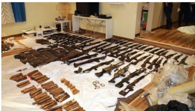
A cache of Iranian weapons seized by Kuwaiti authorities in August 2015.

Despite Iran's meddling and support for terrorism in Kuwait, Kuwait has sought to cultivate good relations with Tehran, placing it at odds with other GCC nations. For the first time since the 1979 Iranian Revolution, in June 2014 the Kuwaiti Emir, Shiekh Sabah al-Ahmad al Sabah, led a high-level delegation to visit Iran. As a result of this visit, Kuwait and Iran agreed to a memorandum of understanding, which went as far to say that the two countries would coordinate their security efforts. Unlike Saudi Arabia and Bahrain, Kuwait opted to maintain diplomatic ties with Iran even after Iran executed the prominent Saudi cleric, Nimr al-Nimr, and attacked the Saudi diplomatic missions in Iran in 2016. More recently, Kuwait has also sought to serve as a mediator in the dispute between Qatar and Saudi Arabia, the UAE, and Bahrain; a dispute which centers in part on Qatar's links to Tehran.