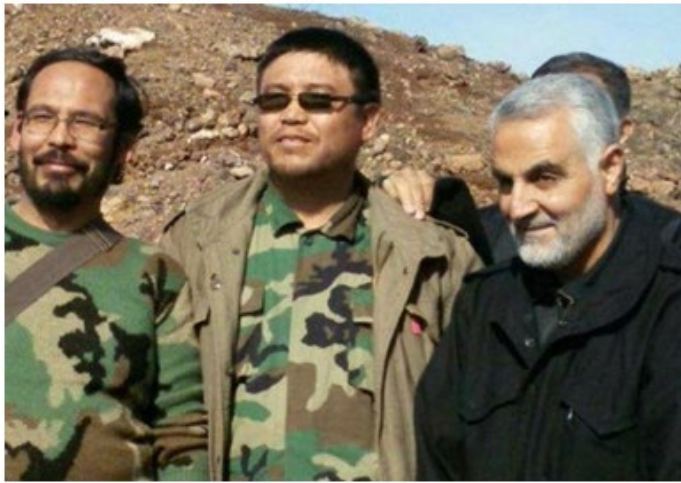
Former IRGC Quds-Force Commander Qasem Soleimani in Syria with commanders of the Iran-backed Fatemiyoun Brigade, an Afghan Shi'a militia.