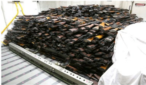
A shipment of Iranian weapons destined for the Houthis seized by American naval forces in the Arabian Sea in 2015.

In December 2017, the Houthis assassinated former Yemeni president Ali Abdullah Saleh, their erstwhile enemy and then ally, after he turned against them again and proposed reconciliation with the Saudi-led anti-Houthi coalition. Iranian leaders and regime-affiliated media outlets celebrated Saleh’s killing and said the Houthis are inspired by Iran’s 1979 Islamic Revolution and similar to Iranian-supported militant groups in Syria, Iraq, and Lebanon.