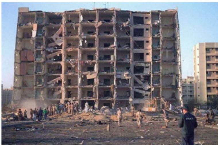
Iran was responsible for the 1996 Khobar Towers bombing which killed 19 American servicemen based in Dhahran, Saudi Arabia.

Evidence indicates that Iran is arming and, in some cases, directing the Houthis in their missile campaign, contrary to Tehran’s denials and in violation of an arms embargo imposed by the United Nations Security Council in April 2015. An independent U.N. monitoring panel stated in November 2017 that remnants from four ballistic missiles fired by the Houthis into Saudi Arabia likely came from the Iranian-made and designed Qiam-1 missile. In December 2017, US Ambassador to the U.N. Nikki Haley and Pentagon officials displayed debris from missiles fired into Saudi Arabia, claiming that the markings on and designs of the missiles demonstrated that they were made by Iran. The U.N.’s finding of Iranian origins in the Houthis’ missiles continued well into 2018, with panel after panel affirming the Iranian connection. One U.N. report from January 2018 found that recently inspected missiles and drones “show characteristics similar to weapons systems known to be produced in the Islamic Republic of Iran,” and, therefore, the panel “continues to believe” that Tehran is giving missiles and other arms to the Houthis. Indeed, Iran has recently bragged openly about their support for the Houthis, with an IRGC general telling IRGC-controlled media that the Guards had instructed the Houthis to attack two Saudi oil tankers in July 2018.