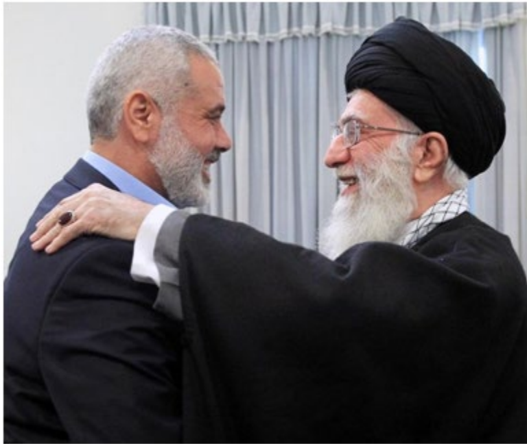
Supreme Leader Ayatollah Khamenei embracing Hamas leader Ismail Haniyeh in Tehran in 2012.

A key ideological pillar of the Islamic Republic of Iran is its struggle to “liberate” the Muslim lands of Palestine and the holy city of Jerusalem from what it disparagingly refers to as the illegitimate “Zionist Regime.” To help achieve these ends, Iran has armed, trained, and funded –often working indirectly through Hezbollah – Palestinian terrorist groups, despite the Sunni-Shi’a divide between them.