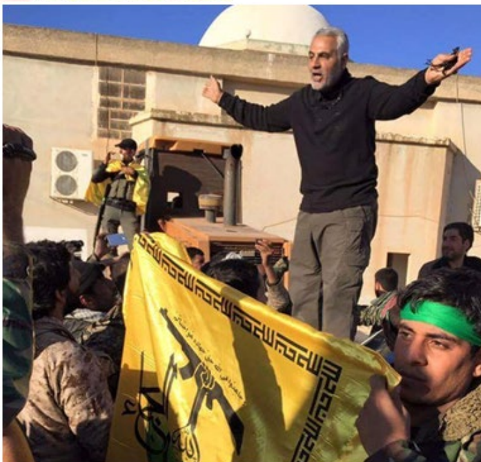
IRGC-Quds Force Commander Qassem Soleimani , who is said to be running the war in Syria, addressing Iran-backed fighters near Aleppo in 2015.