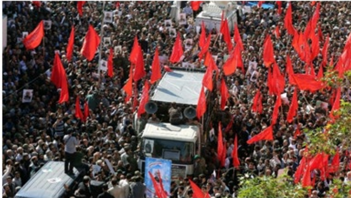
Funeral in Tehran for a senior IRGC commander killed fighting in Syria in 2015.

training and commanding pro-Assad militias; Iranian proxies from throughout the Middle East supplied additional manpower; and Iran even recruited and mobilized fighters from within Syria.