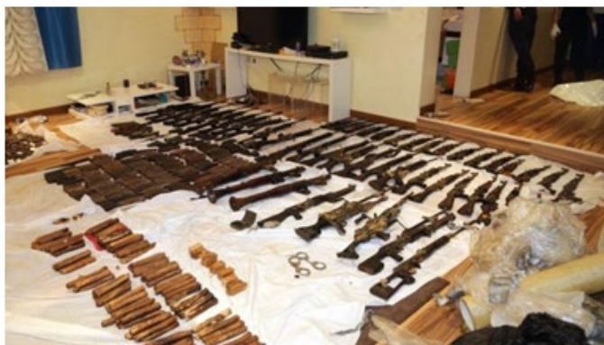
A cache of Iranian weapons seized by Kuwaiti authorities in August 2015.

Despite Iran's meddling and support for terrorism in Kuwait, Kuwait has sought to cultivate good relations with Tehran, placing it at odds with other GCC nations. For the first time since the 1979 Iranian Revolution, in June 2014 the Kuwaiti Emir, Shiekh Sabah al-Ahmad al Sabah, led a high-level delegation to visit Iran. As a result of this visit, Kuwait and Iran agreed to a memorandum of understanding, which went as far to say that the two countries would coordinate their security efforts. Unlike Saudi Arabia and Bahrain, Kuwait opted to maintain diplomatic ties with Iran even after Iran executed the prominent Saudi cleric, Nimr al-Nimr, and attacked the Saudi diplomatic missions in Iran in 2016. More recently, Kuwait has also sought to serve as a mediator in the dispute between Qatar and Saudi Arabia, the UAE, and Bahrain; a dispute which centers in part on Qatar's links to Tehran.