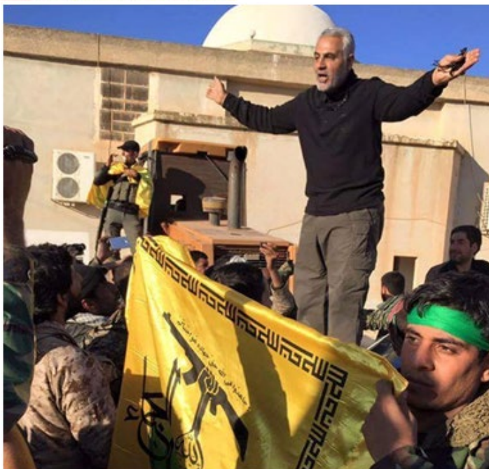
IRGC-Quds Force Commander Qassem Soleimani , who is said to be running the war in Syria, addressing Iran-backed fighters near Aleppo in 2015.