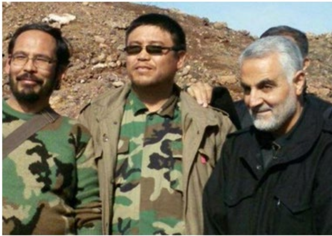
Former IRGC Quds-Force Commander Qasem Soleimani in Syria with commanders of the Iran-backed Fatemiyoun Brigade, an Afghan Shi'a militia.