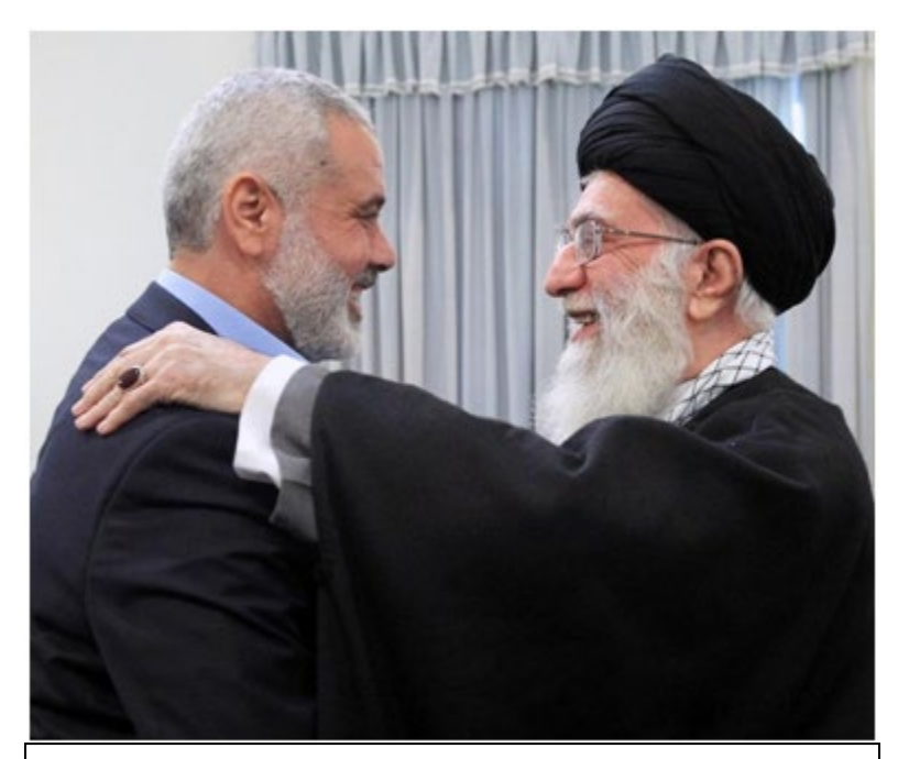
Supreme Leader <u>Ayatollah Khamenei</u> embracing Hamas leader Ismail Haniyeh in Tehran in 2012.

A key ideological pillar of the Islamic Republic of Iran is its struggle to "liberate" the Muslim lands of Palestine and the holy city of Jerusalem from what it disparagingly refers to as the illegitimate "Zionist Regime." To help achieve these ends, Iran has armed, trained, and funded —often working indirectly through Hezbollah—Palestinian terrorist groups like Hamas and Palestinian Islamic Jihad (PIJ), despite the Sunni-Shi'a divide between them.