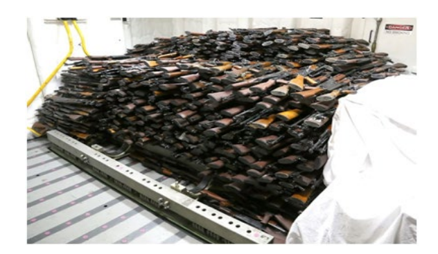
A shipment of Iranian weapons destined for the <u>Houthis</u> seized by American naval forces in the Arabian Sea in 2015.

potentially contributing to a ceasefire and the eight-year-long war's winding down. However, the administration has failed to acknowledge the drivers of Saudi Arabia's seeming tilt toward China, or how China's diplomatic foray into Middle East geopolitics could become advantageous to it, particularly when the U.S. intends to shift its attention to Eastern Europe and Asia.