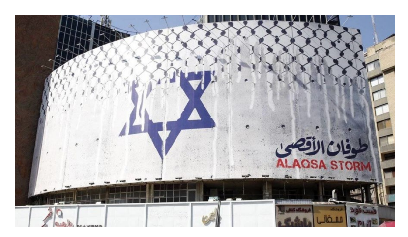
Billboard in Tehran's Vali Asr Square, which is managed by the IRGC's Owj Organisation, propagandizing Hamas' brutal assault on Israel that claimed the lives of over 900 Israelis. The billboard, which was unveiled a mere 24 hours after the assault on Israel, revealing Iran had foreknowledge of the attack