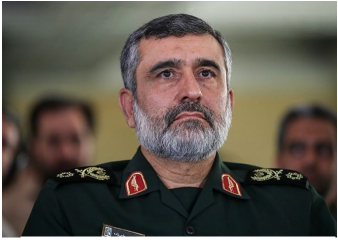
IRGC's Aerospace Commander Amir Hajizadeh

Hajizadeh <u>ascended</u> the ranks of the IRGC, and soon became commander of a missile unit in the war. In 2003, he was elevated to command Iran's air defense systems.