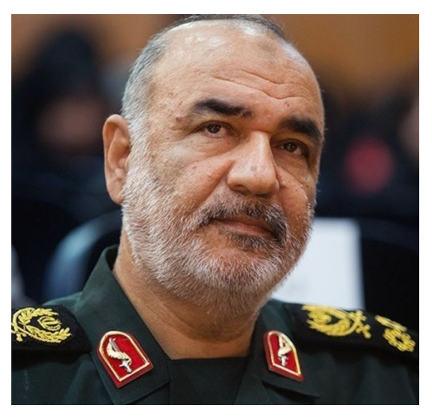
Top IRGC Commander Hossein Salami

The top commander of the IRGC, Major General Hossein Salami, and his six branch commanders oversee the implementation of the IRGC's mandate. According to Iranian law, the IRGC's purpose is "to protect the Islamic Revolution of Iran and its accomplishments, while striving continuously...to spread the sovereignty of God's law." To these ends, the IRGC combines conventional and unconventional military roles with a relentless effort to pursue and punish domestic dissenters. Salami believes violence is justified as an instrument to impose conservative Islamic dictates and suppress opposition movements. He claims that the U.S. should be evicted from the Middle East, and the "Zionist regime" wiped off the map. The other IRGC commanders parrot similar statements, reflecting the goals that drive this hyperaggressive institution.