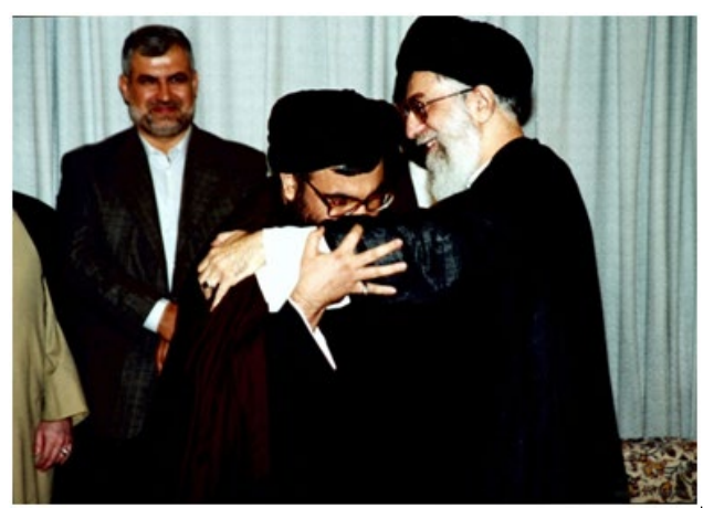
Hezbollah Secretary General <u>Hassan Nasrallah</u> (L) embracing and showing deference to Iranian Supreme Leader <u>Ayatollah Khamenei</u> (R)

Maronite preeminence was built into Lebanon's early system. The 1943 National Pact—an informal agreement divvying up sectarian political power in the country—afforded the Maronites primacy of place based on the 1932 census, when the Eastern Christian sect formed a majority, and gave Christians the country's most powerful political offices and a 6:5 majority in parliament. This census was the last Lebanon would ever conduct, in order to maintain the fiction of sectarian balance and avoid religious conflict.