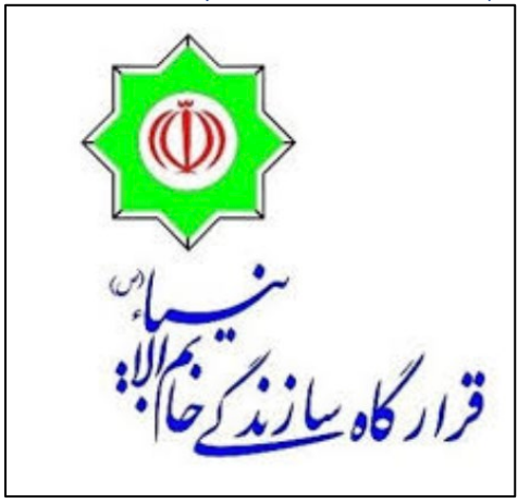
The Khatam al-Anbiya Construction Headquarters Seal

The Khatam al-Anbiya ("Seal of the Prophet") Construction Headquarters is the IRGC's engineering and construction branch. Under the command of an IRGC general, the economic conglomerate is one of the IRGC's main sources of revenue. First, this section introduces the commander of Khatam al-Anbiya Construction Headquarters (herein referred to as Khatam al-Anbiya), Brigadier General Hossein Hoosh al-Sadat. After that, it briefly describes how the former military engineering corps amassed such wealth. Finally, it turns to the core function of Khatam al-Anbiya: funding the IRGC operations discussed throughout this resource.