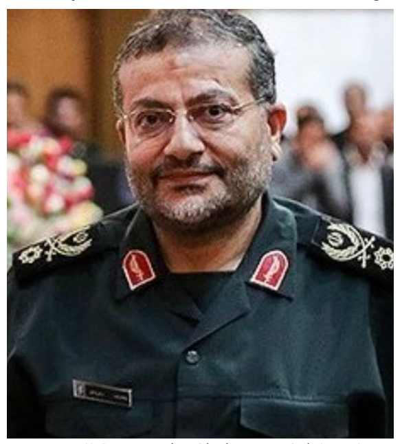
Basij Commander Gholamreza Soleimani

Brigadier General Gholamreza Soleimani—a U.S.- and E.U.-designated human rights abuser in charge of the Basij when it massacred peaceful Iranians protesting abrupt gas price increases, repression and corruption in November 2019—commands the volunteer paramilitary. Previously, he served as commander of the Saheb-Al-Zaman Provincial Corps in Esfahan Province. While there, he hailed the need for the formation of a resistance economy for development and lashed out against the then-Rouhani government. Like most other IRGC commanders, Soleimani assumed his post with a commitment to the regime's hegemonic aspirations. However, his branch focuses on maintaining internal security, more than promoting outward expansion. He professes that Iran's unique democratic system of government with spiritual elements should serve as a model of governance for other countries. The pursuit of hegemony, in other