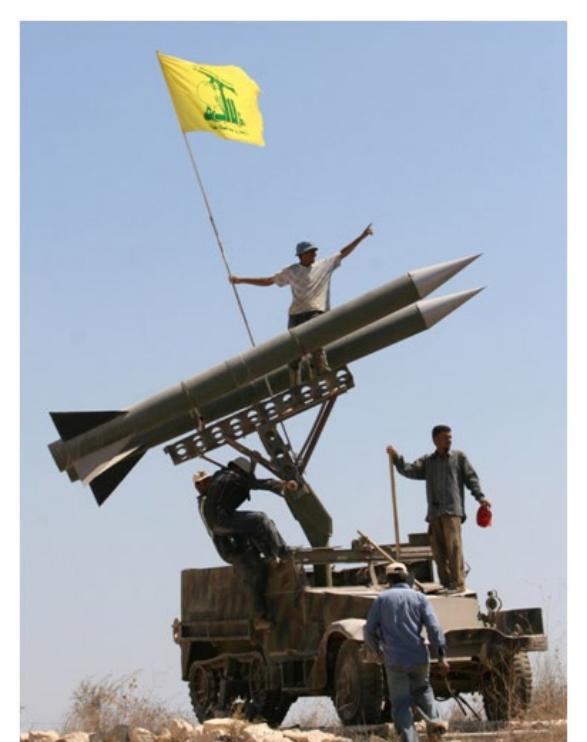
Iran supplies the rockets to Hezbollah which threaten Israel.

Now, only vestiges remain of Maronite preeminence in Lebanon. The Taif Agreement gave Sunni and Shiite Muslims parliamentary parity with Christians and increased the powers of their allocated key offices—prime minister and parliamentary speaker—at the expense of the Maronite-controlled presidency.