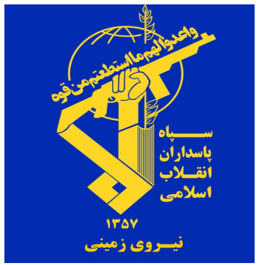
The IRGC's Ground Force Seal

This section begins with a brief account of the U.S. and European perspectives on the current commander of the Ground Force, Brigadier General Mohammad Pakpour. The second part includes a historical account of the Ground Force's national defense doctrine, which is based on assumptions similar to those of the Basij. The third part covers the Ground Force's role in internal security, national defense, and foreign military operations.