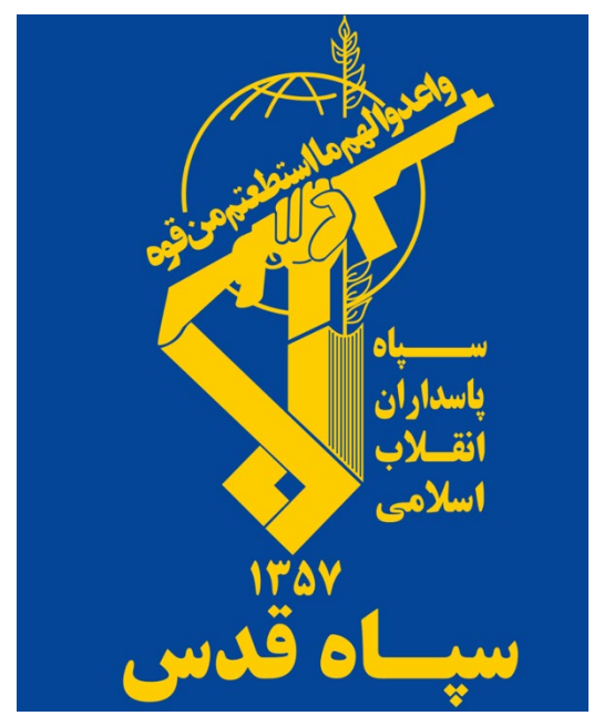
The IRGC's Quds Force Seal

The Quds Force is the IRGC wing responsible for external operations. Thus, this section focuses on foreign activities, and does not offer insights into the Quds Force's role in national defense. It should be noted, though, that its skills would lend well to the "Mosaic Doctrine," which, as described above, emphasizes unconventional tactics. The first part briefly describes <a href="Essmail Qaani">Essmail Qaani</a>, the current Quds Force commander, in relation to the former Quds Force commander, <a href="Qassem Soleimani">Qassem Soleimani</a>. The second part discusses the IRGC's unconventional tactics; and its focus on proxy wars, the primary way in which Tehran advances its foreign policy interests in the region. The third part looks at Quds Force operations in the strategic countries of <a href="Iraq">Iraq</a>, <a href="Syria">Syria</a>, <a href="Lebanon">Lebanon</a>, and <a href="Yemen">Yemen</a>.