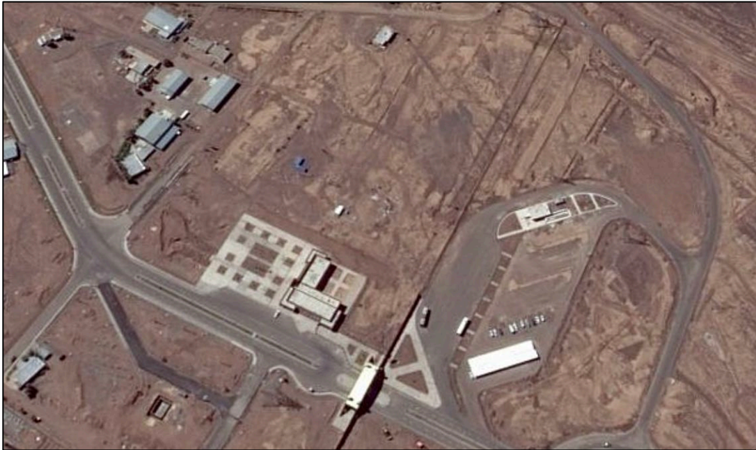
Fordow Fuel Enrichment Plant.

IRGC base have led analysts to speculate that the facility is being used to produce weapons-grade uranium.