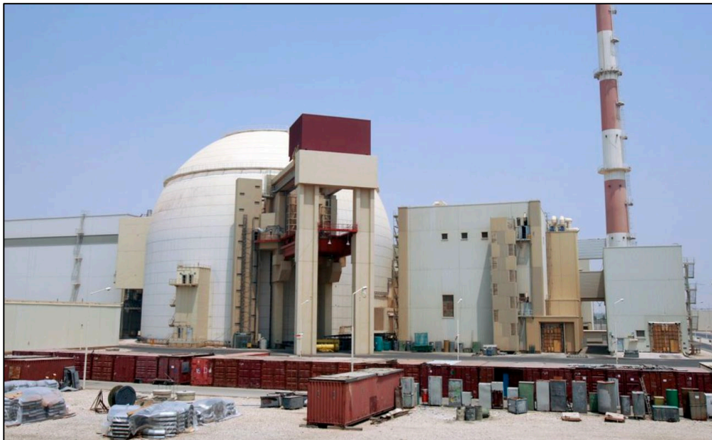
Bushehr Nuclear Power Plant.

The Bushehr reactor has raised safety concerns due to its unique hybrid design, which involves using Russian and older German equipment, some of which have failed since the plant began operations. Additionally, the plant's proximity to a major fault line in a region prone to earthquakes adds to the concerns.