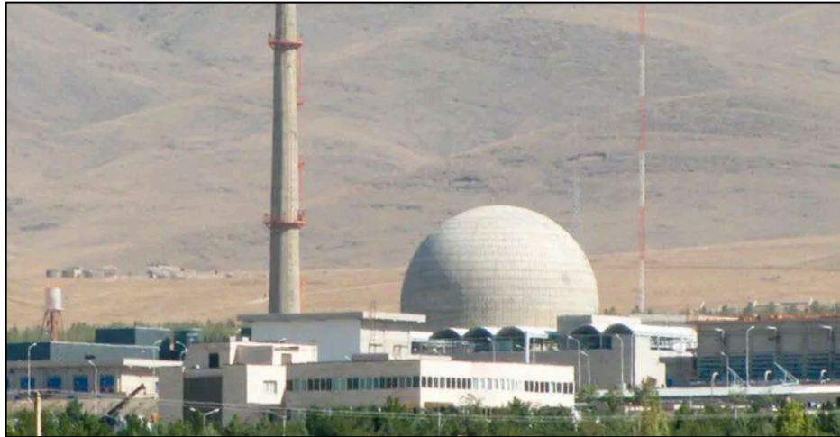
Arak Heavy Water Reactor.

their suitability for the production of high-quality, weapons-grade plutonium. Analysts estimate that the IR-40 will have the capability to produce approximately 9 kilograms of plutonium per year.