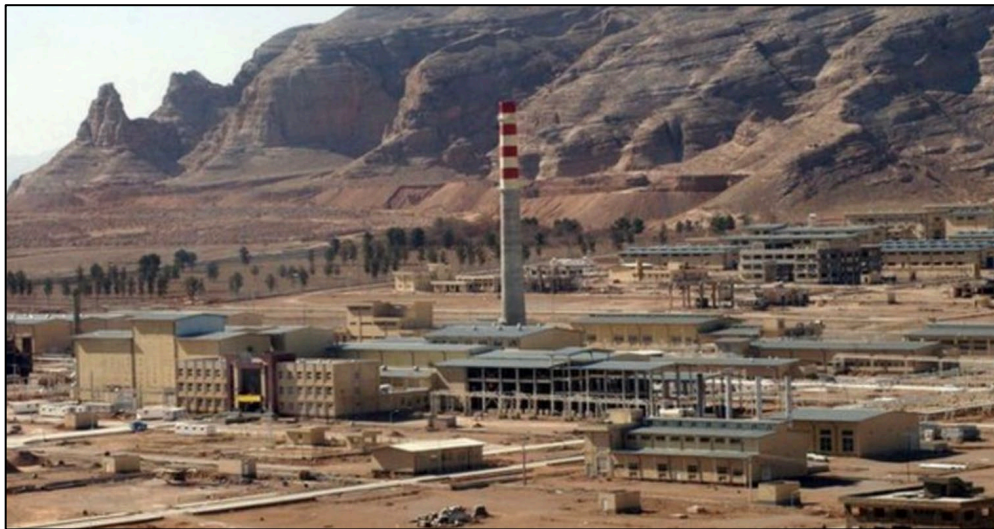
Isfahan Uranium Conversion Facility.

In March 2022, the IAEA identified a discrepancy at the UCF in the quantity of nuclear material verified by the IAEA and that declared by Iran. Iran declared the dissolution of 302.7 kg of natural uranium from the Jaber Ibn Hayan Multipurpose Laboratory at the Tehran Nuclear Research Center. As of April 2023, Iran had not adequately explained the surplus nuclear material. According to some media reports, Iran may have added undeclared material from Lavisan-Shian. The discrepancy makes Iran non-compliant with Article 55 of the Safeguards Agreement, a key part of the Nuclear Non-Proliferation Treaty (NPT). The UCF is a critical step toward producing highly-enriched uranium for nuclear weapons. Several anti-aircraft missile batteries are deployed in the area.