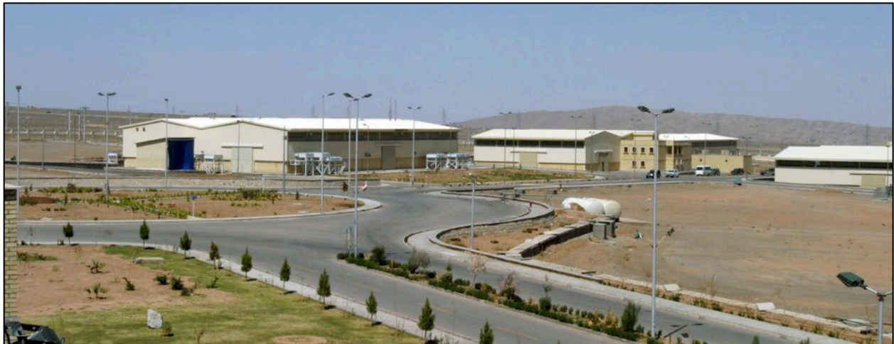
Natanz Fuel Enrichment Complex.

A previously clandestine underground uranium enrichment facility, whose existence Iran acknowledged in February 2003, the Natanz Fuel Enrichment Complex is the primary site of Iran's gas centrifuge program. The complex began construction in 2000 but was not disclosed to the IAEA until 2002, when a dissident group first identified it. The complex consists of the above-ground Pilot Fuel Enrichment Plant (PFEP) and the underground Fuel Enrichment Plant (FEP).