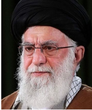
Supreme Leader Ayatollah Khamenei (January 1, 2020)

“Look at what the U.S. is doing in Iraq and Syria. They’re taking revenge on the Hashd al-Sha’bi for defeating ISIS. Since Hashd crippled and destroyed ISIS—which the U.S. had created—they’re taking revenge. The Iranian government and nation and I strongly condemn the U.S.’ malice.”