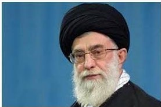
Supreme Leader Ayatollah Khamenei (January 30, 2012)

"We have problems with the U.S.A. over dozens of issues...Nothing has changed. The U.S.A. is still the Great Satan in our view."