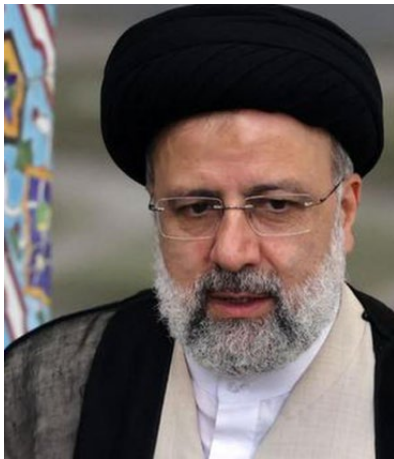
President Ebrahim Raisi (April 3, 2022)

“What is happening in Europe today has been seen all over the world before. The fate of many countries shows America pursues its own interests against the interests of its allies,” Raisi said before the U.N. General Assembly. “Unilateralism has been the tool to hold many countries back.”