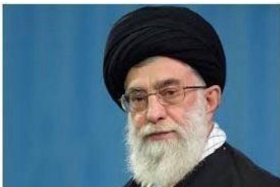
Supreme Leader Ayatollah Khamenei (February 8, 2019)

"I warn the U.S. president, CIA director, secretary of defense, secretary of state and other American officials involved in the assassination of martyr Soleimani that they must learn the clandestine lifestyle of Salman Rushdie because the Islamic Republic will avenge the blood of martyr Soleimani which was shed unrightfully."