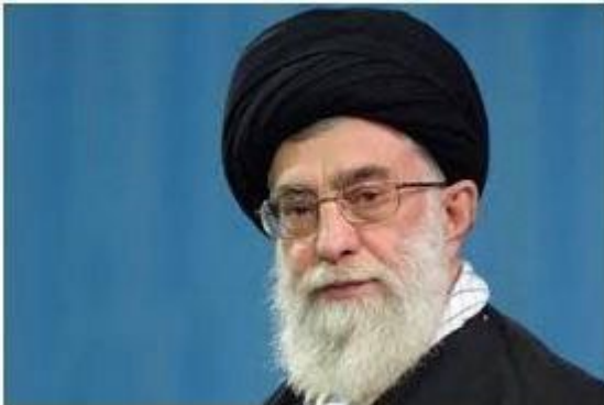
Supreme Leader Ayatollah Khamenei (June 12, 2017)

“The United States is an international Zionist agent, the creator of the ISIS terrorist group, as well as takfiri terrorist fronts. Therefore, do you expect the US president not to be angry at IRGC that stands against ISIS? They are angry, because today the Islamic Republic of Iran has managed to spoil their plots in Lebanon, Syria, Iraq, etc.”