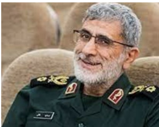
Brigadier General Esmail Ghaani, Commander of the IRGC's Quds Force (January 1, 2021)

"I warn the U.S. president, CIA director, secretary of defense, secretary of state and other American officials involved in the assassination of martyr Soleimani that they must learn the clandestine lifestyle of Salman Rushdie because the Islamic Republic will avenge the blood of martyr Soleimani which was shed unrightfully."