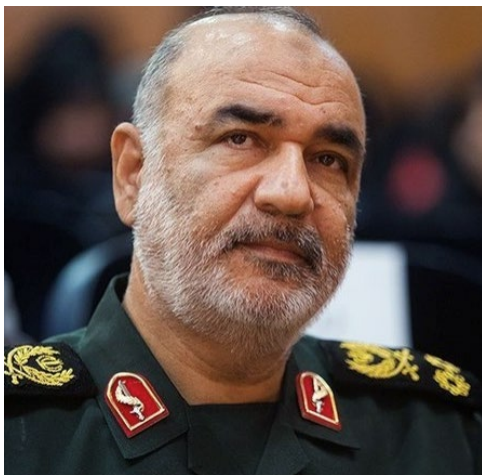
Major General Hossein Salami, Commander-in-Chief of the IRGC (November 4, 2021)

"If Trump and (former Secretary of State Mike) Pompeo are not tried in a fair court for the criminal act of assassinating General Soleimani, Muslims will take our martyr's revenge... The aggressor, murderer and main culprit – the then-president of the United States – must be tried and judged under the (Islamic) law of retribution, and God's ruling must be carried out against him," Raisi added.