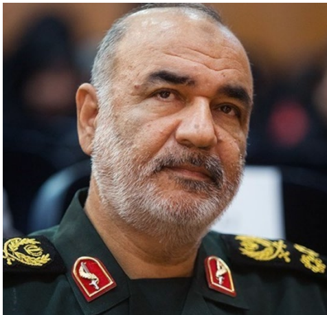
Major General Hossein Salami, Commander of the IRGC (November 25, 2019)

"Martyr Soleimani was such a great character that if all American leaders are killed, this will still not avenge his assassination... We should avenge him by following Soleimani's path and through other methods."