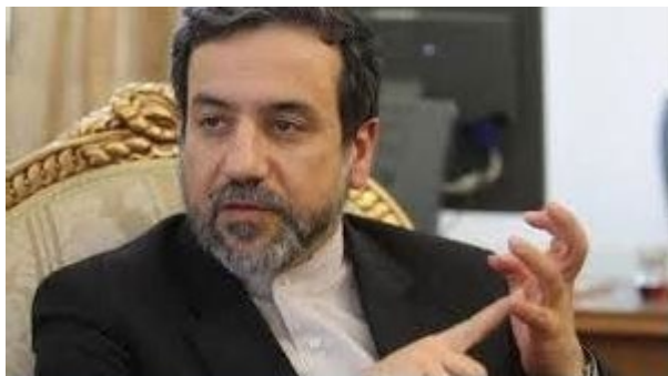
Then Deputy Foreign Minister Abbas Araghchi (February 9, 2014)

"We have problems with the U.S.A. over dozens of issues...Nothing has changed. The U.S.A. is still the Great Satan in our view."