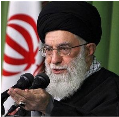
Supreme Leader Ayatollah Khamenei (October 18, 2017)

“Look at what the U.S. is doing in Iraq and Syria. They’re taking revenge on the Hashd al-Sha’bi for defeating ISIS. Since Hashd crippled and destroyed ISIS—which the U.S. had created—they’re taking revenge. The Iranian government and nation and I strongly condemn the U.S.’ malice.”