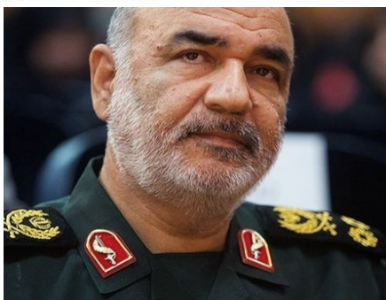
Major General Hossein Salami, Commander-in-Chief of the IRGC (November 4, 2021)

“The less developed countries whose armies are completely under the control of the U.S. Army and the like are in an even worse situation.”