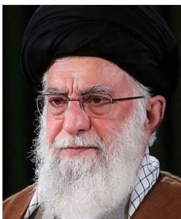
Supreme Leader Ayatollah Khamenei (July 18, 2015)

"As long as America continues its wickedness, the Iranian nation will not abandon 'Death to America.'"