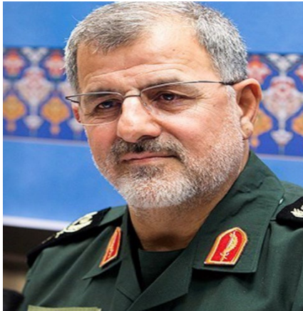
Brigadier General Mohammad Pakpour, Commander of IRGC's Ground Forces (April 13, 2022)

"Martyr Soleimani was such a great character that if all American leaders are killed, this will still not avenge his assassination... We should avenge him by following Soleimani's path and through other methods."