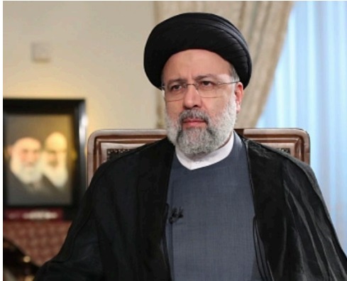
President Ebrahim Raisi (September 21, 2022)

“What is happening in Europe today has been seen all over the world before. The fate of many countries shows America pursues its own interests against the interests of its allies,” Raisi said before the U.N. General Assembly. “Unilateralism has been the tool to hold many countries back.”