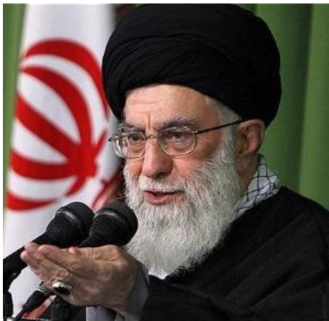
Supreme Leader Ayatollah Khamenei (October 6, 2021)

“Any country in the region, which turns a blind eye to the hegemonic goals of the United States and the Zionist regime, will not only step on the rights of its nation, but will also invoke the wrath of the Muslim nations,” Raisi said in a phone call with his Iraqi counterpart, then-President Barham Salih.