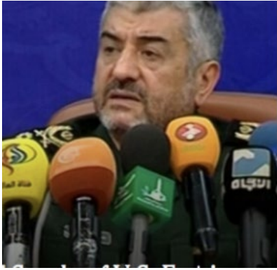
IRGC Then-Commander-in-Chief Mohammad Ali Jafari (September 1, 2015)

"We should not be cheated by the new slogans of this country... [America is still the] same Great Satan."