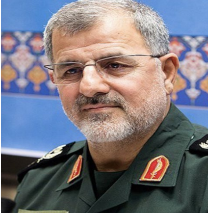
Brigadier General Mohammad Pakpour, Commander of IRGC's Ground Forces (April 13, 2022)

"Martyr Soleimani was such a great character that if all American leaders are killed, this will still not avenge his assassination... We should avenge him by following Soleimani's path and through other methods."