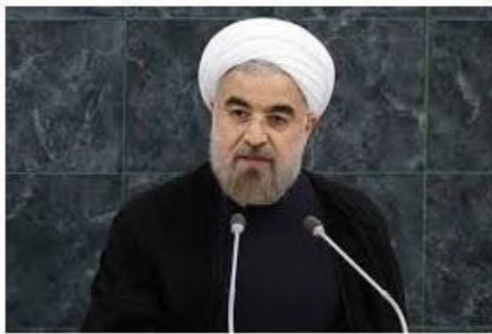
Then President Hassan Rouhani (January 7, 2015)

"The Islamic Revolution of Iran disrupted the atmosphere of political domination, and a unique and amazing victory over American policy occurred. It shattered the American political order that sought to rule half of the planet. This was the beginning of a great jihad (endeavor for the sake of God) on the part of the Iranian nation to recover the grandeur it had lost."