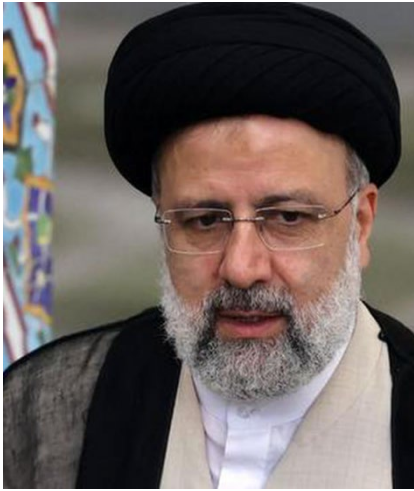
President Ebrahim Raisi (January 3, 2022)

"If Trump and (former secretary of state Mike) Pompeo are not tried in a fair court for the criminal act of assassinating General Soleimani, Muslims will take our martyr's revenge...The aggressor, murderer and main culprit - the then president of the United States - must be tried and judged under the (Islamic) law of retribution, and God's ruling must be carried out against him," Raisi added."