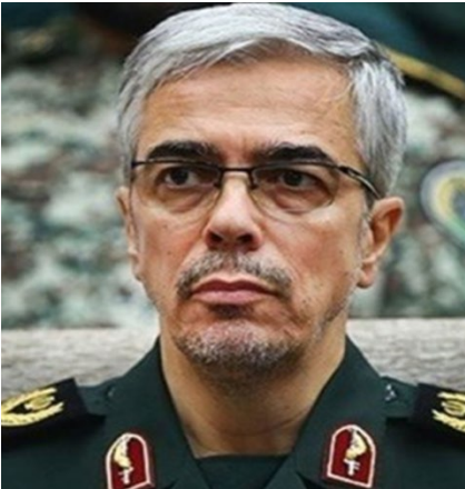
Major General Mohammad Bagheri, Chief of Staff of Iran's Armed Forces (May 14, 2021)

"We warn the Zionist regime and its supporters...especially the Great Satan and the terrorist regime of America that the Islamic Resistance Front...will turn the existence [of Zionists in the region] to a heap of ash."