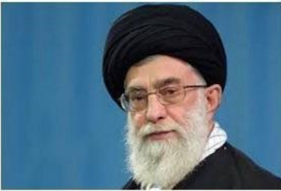
Supreme Leader Ayatollah Khamenei (January 1, 2022)

"If Trump and (former secretary of state Mike) Pompeo are not tried in a fair court for the criminal act of assassinating General Soleimani, Muslims will take our martyr's revenge...The aggressor, murderer and main culprit - the then president of the United States - must be tried and judged under the (Islamic) law of retribution, and God's ruling must be carried out against him," Raisi added."