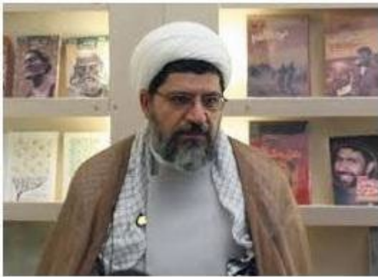
Supreme Leader's then Representative to the IRGC's Quds Force Ali Shirazi (February 26, 2015)

"Martyr Soleimani was such a great character that if all American leaders are killed, this will still not avenge his assassination... We should avenge him by following Soleimani's path and through other methods."