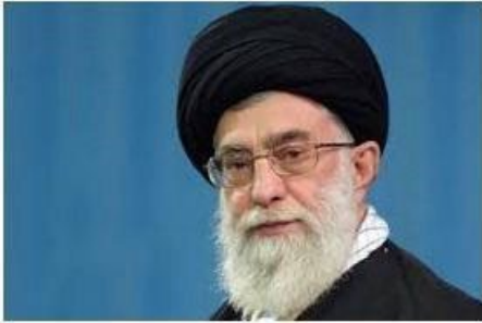
Supreme Leader Ayatollah Khamenei (October 6, 2021)

"The less developed countries whose armies are completely under the control of the U.S. Army and the like are in an even worse situation."