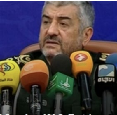
IRGC Then-Commander-in-Chief Mohammad Ali Jafari (July 31, 2018)

"We warn the Zionist regime and its supporters...especially the Great Satan and the terrorist regime of America that the Islamic Resistance Front...will turn the existence [of Zionists in the region] to a heap of ash."