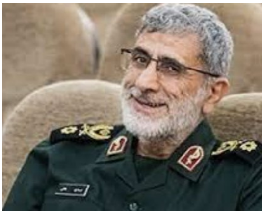
Brigadier General Esmail Ghaani, Commander of the IRGC's Quds Force (January 1, 2021)

"Trump and others like him will be forgotten and lost in the dustbin of history, of course after paying for their crimes in the world."