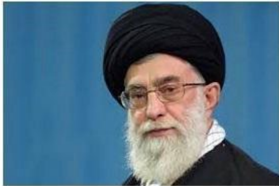
Supreme Leader Ayatollah Khamenei (October 13, 2014)

"Enemy spy services are behind the efforts to sow disunity among Muslims... A Shia version connected to the British spy agency- the MI6- and a Sunni version, which is the mercenary of the CIA, are both fake and working against Islam."