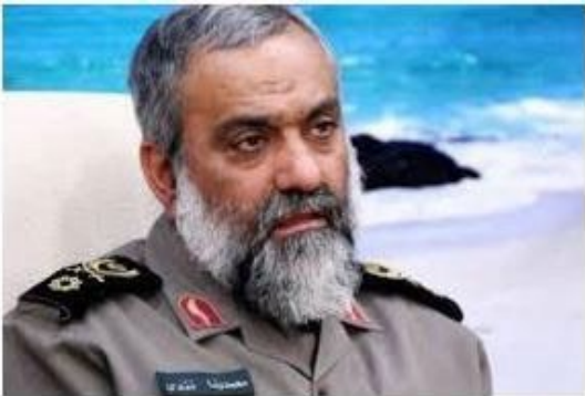
Then Basij Commander Mohammad Reza Naqdi (January 1, 2015)

"We will stand fast against the world of arrogance. We will not rest until we have raised the banner of Islam over the White House."