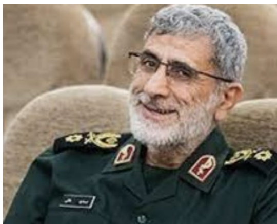
Brigadier General Esmail Ghaani, Commander of the IRGC's Quds Force (January 8, 2022)

"We do not need to be present as supervisors everywhere, wherever is necessary we take revenge against Americans by the help of people on their side and within their own homes without our presence."