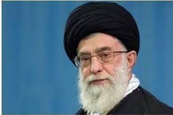
Supreme Leader Ayatollah Khamenei (January 30, 2012)

"We have problems with the U.S.A. over dozens of issues...Nothing has changed. The U.S.A. is still the Great Satan in our view."