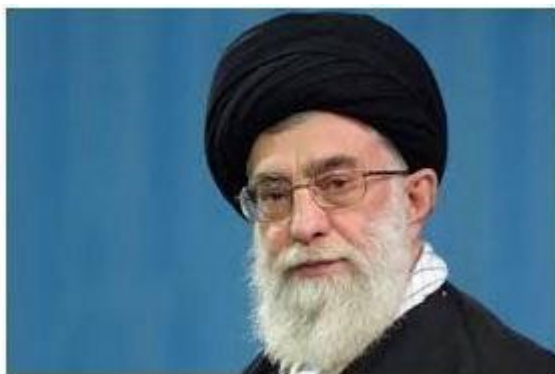
Supreme Leader Ayatollah Khamenei (April 23, 2011)

"The world of hegemony and arrogance is seeking to undermine Islam and dominate Muslim lands."