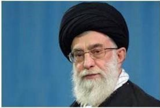
Supreme Leader Ayatollah Khamenei (January 9, 2015)

"Enemy spy services are behind the efforts to sow disunity among Muslims... A Shia version connected to the British spy agency- the MI6- and a Sunni version, which is the mercenary of the CIA, are both fake and working against Islam."