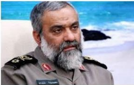
Then Basij Commander Mohammad Reza Naqdi (September 13, 2014)

"If anyone fuels the fire in this regard, he or she will definitely be helping sinister America and Britain which are the creators of the ISIL and al-Qaeda."