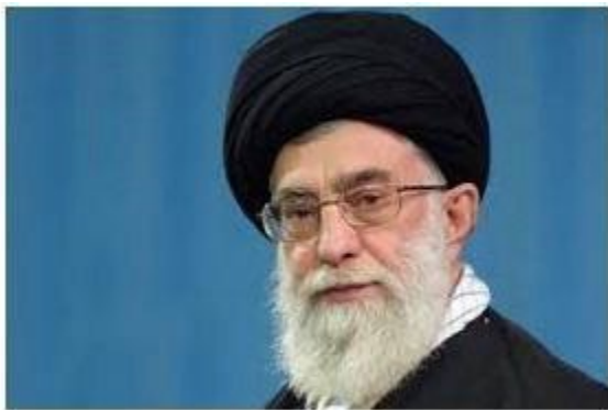
Supreme Leader Ayatollah Khamenei (October 18, 2017)

"The Iranian nation has many differences with those nations that submit to domination, and will never allow its authorities to hold talks and meetings with the Great Satan."