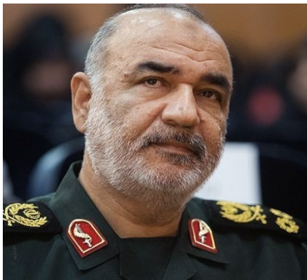
Major General Hossein Salami, Commander-in-Chief of the IRGC (November 4, 2021)

"The less developed countries whose armies are completely under the control of the U.S. Army and the like are in an even worse situation."