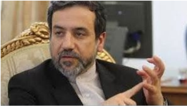
Deputy Foreign Minister Abbas Araghchi (February 9, 2014)

"Some people insist on disguising this Great Satan as the savior angel. (However,) the Iranian nation expelled this Satan (from the country); we must not allow that when we expelled it through the door, it could return and gain influence (again) through the window."