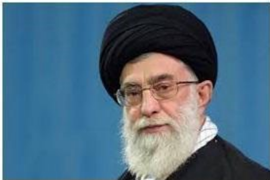
Supreme Leader Ayatollah Khamenei (October 13, 2014)

"Enemy spy services are behind the efforts to sow disunity among Muslims... A Shia version connected to the British spy agency- the MI6-and a Sunni version, which is the mercenary of the CIA, are both fake and working against Islam."