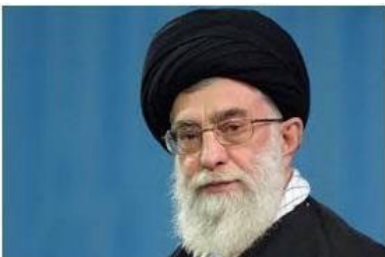
Supreme Leader Ayatollah Khamenei (October 18, 2017)

"Look at what the U.S. is doing in Iraq and Syria. They're taking revenge on the Hashd al-Sha'bi for defeating ISIS. Since Hashd crippled and destroyed ISIS—which the U.S. had created—they're taking revenge. The Iranian government and nation and I strongly condemn the U.S.' malice."