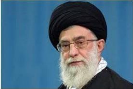
Supreme Leader Ayatollah Khamenei (June 12, 2017)

That US arms a terrorist group is what causes instability. Who created #ISIS? The US!