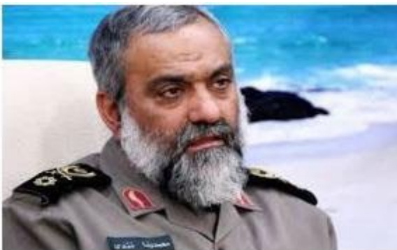
Basij Commander Mohammad Reza Naqdi (September 13, 2014)

"If anyone fuels the fire in this regard, he or she will definitely be helping sinister America and Britain which are the creators of the ISIL and al-Qaeda."