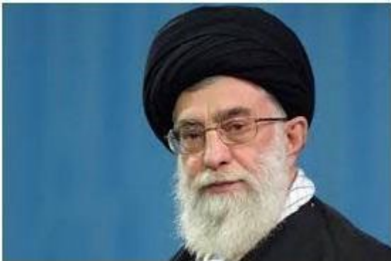
Supreme Leader Ayatollah Khamenei (January 9, 2015)

That US arms a terrorist group is what causes instability. Who created #ISIS? The US!