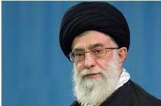
Supreme Leader Ayatollah Khamenei (January 30, 2012)

"We have problems with the U.S.A. over dozens of issues...Nothing has changed. The U.S.A. is still the Great Satan in our view."