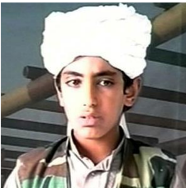
Hamza bin Laden

Connection: Under the auspices of the Quds Force, Osama's son Saad reportedly fled to Iran to escape the U.S.-led invasion of Afghanistan. In Iran, he assumed a more senior and active role in Al Qaeda, including planning terrorist operations abroad. As of 2008, the U.S. government believed Saad might have relocated to Pakistan with the assent of Iran. In 2010 Saad bin Laden reportedly traveled from Iran to Pakistan. In September 2012, Al Qaeda leader Ayman al-Zawahiri confirmed in a videotape that Saad was killed in a drone strike.