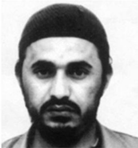
Abu Musab al-Zarqawi