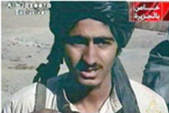
Saad Bin Laden

Connection: Following the U.S. invasion of Afghanistan, Iran provided safe haven to Al Qaeda operative Abu Musab al-Zarqawi, who went on to establish Al Qaeda in Iraq. Zarqawi initially operated under the protection of the IRGC and its elite Quds Brigade. According to intelligence officials, the time Zarqawi spent in Iran was crucial for rebuilding his network before relocating to Iraq. Al-Zarqawi was killed in 2006 U.S. drone strike.